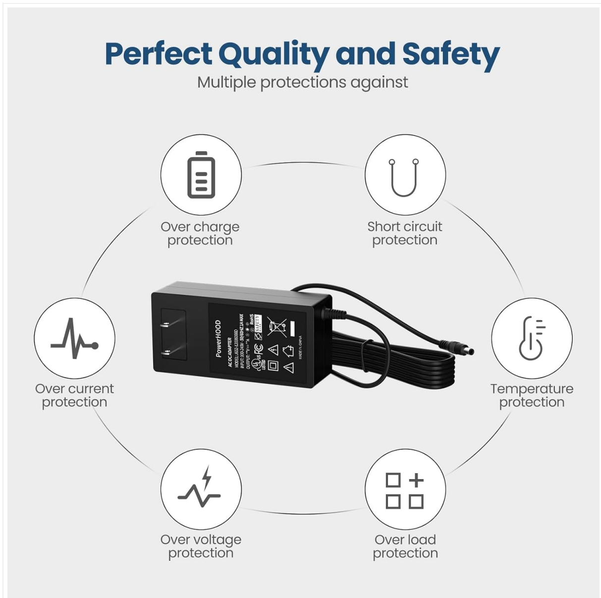
Image 6.1: The PowerHOOD adapter highlighting its multiple protection features, including overcharge, short circuit, over current, temperature, over voltage, and overload protection.