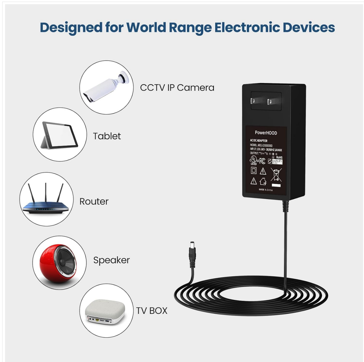
Image 5.1: The PowerHOOD adapter shown with icons representing compatible devices such as CCTV IP cameras, tablets, routers, speakers, and TV boxes.

It is also suitable for various other electronic devices that require a 12V DC input and have a compatible barrel tip connector. Always verify the voltage and connector type requirements of your device before use.