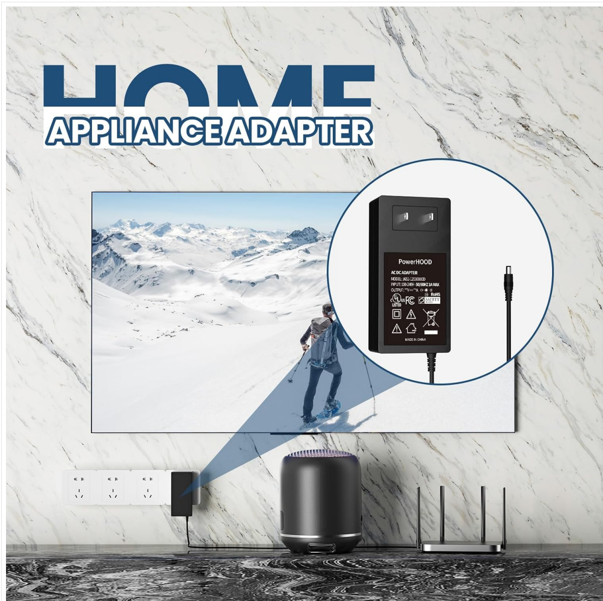
Image 3.1: The PowerHOOD adapter connected to a wall outlet and powering a device. This illustrates a typical setup for home use.