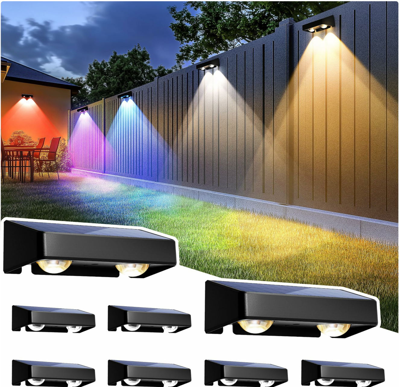
Image: An 8-pack of SOLPEX Solar Fence Lights in black, showcasing the product packaging and the lights themselves.