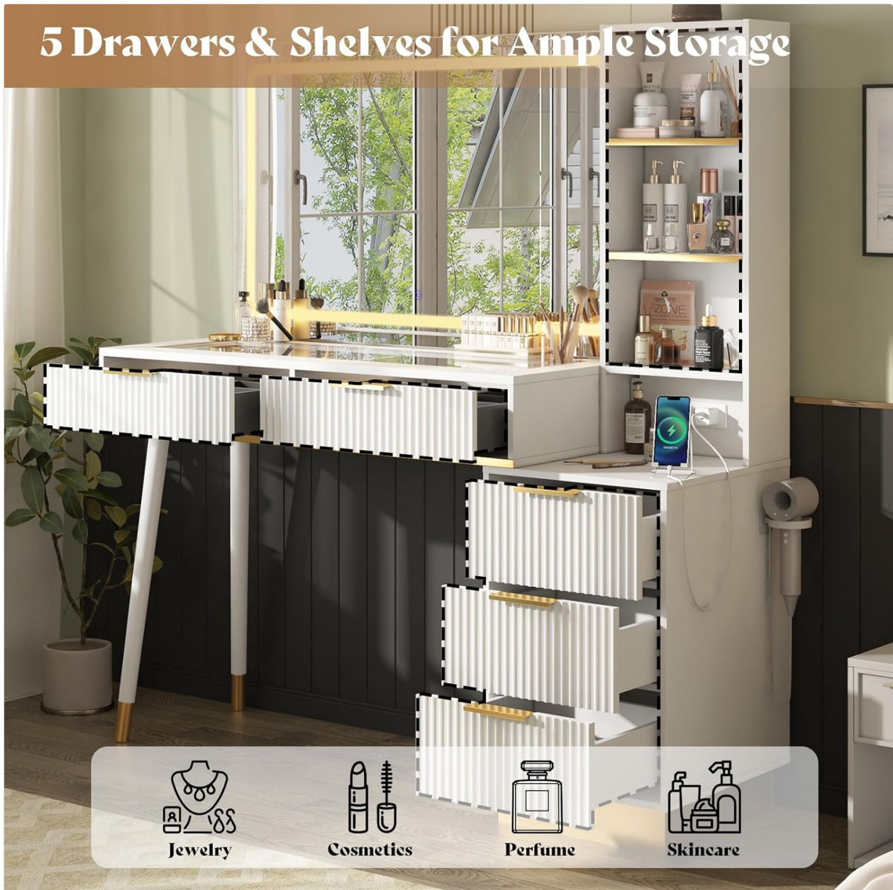
Figure 4.4: Overview of storage capacity.