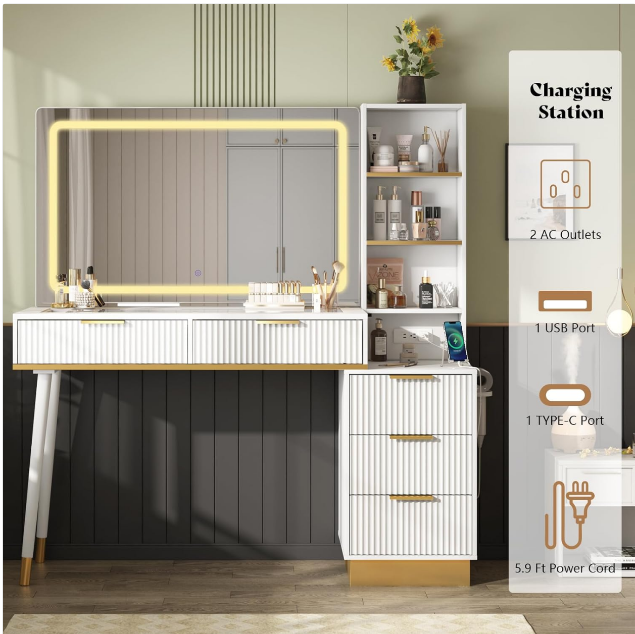
Figure 4.2: Close-up of the integrated charging station.