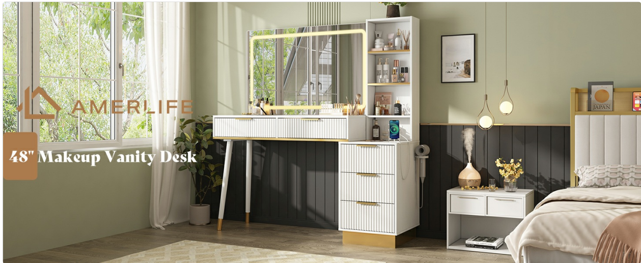
Figure 2.1: Overall dimensions and component breakdown of the vanity desk.