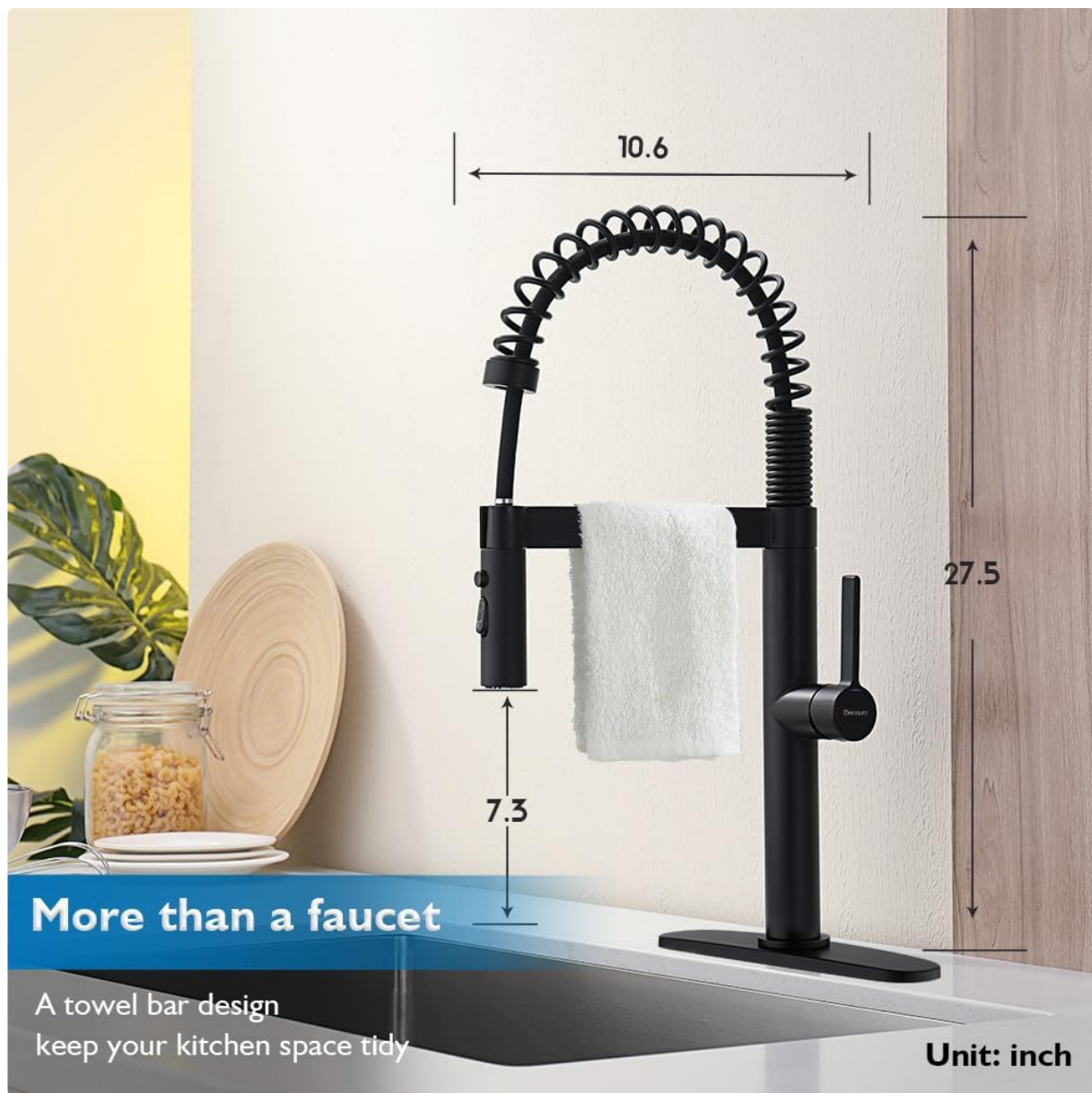
Image: Detailed dimensions of the Decaura Kitchen Faucet, including height and spout reach.