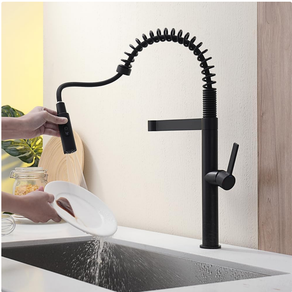
Image: Proper placement of the gravity ball on the pull-down hose for optimal retraction.