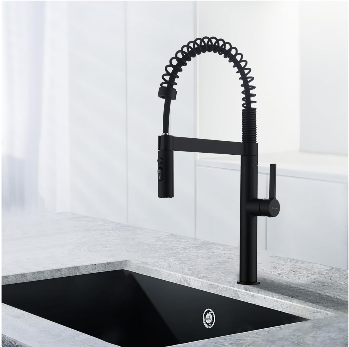
Image: All mounting accessories and parts included for installation.