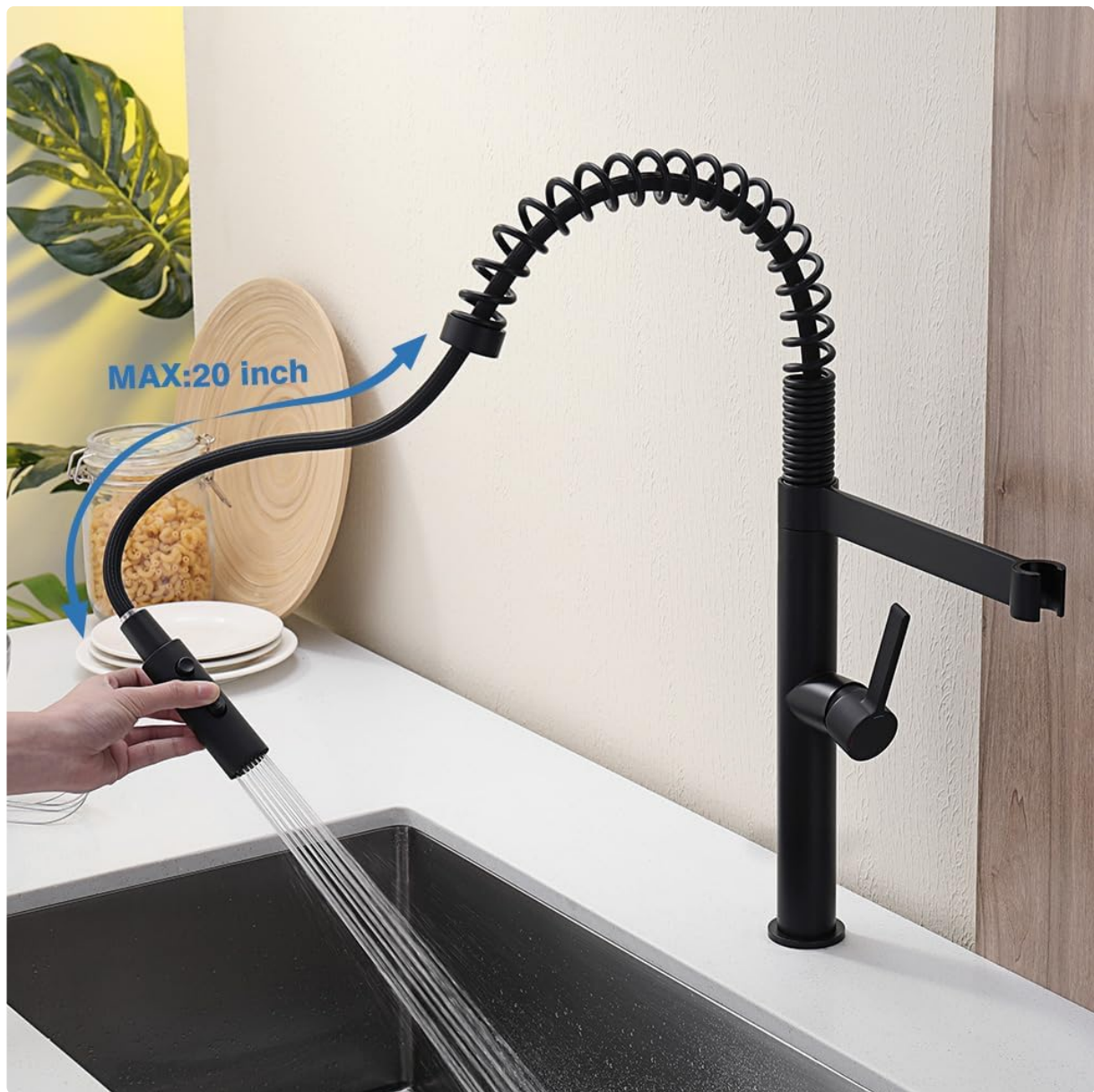
Image: The pull-down sprayer extended up to 20 inches, demonstrating its reach for cleaning.