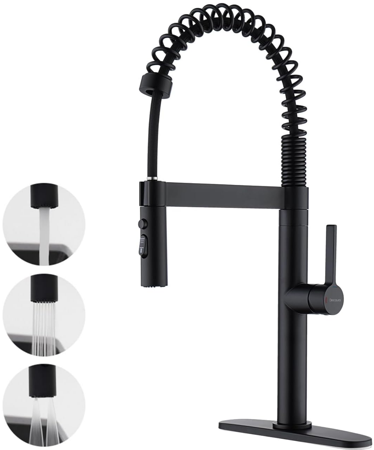
Image: Decaura Kitchen Faucet with Pull Down Sprayer in Matte Black.