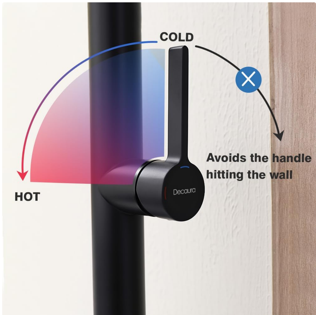
Image: Illustration of the single lever handle's 90-degree forward rotation for temperature control, designed to avoid hitting walls.