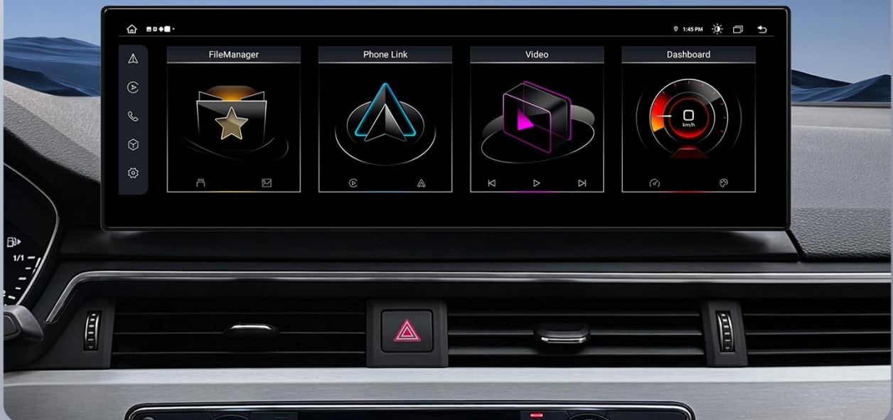
Image 1.1: The XTRONS 14.9 Inch Android 13 Car Stereo main unit, showcasing its large 2K IPS screen and user interface.