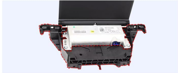
Image 2.1: Visual representation of the car stereo installed in an Audi dashboard, highlighting compatible models and years.

Please retain the original head unit mounting bracket, as it will be required as a part to complete the installation.