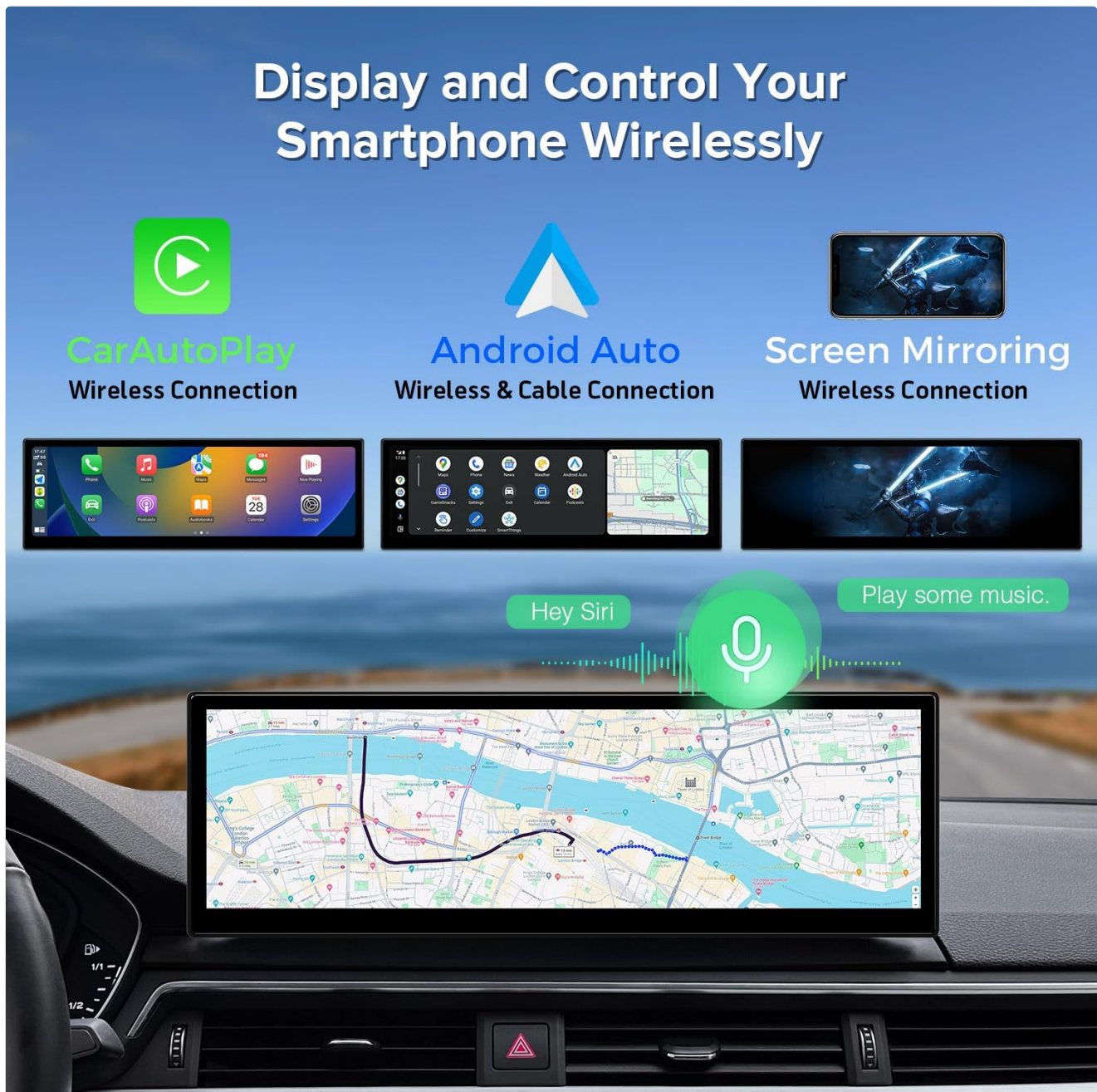
Image 9.1: Visual representation of Wireless CarPlay, Android Auto, and Screen Mirroring in action.