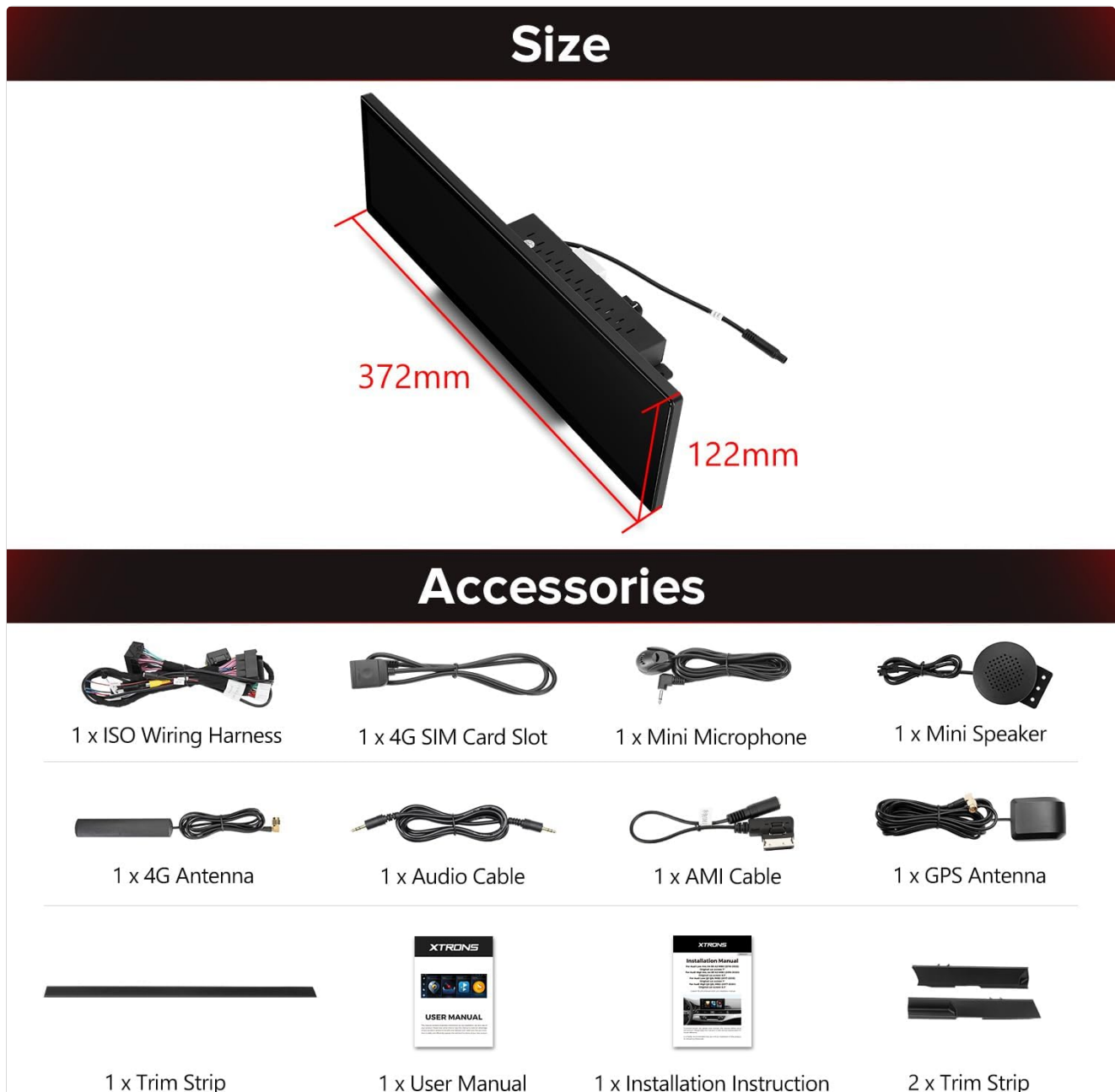
Image 12.1: Diagram illustrating the width and height measurements of the XTRONS 14.9-inch car stereo unit.