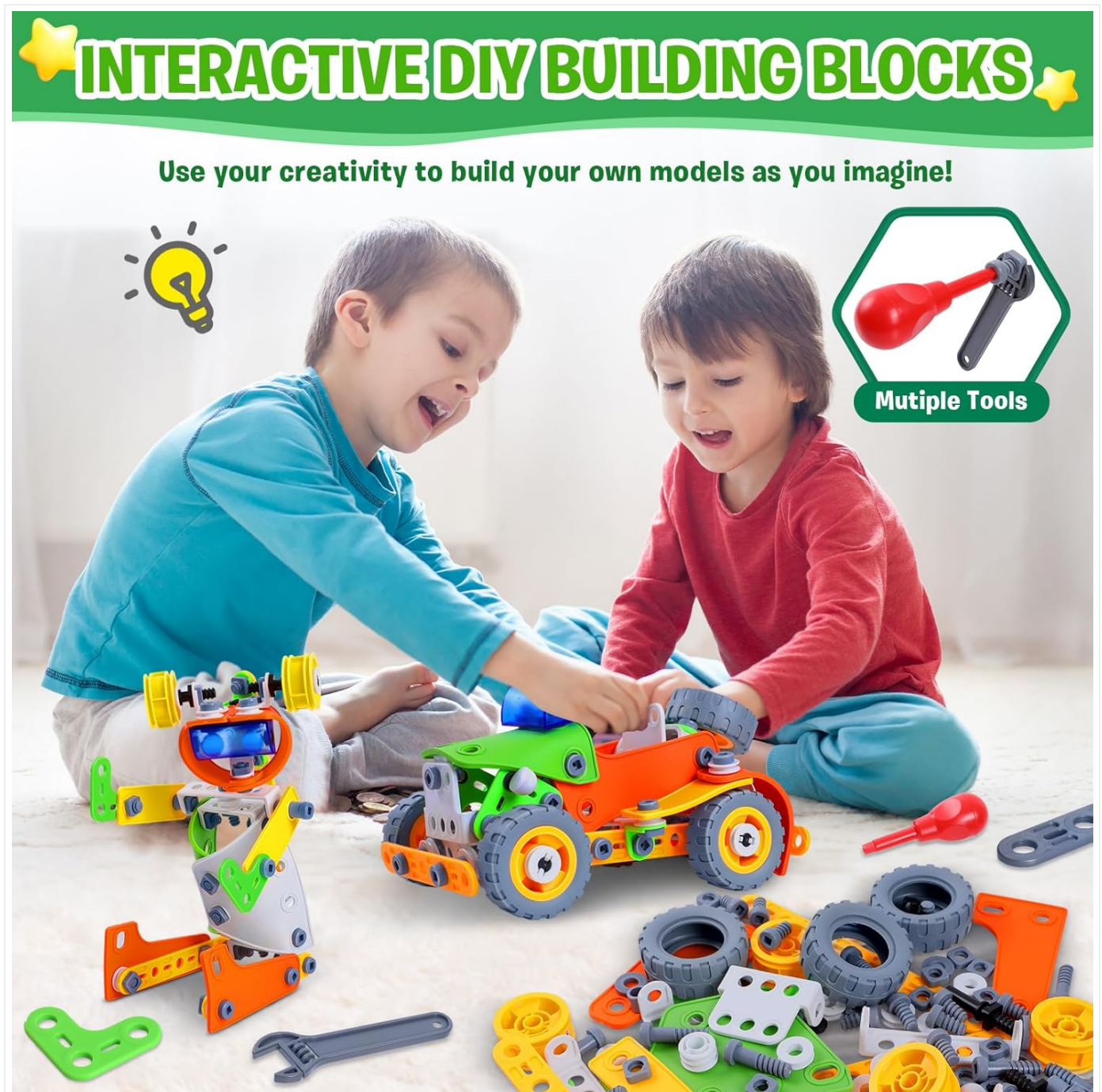
Image: Two children engaged in building with the W WISE BLOCK set, illustrating the variety of pieces and the multiple tools provided for interactive DIY construction.