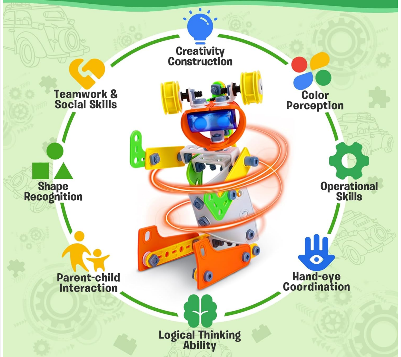
Image: A visual representation of the diverse skills enhanced by the W WISE BLOCK set, such as creativity, color perception, operational skills, hand-eye coordination, logical thinking, parent-child interaction, shape recognition, and teamwork.