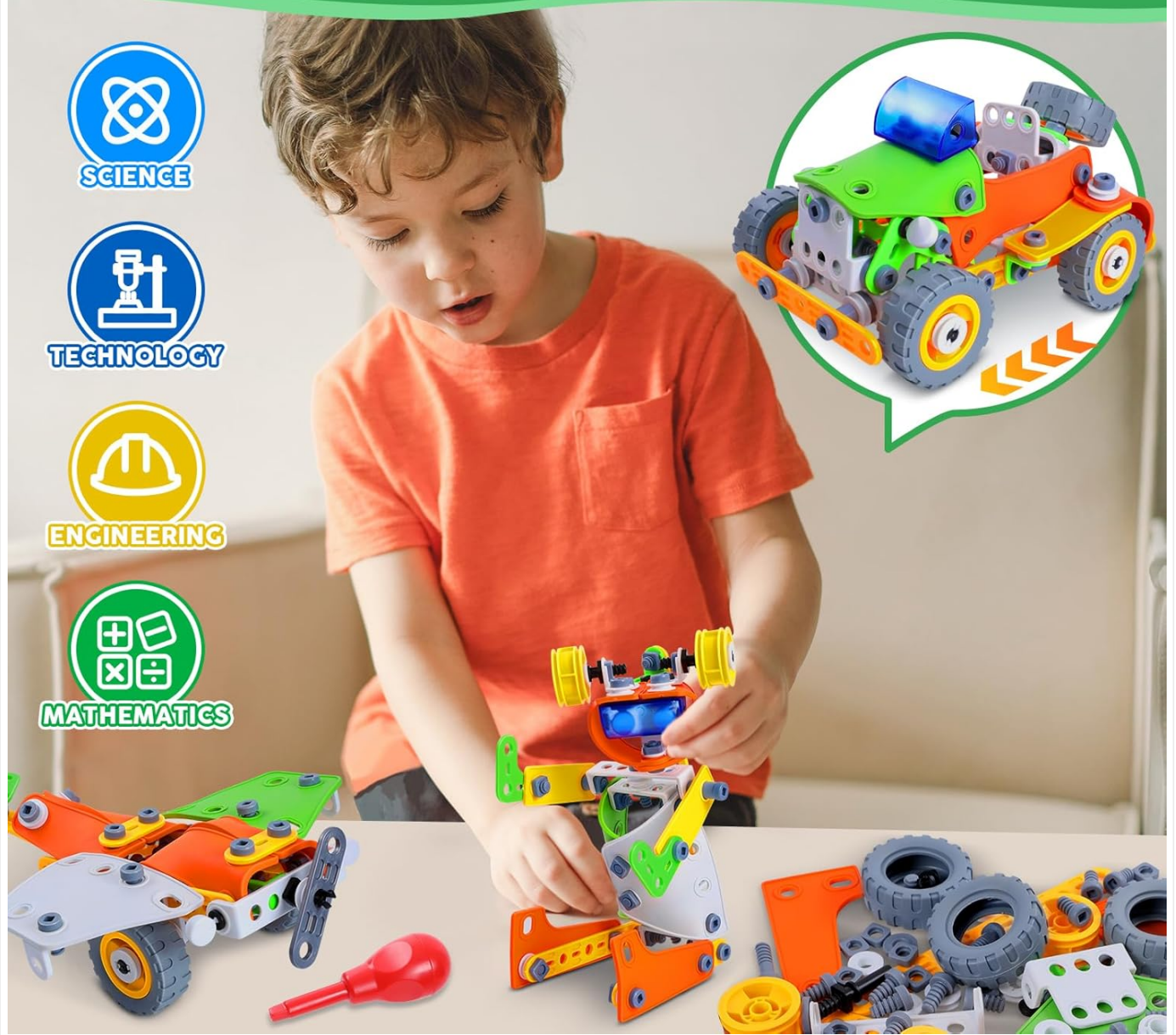
A child engaged in play with the W WISE BLOCK set, highlighting the STEM (Science, Technology, Engineering, Mathematics) learning aspect of the toy.