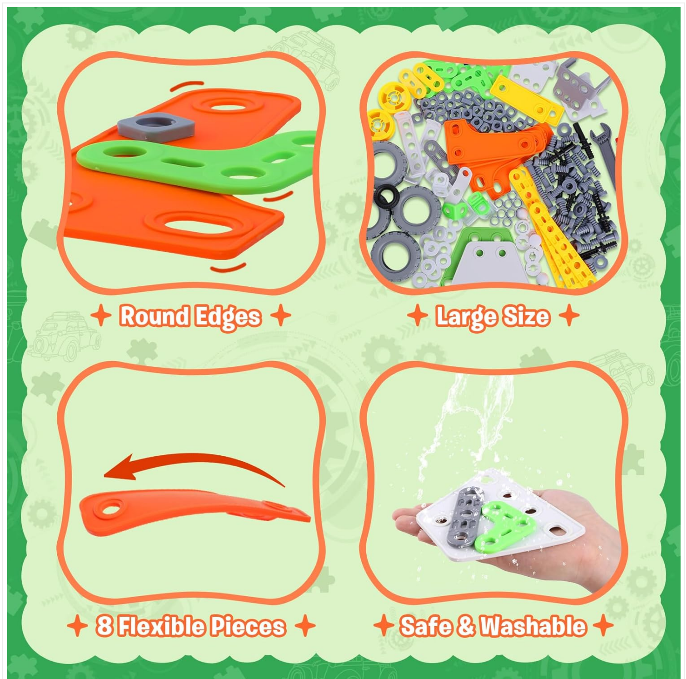
Image: A detailed view of the W WISE BLOCK components, emphasizing their safety features such as round edges, large size, the inclusion of flexible pieces, and the ease of washing, ensuring a safe and hygienic play experience.