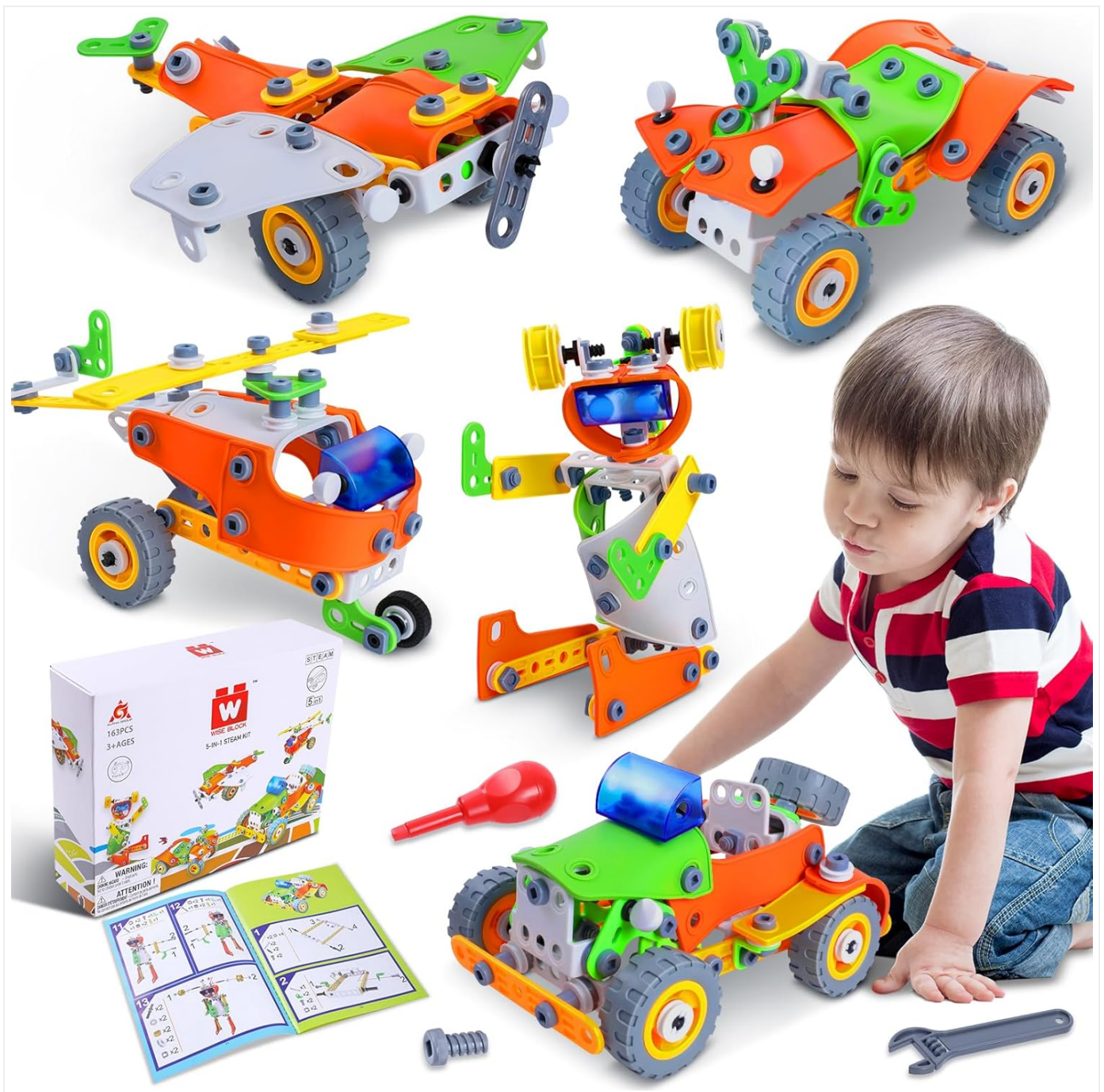
Image: The W WISE BLOCK 164 PCS STEM Toys set, showcasing various assembled models like a plane, ATV, helicopter, robot, and jeep, with a child engaged in play. The image highlights the versatility and engaging nature of the building blocks.