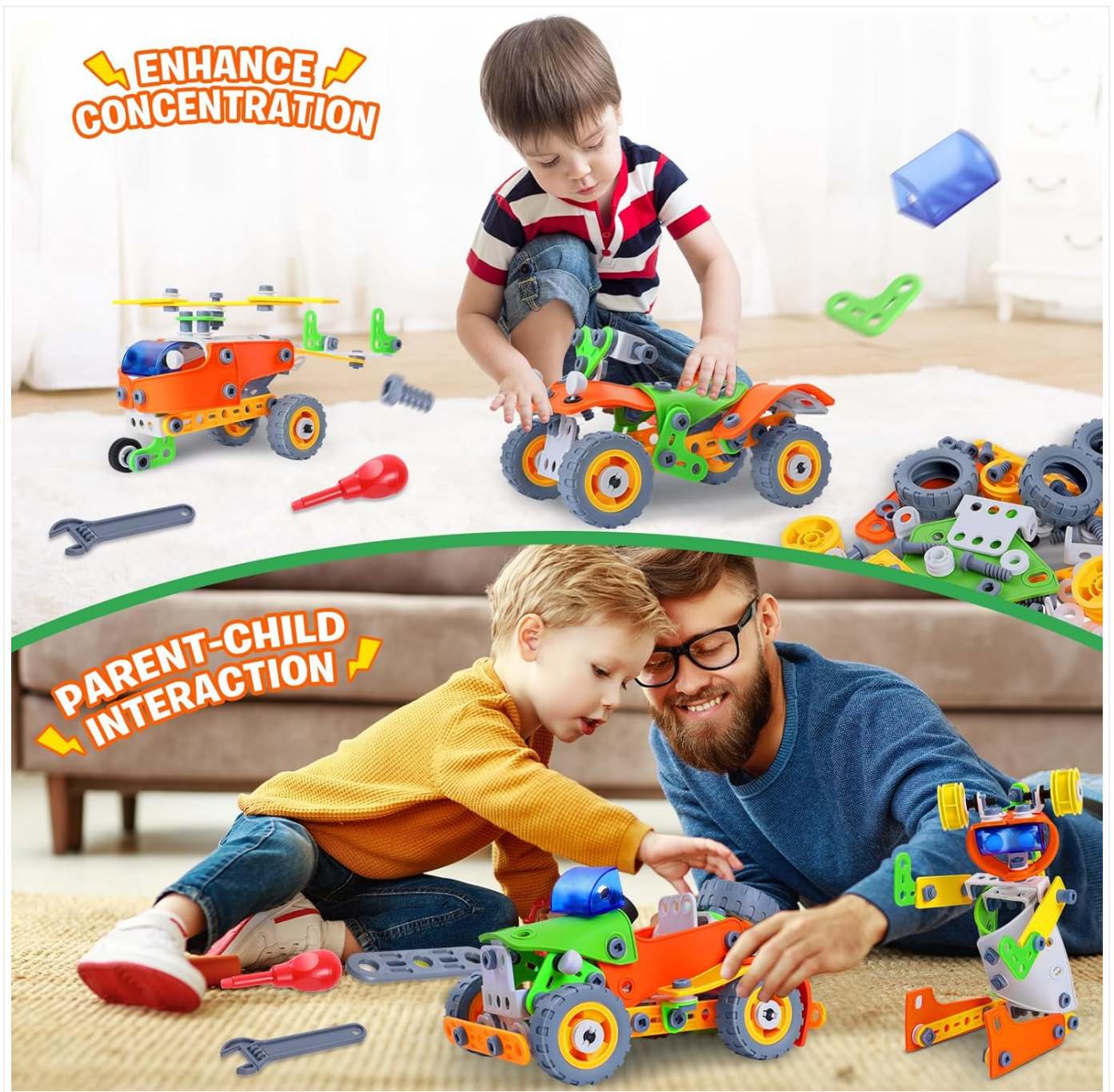
Image: Two separate scenes depicting children and adults interacting with the W WISE BLOCK set, illustrating how the toy enhances concentration and promotes valuable parent-child interaction.