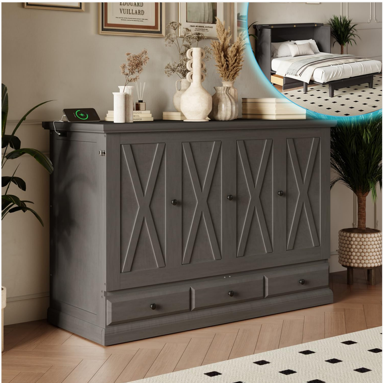
Figure 3.1: The Linique Full Size Murphy Bed in its compact cabinet configuration. This view highlights the grey finish, decorative X-shape panels, and the three storage drawers at the bottom. A charging station is visible on the top surface.