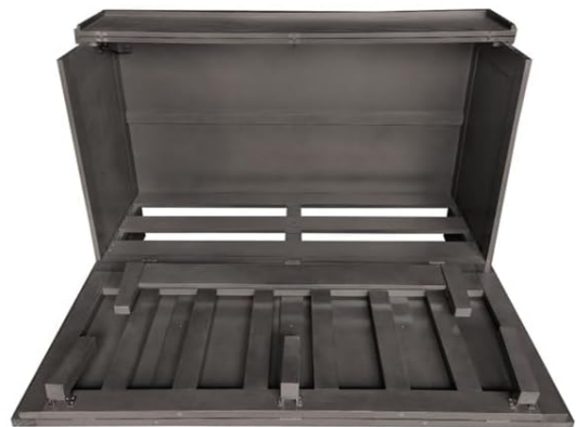
Figure 8.1: Detailed dimensions of the Linique Murphy Bed, showing measurements for both the cabinet and the extended bed.