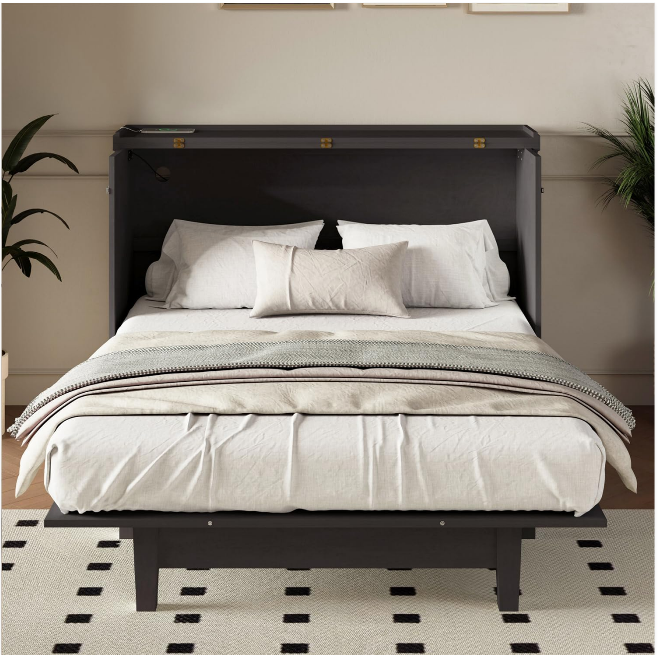
Figure 3.3: A direct front view of the Linique Murphy Bed in its extended, sleeping configuration. This image emphasizes the bed's sturdy frame and the headboard formed by the cabinet's upper section.