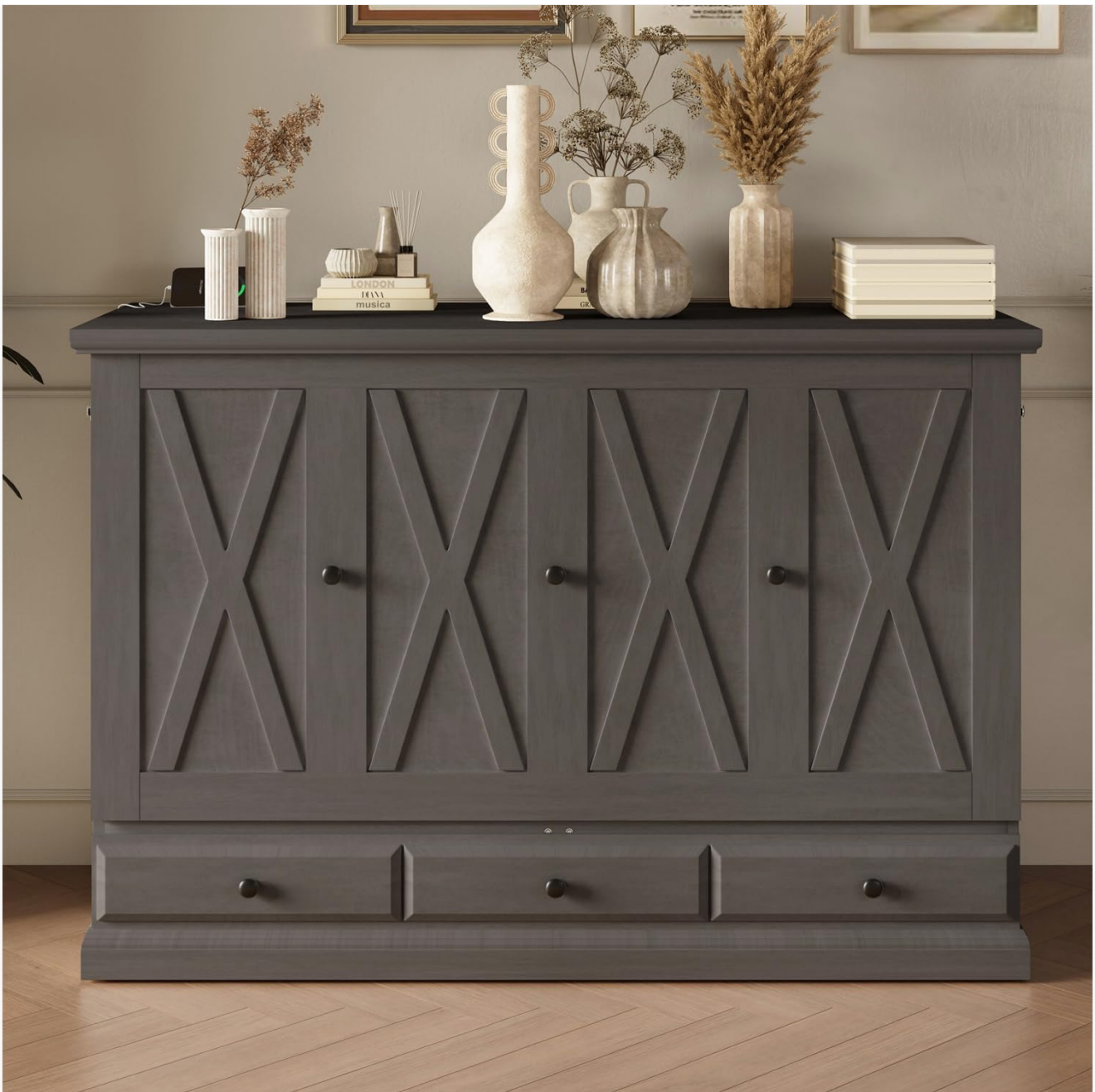
Figure 3.4: A side view of the Linique Murphy Bed in its cabinet form, highlighting the integrated charging station located on the top left side. This station provides convenient access to power outlets and USB ports.