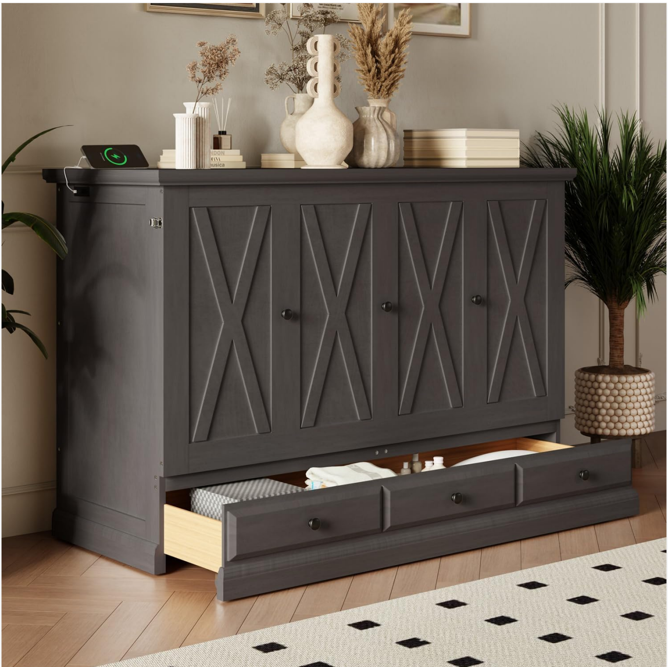
Figure 3.5: A close-up view of the Linique Murphy Bed cabinet with one of its three storage drawers pulled open. The image demonstrates the ample storage capacity, suitable for linens, books, or other personal items.