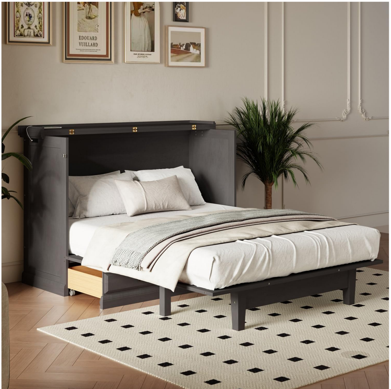
Figure 3.2: The Linique Murphy Bed fully extended, showcasing its function as a comfortable full-size bed. The mattress is in place, and one of the large storage drawers is partially pulled out, demonstrating its accessibility even when the bed is deployed.