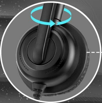
270° Rotatable Mic