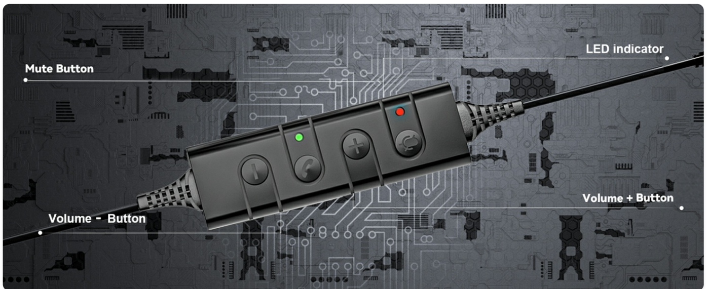
Detailed view of the in-line control unit, illustrating the mute button, volume controls, and LED indicator.