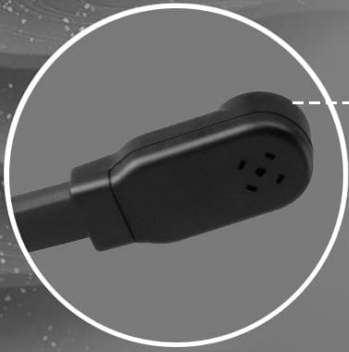
Noise cancelling microphone

Extremely light, only 4 ounce, barely feel the presence even wear all day.