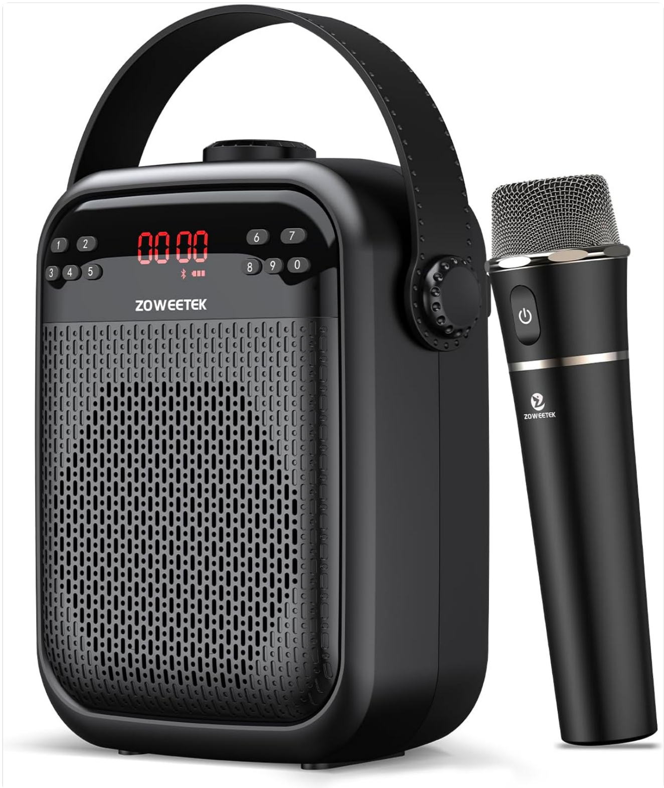
Figure 1.1: ZOWEETEK Voice Amplifier H6-H and Wireless Microphone