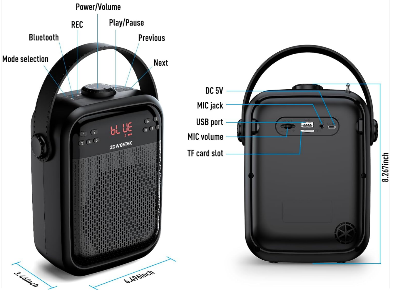
Figure 8.1: Product Dimensions and Ports