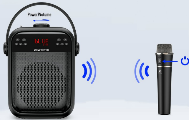
Figure 5.1: Automatic Microphone Pairing

Simply turn on the microphone and speaker to use without the need for manual pairing.