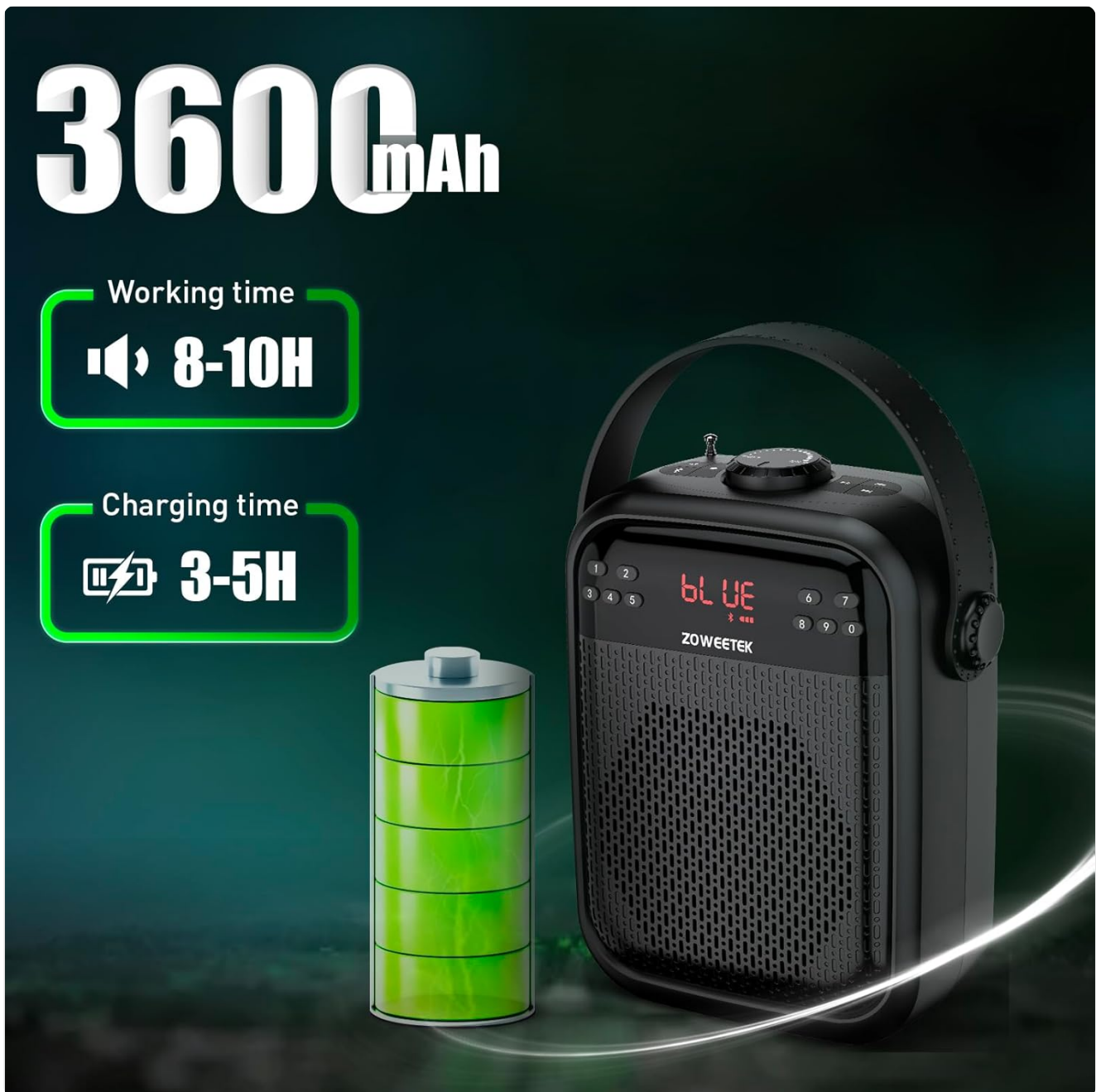
Figure 4.1: Battery Life and Charging Time