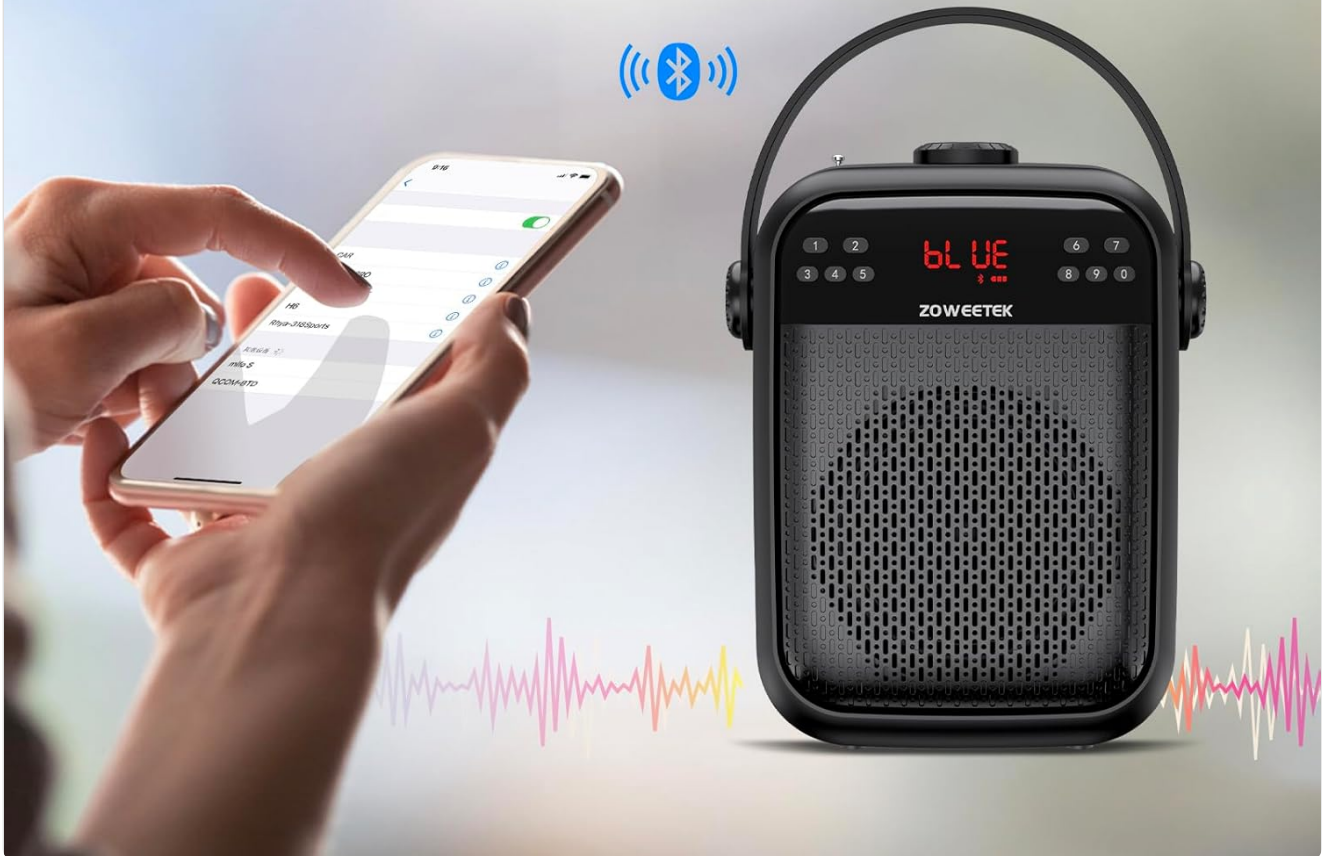
Figure 5.2: Bluetooth Connection

Not only as a voice amplifier but a music player