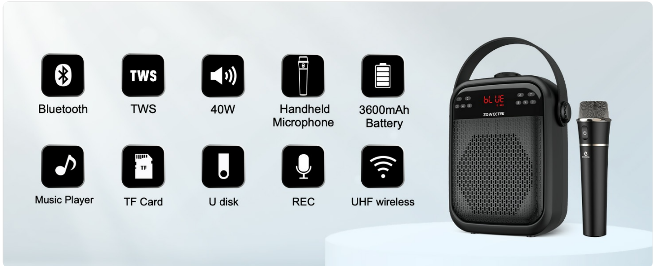
Figure 3.1: Key Features Overview