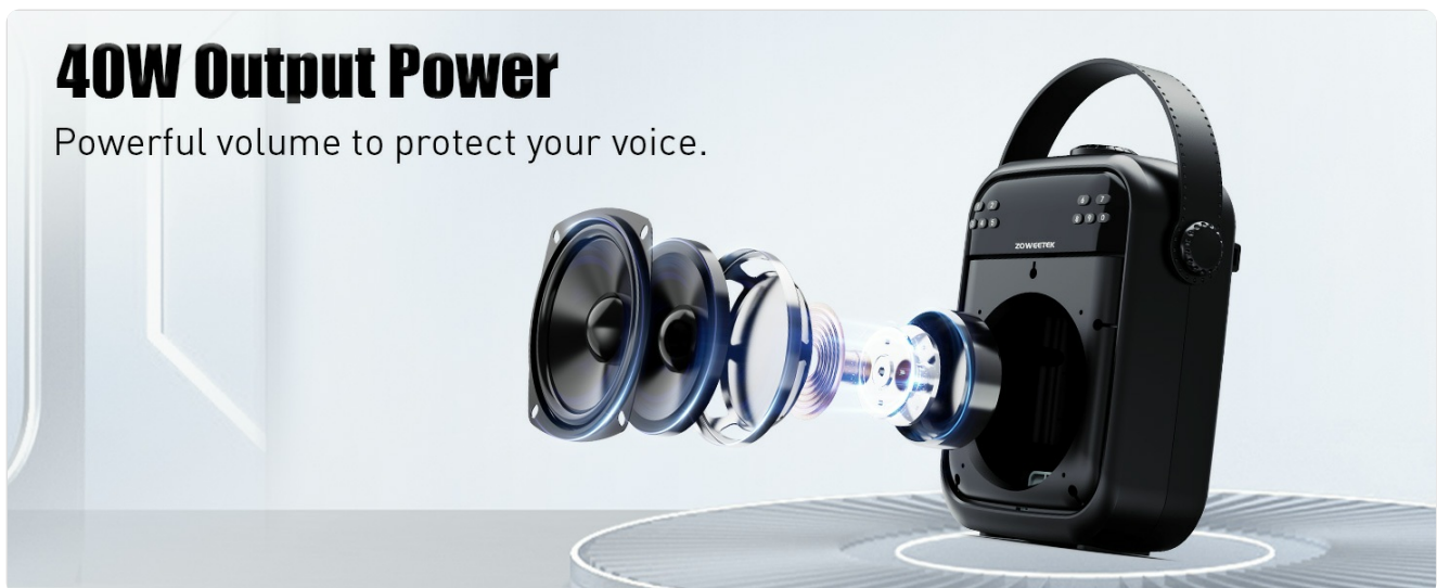
Figure 3.2: 40W Output Power Illustration