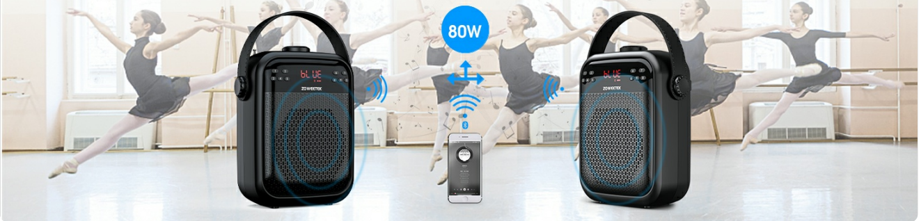
Figure 5.3: True Wireless Stereo Setup

Combining two same speakers into one speaker system in bluetooth mode. Can provide total 80 watts big sound.