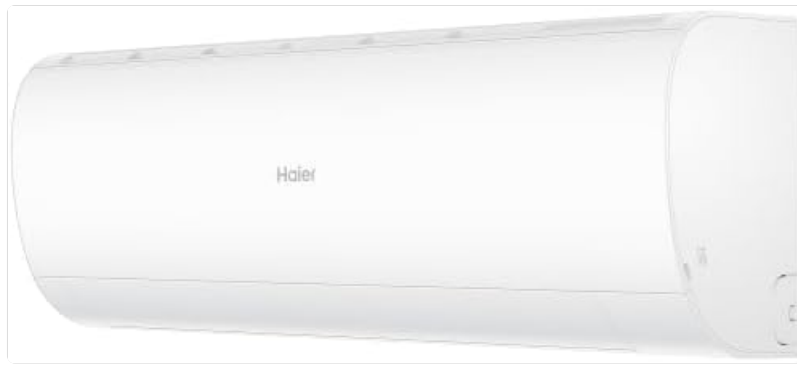
Image: Side view of the Haier indoor air conditioner unit. This perspective highlights the slim profile of the unit.

Ensure the installation area for both indoor and outdoor units is well-ventilated and free from obstructions. The outdoor unit should be placed on a stable, level surface, away from direct sunlight or excessive moisture. The indoor unit should be mounted securely on a wall, ensuring proper drainage for condensate water.