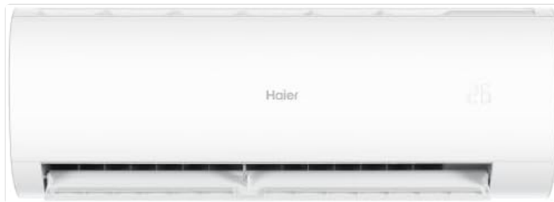
Image: Front view of the Haier indoor air conditioner unit with its louvers open, displaying the temperature '26'. This indicates the unit is operational and set to a specific temperature.

Your Haier air conditioner offers various modes and features to optimize your comfort. All functions are typically controlled via the wireless remote control.