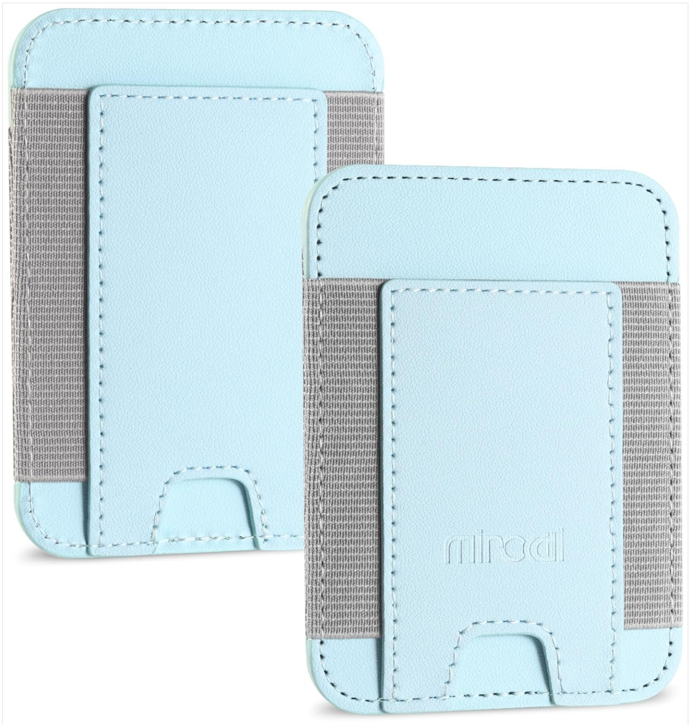
Image: The Miroddi Credit Card Holder in Sky Blue, showcasing its compact design.

The Miroddi Credit Card Holder (Model CB055) features a minimalist design with double-sided elastic pockets, capable of holding up to 14 cards and some cash. Its dimensions are approximately 3.85 x 2.87 x 0.23 inches, making it suitable for front pockets or small bags.