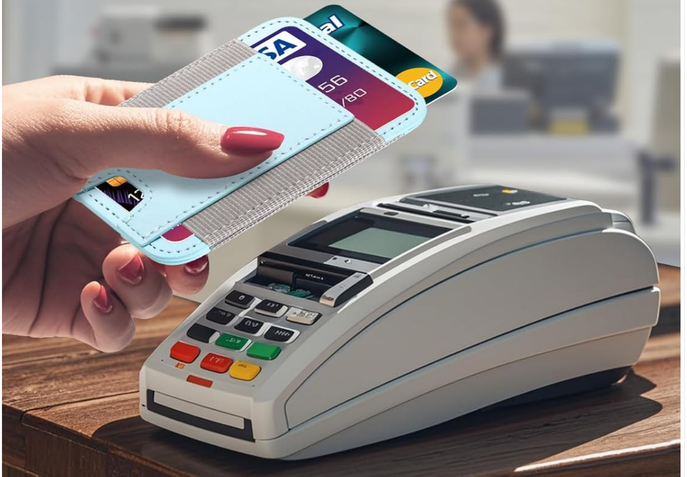
Image: Visual representation of the RFID blocking feature protecting cards from scanners.