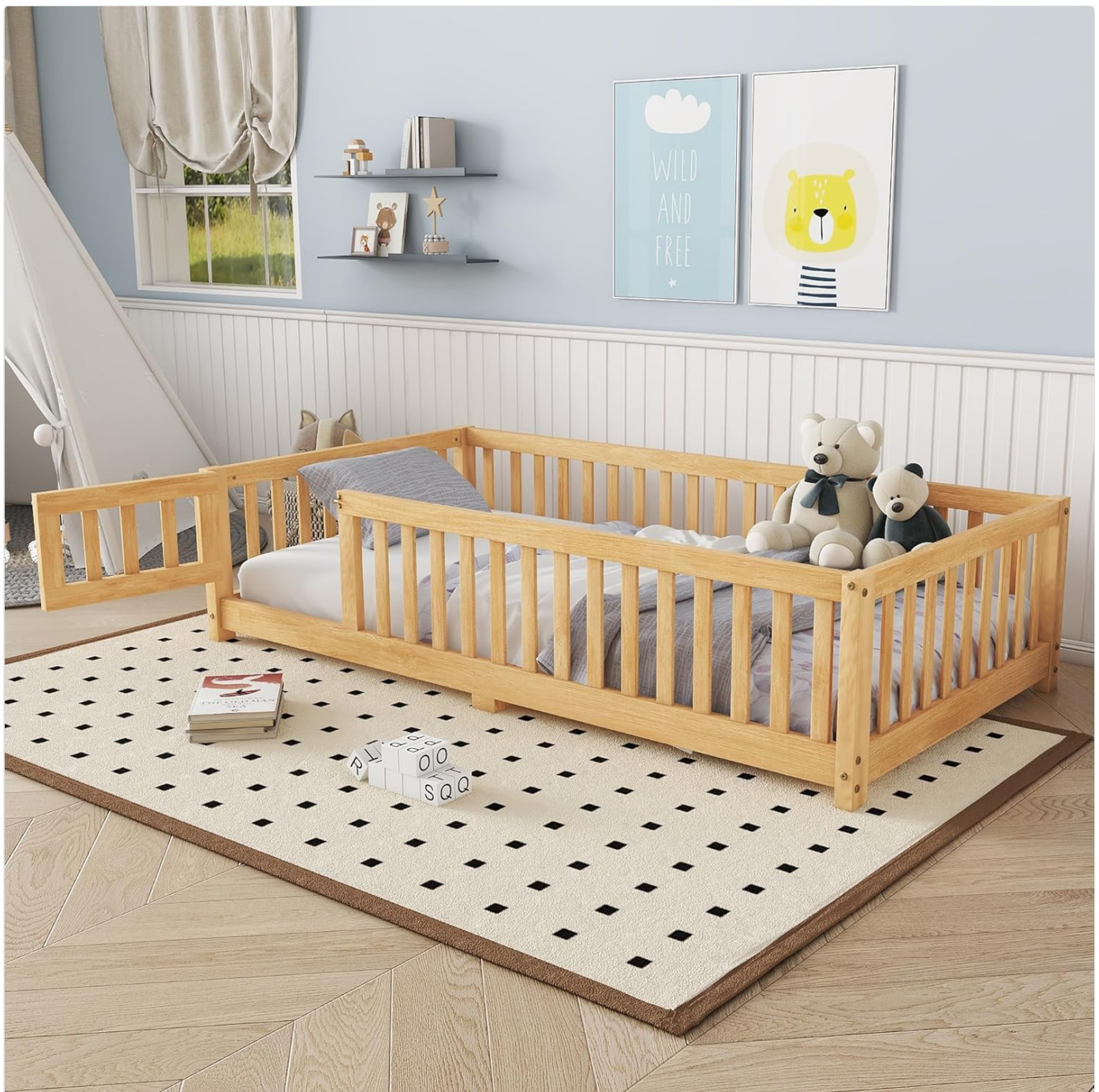
Figure 1.1: Fully assembled Bellemave Twin Floor Bed in a child's bedroom setting.