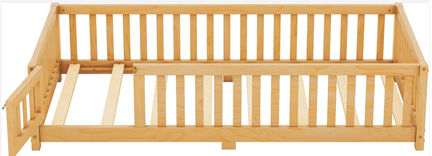
Figure 4.2: View of the bed frame showing the installed slats and center support.