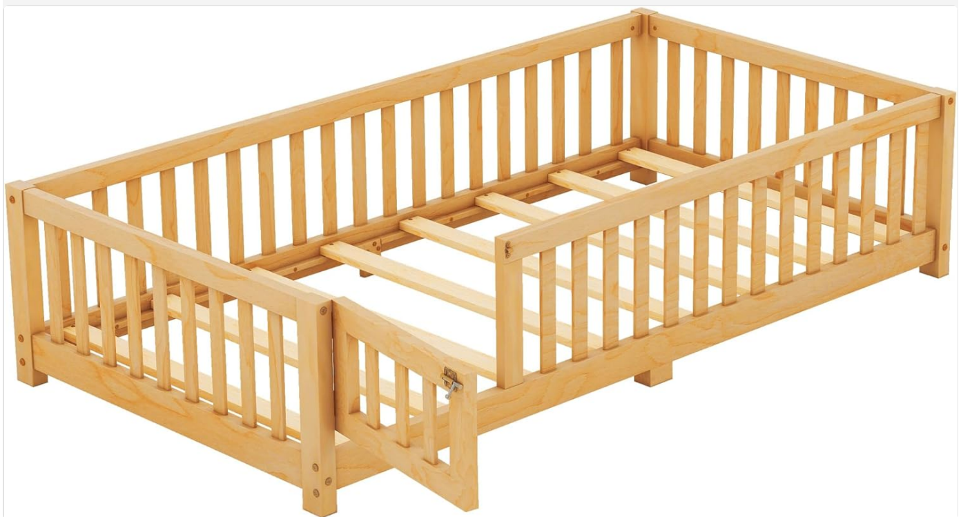
Figure 3.1: Overview of the bed frame components, showing the open door section.