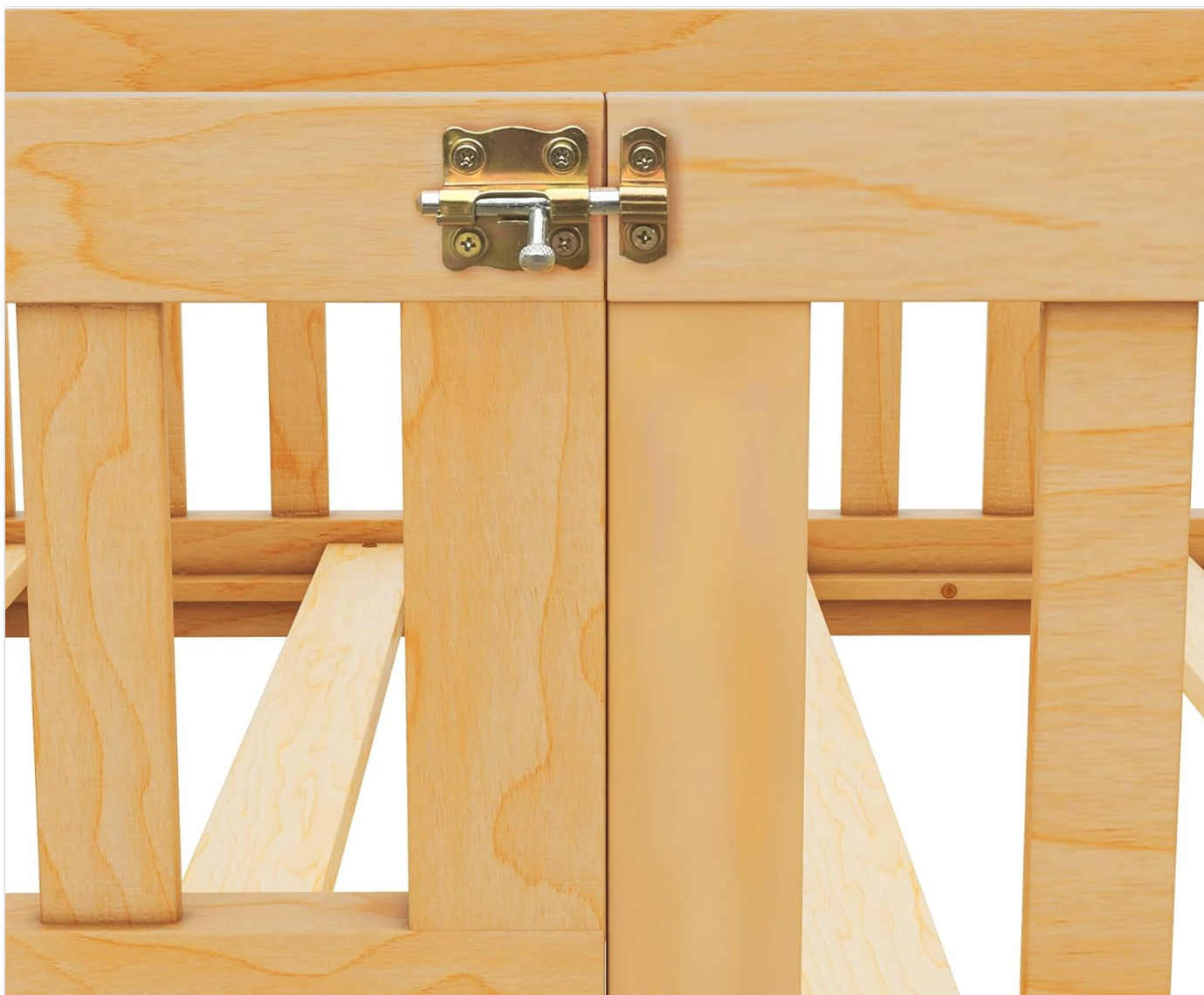
Figure 4.4: Detail of the door latch mechanism, showing how to secure the door.