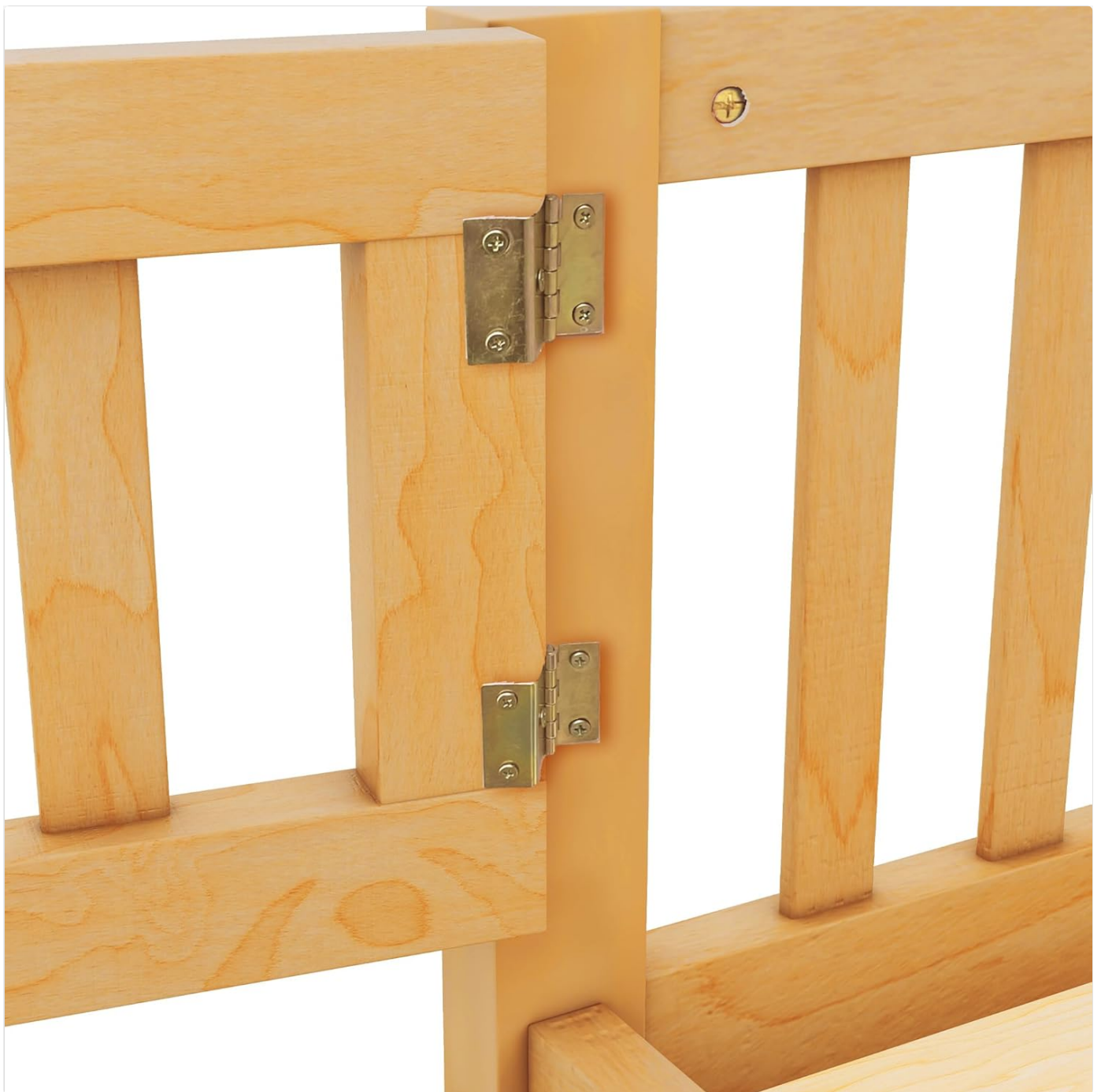
Figure 4.3: Detail of the door hinges, illustrating how the door is attached.