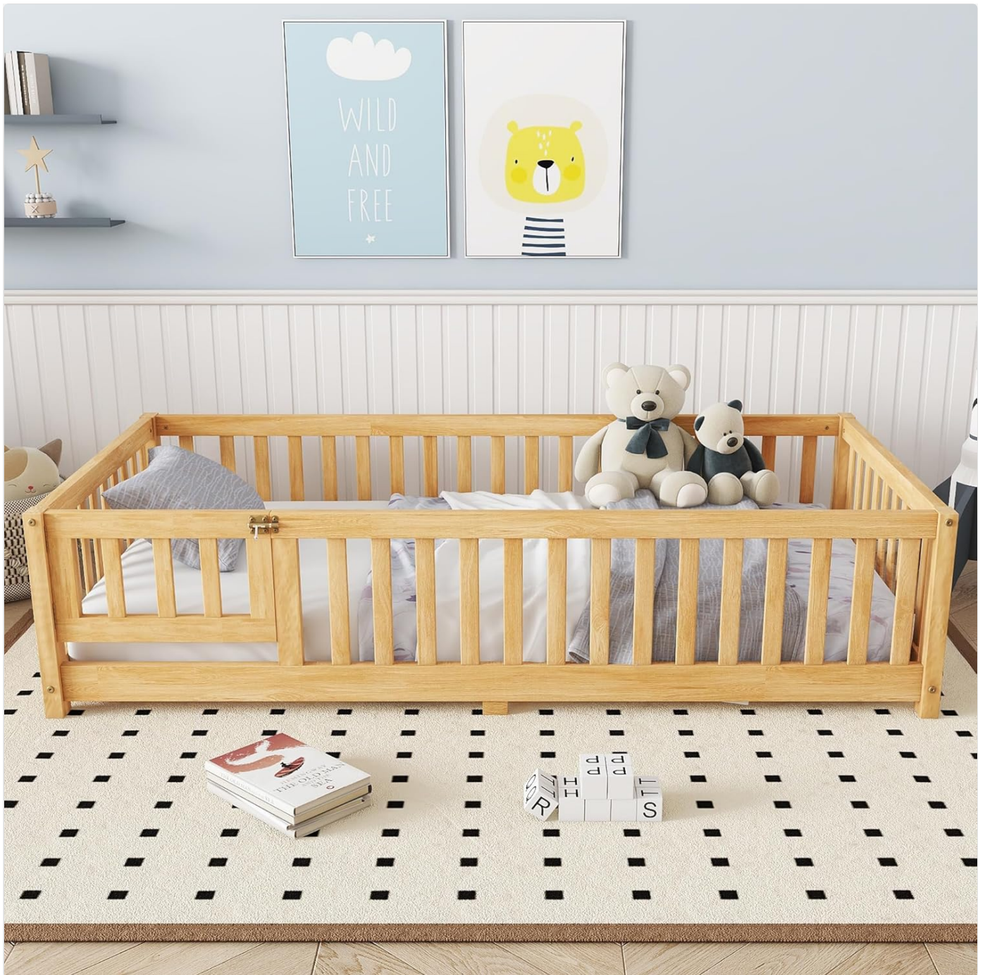
Figure 5.1: The bed with the door securely closed, providing a safe sleeping environment.