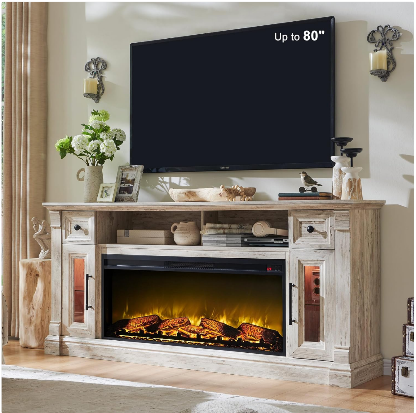
Image 1.1: The OKD Fireplace TV Stand in an antique brush white finish, supporting a large television.

This unit combines modern country aesthetics with vintage allure, featuring a beautifully weathered oak grain and distressed finish. The electric fireplace provides 5200 BTU heating, capable of warming up to 400 sq. ft., and includes 7 flame colors and 7 LED lighting options for customizable ambiance.