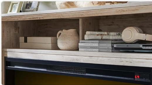
Open Shelf for Soundbar