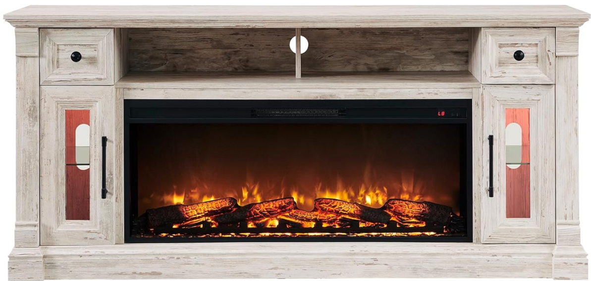
Image 1.2: Visual representation of the TV stand's compatibility with televisions up to 80 inches.