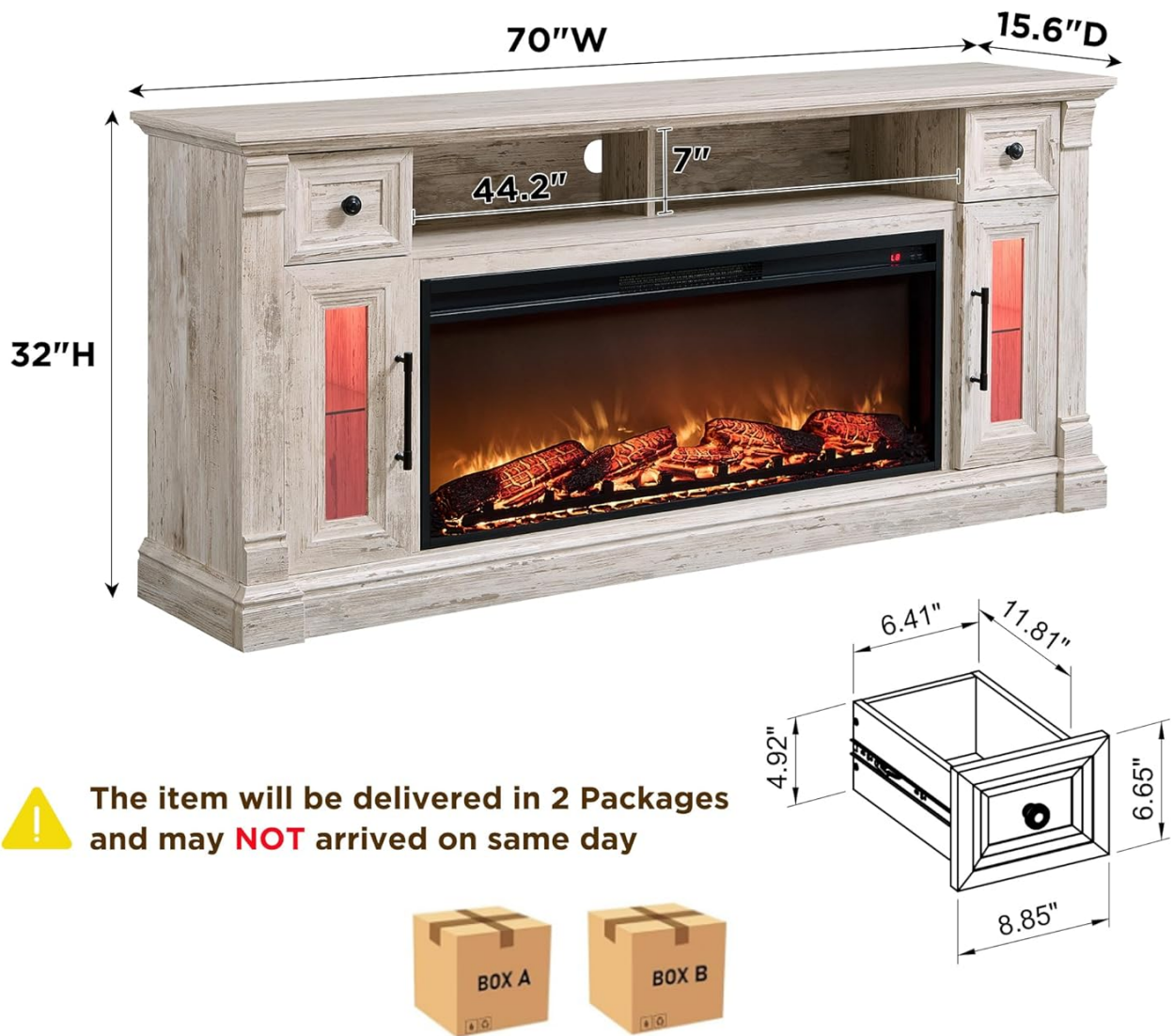
Image 3.1: Product dimensions and illustration of the two-package delivery.