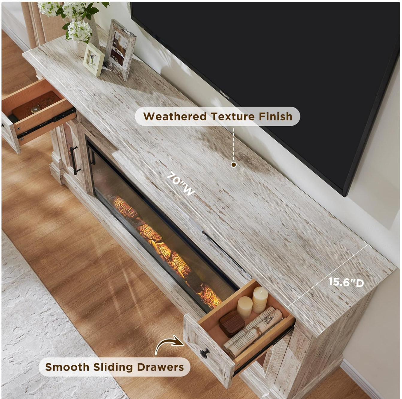
Image 4.1: Detailed view of the TV stand's top surface and smooth sliding drawers, highlighting dimensions.