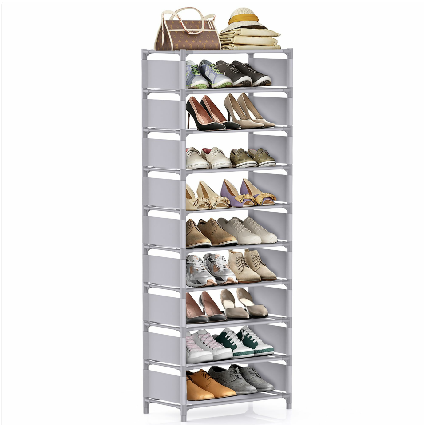
Image: The sunvito 10-Tier Vertical Shoe Rack, showcasing its tall, narrow design and capacity for multiple pairs of shoes in a home entryway setting.