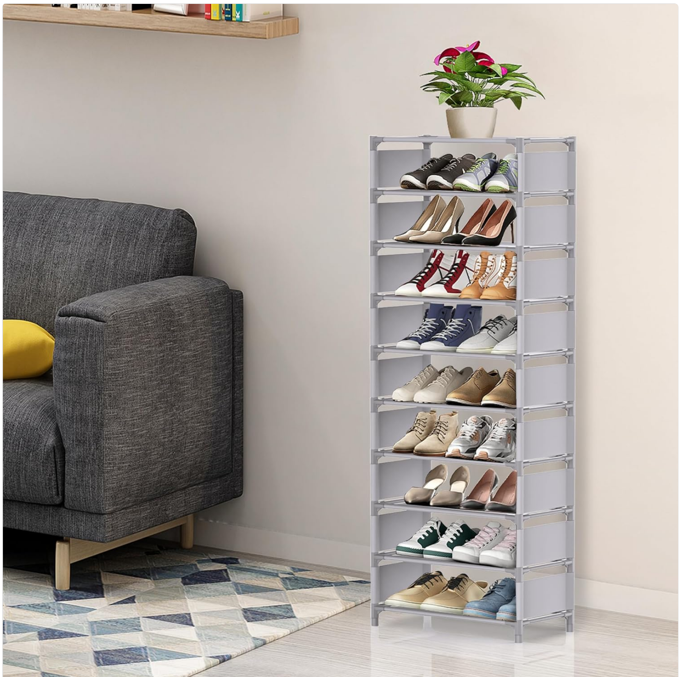
Image: The sunvito shoe rack demonstrating its adjustable design, allowing users to remove a shelf to create space for taller items like boots.