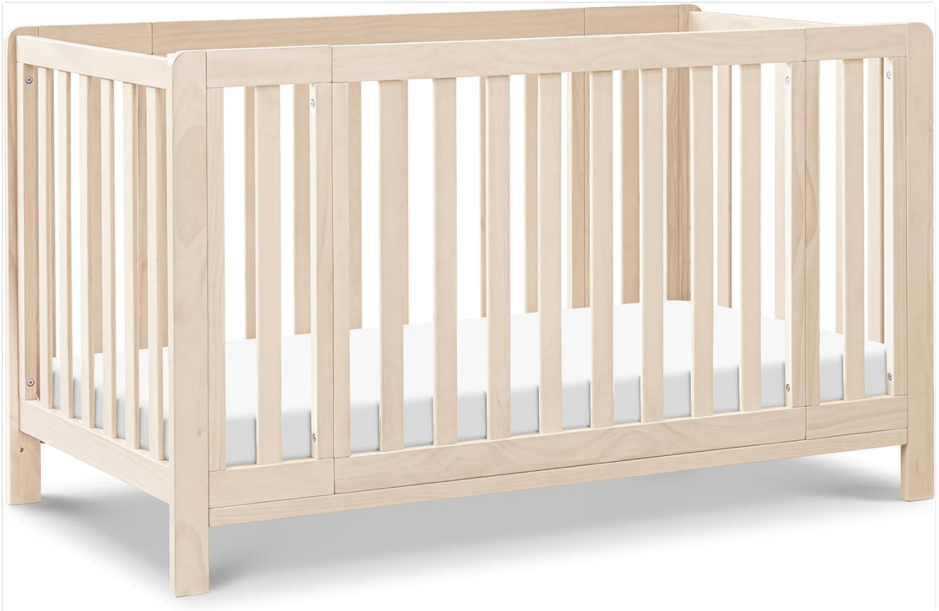
Image: The DaVinci Colby Grow 6-in-1 Convertible Crib in its full-size crib configuration, showcasing the Washed Natural finish.