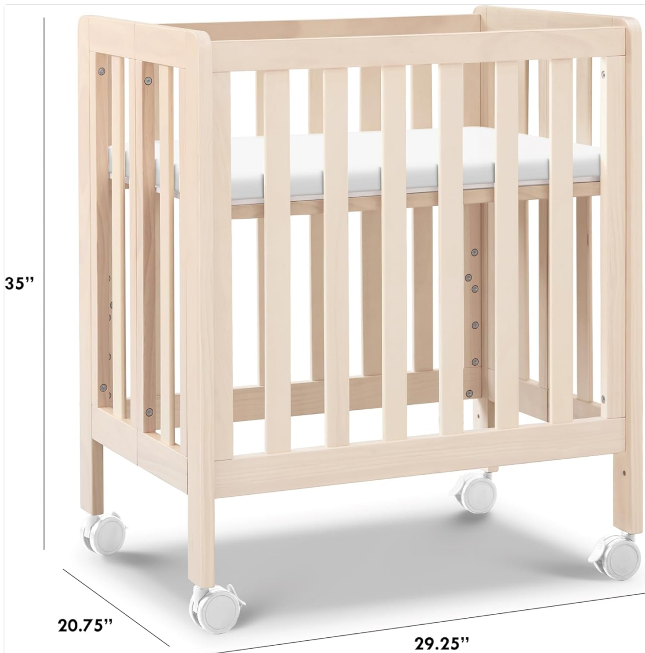
Image: The portable bassinet configuration of the crib, highlighting its compact size and the removable locking wheels.