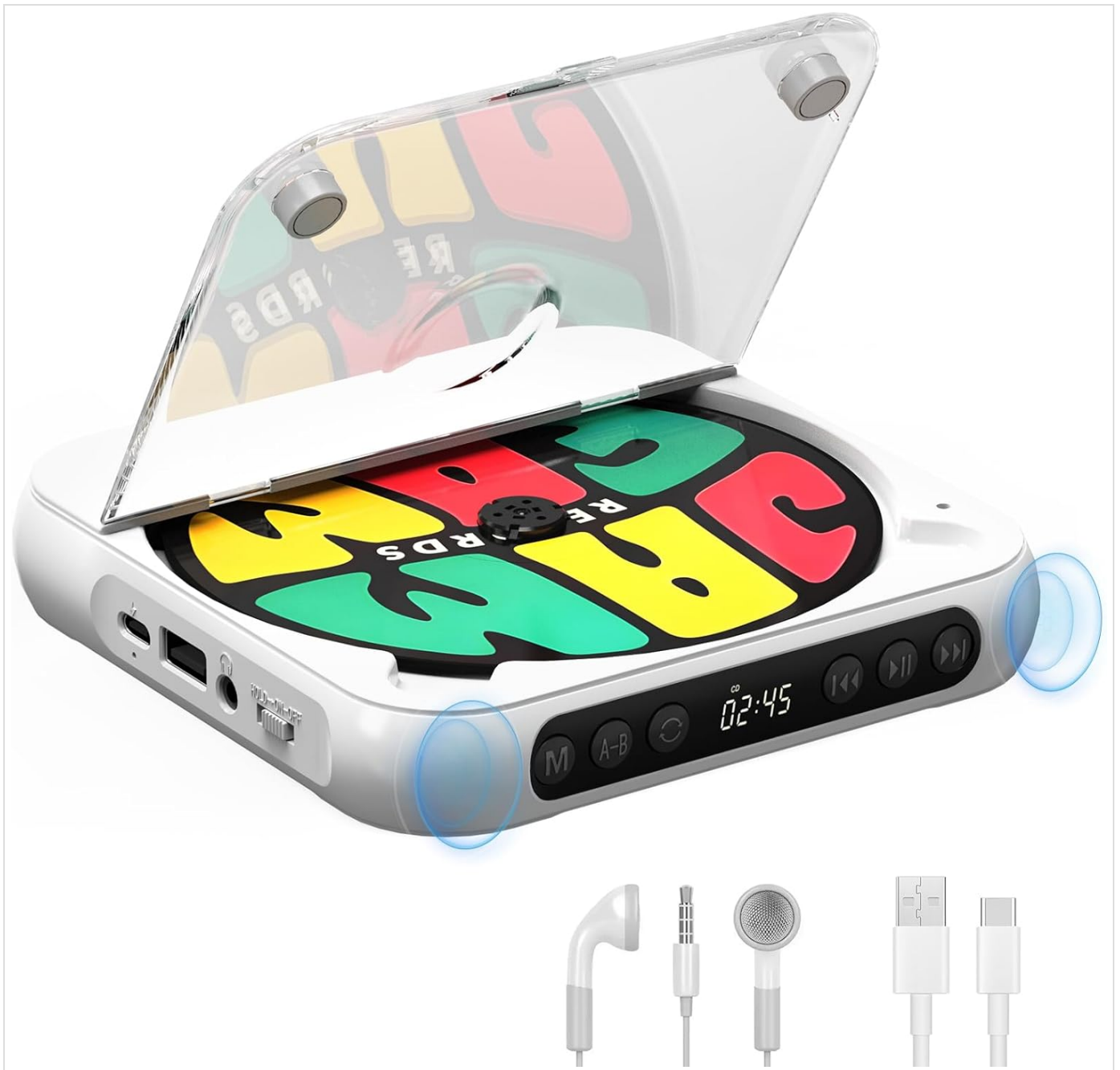
Image: The SKYANS Portable CD Player, white in color, with its transparent lid open, revealing a colorful CD. Various accessories such as wired headphones, a 3.5mm AUX cable, and a USB-C charging cable are displayed in front of the player.