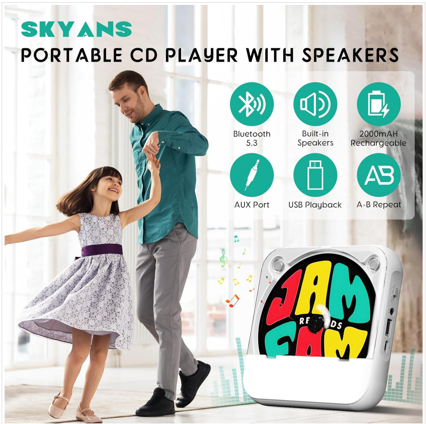
Image: A graphic illustrating the key features of the SKYANS Portable CD Player, including Bluetooth 5.3, built-in speakers, 2000mAh rechargeable battery, AUX port, USB playback, and A-B repeat function.