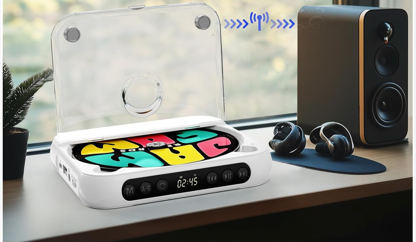
Image: The SKYANS Portable CD Player shown wirelessly connected to Bluetooth headphones and a Bluetooth speaker, illustrating its Bluetooth 5.3 transmitter capability.