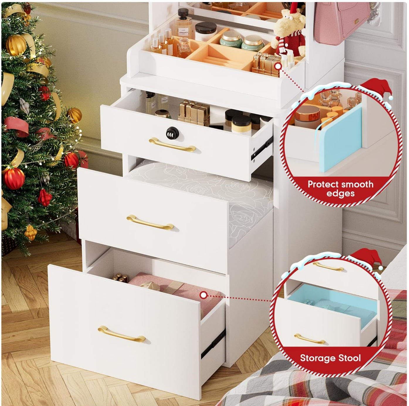
Image: Detailed view of the storage drawers and the integrated, pull-out cushioned stool, demonstrating the space-saving design and accessibility.