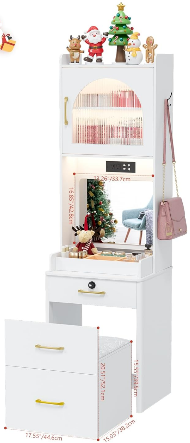
Image: Product dimensions diagram, illustrating the overall height, width, and depth of the vanity desk and its components, useful for assembly planning and space allocation.