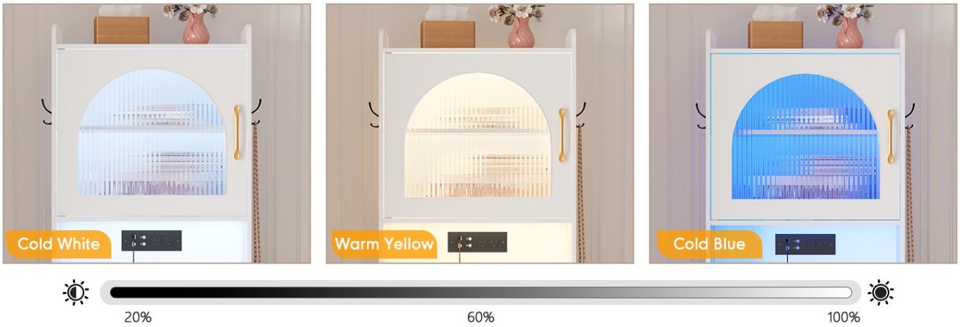
Image: Illustration of the vanity desk's LED lighting system, demonstrating the three available color temperatures (Cold White, Warm Yellow, Cool Blue) and the brightness adjustment feature.