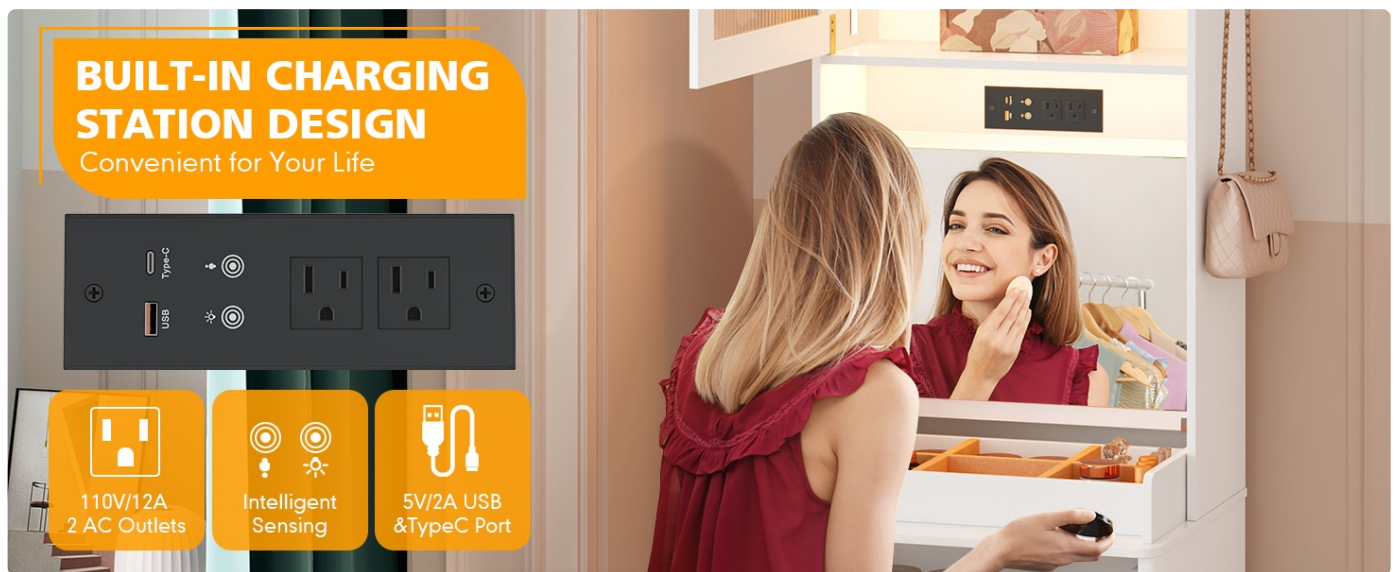
Image: Detailed view of the built-in charging station, highlighting its 110V/12A AC outlets and 5V/2A USB & Type-C ports for convenient device charging.