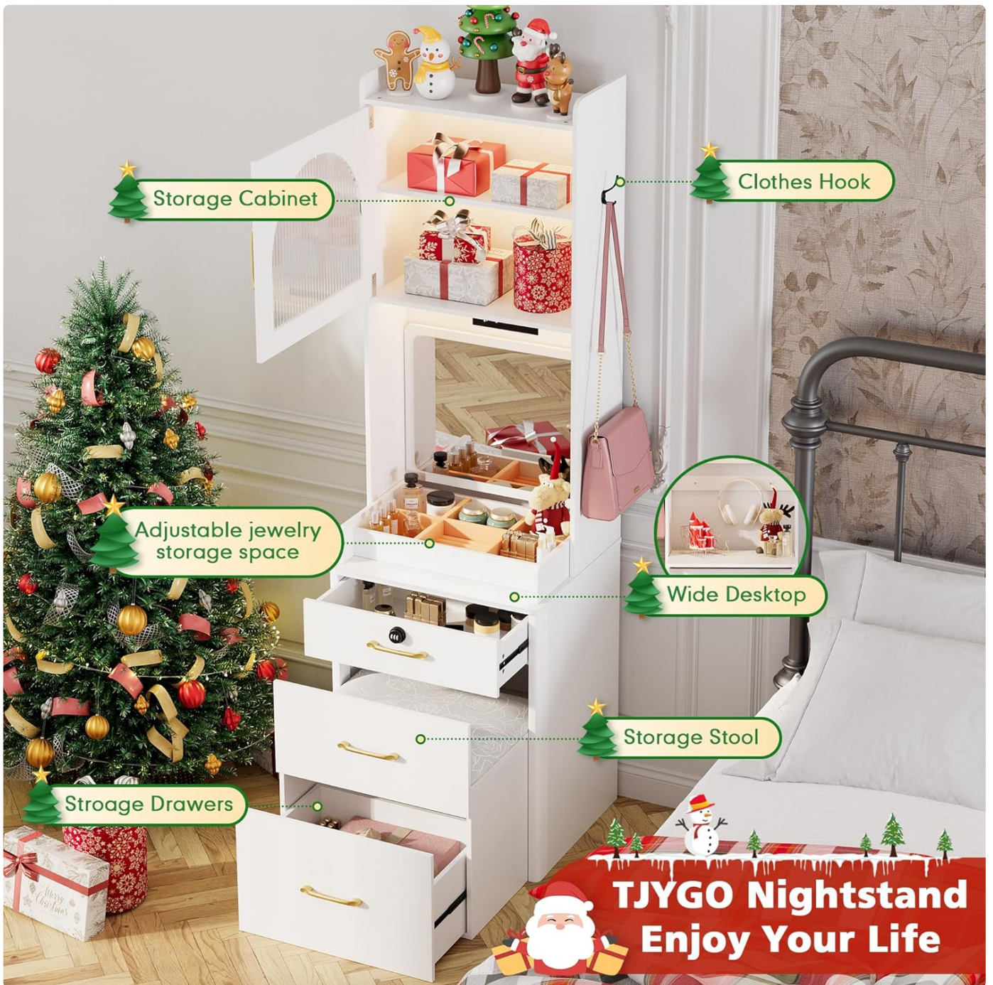
Image: Overview of the vanity desk highlighting its storage cabinet, adjustable jewelry space, wide desktop, storage stool, and drawers.