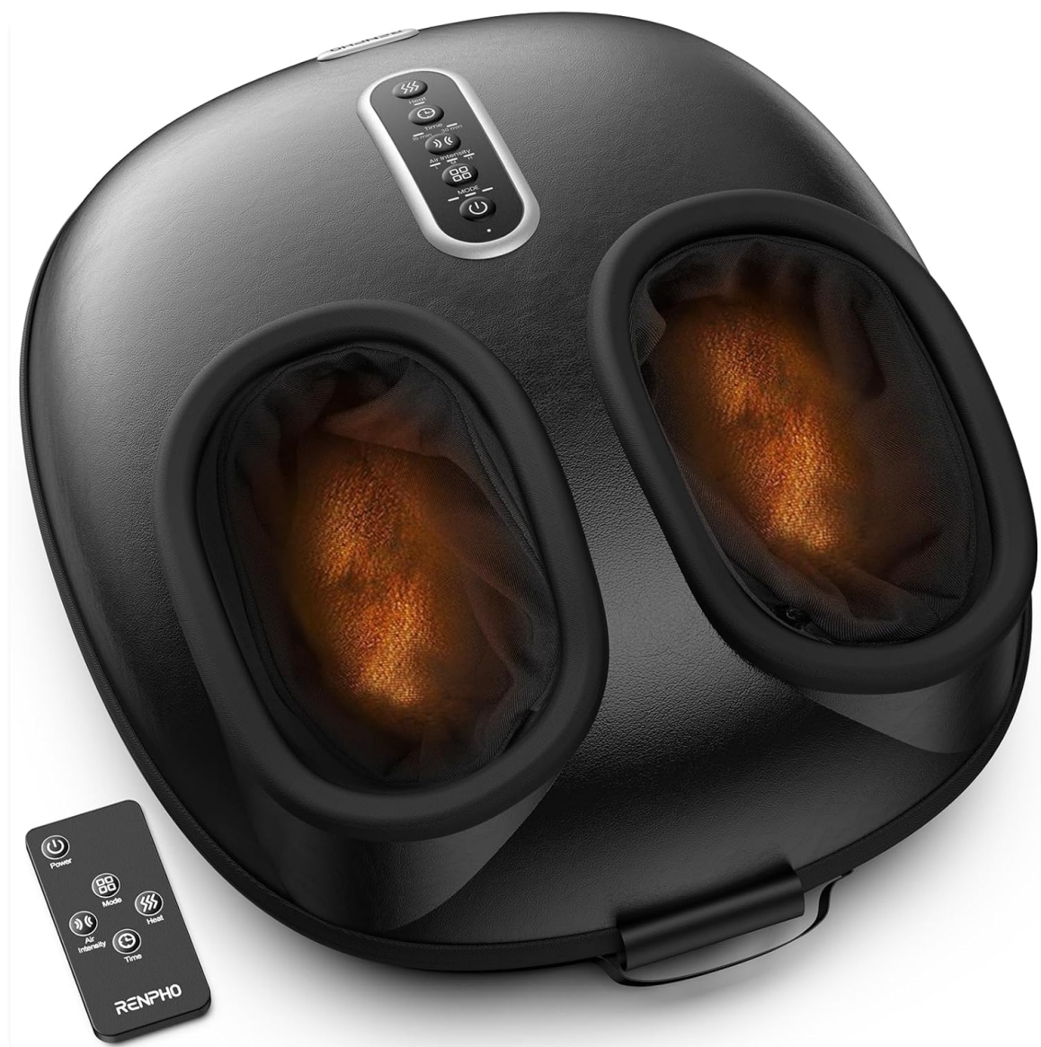
Figure 1: The RENPHO Foot Massager with Heat, showing the main unit and its remote control.