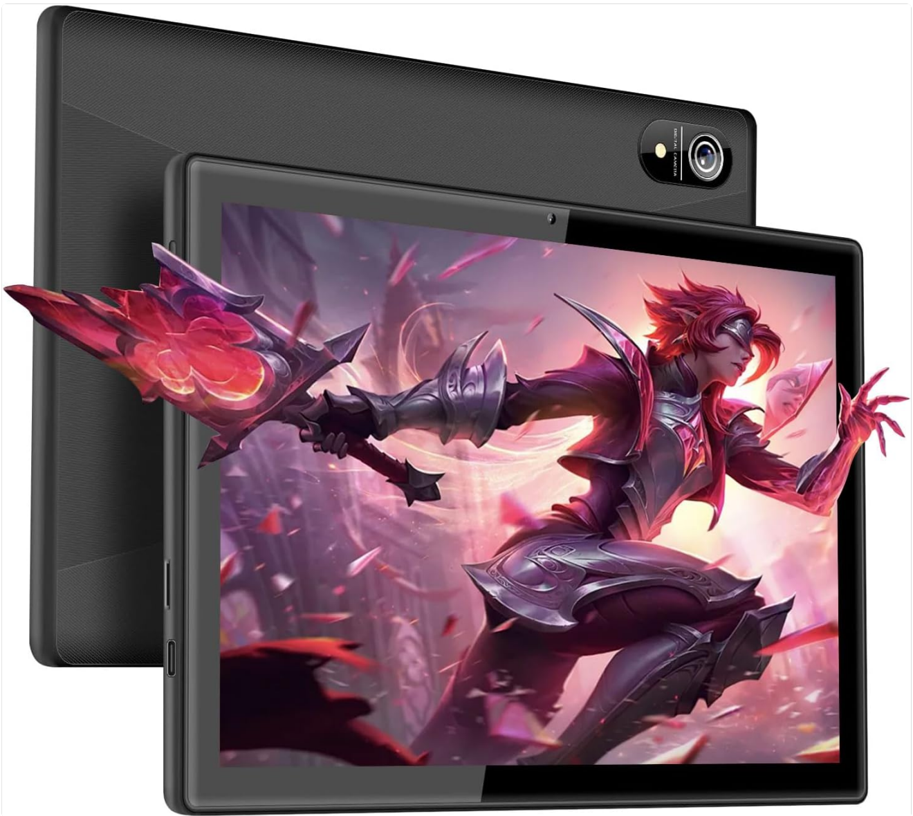
Image: Front view of the YYSWIE 2025 Android 13 Tablet, showcasing its sleek design and vibrant display.