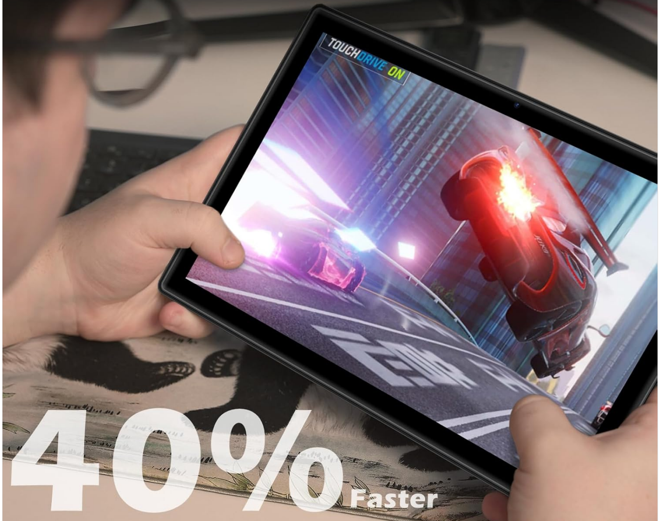
Image: A user holding the YYSWIE Tablet while playing a racing game, demonstrating the smooth performance provided by the Octa-Core processor.

40% increase in processing speed compared to regular Quad-Core tablets. Effectively minimizing delays and freezes.