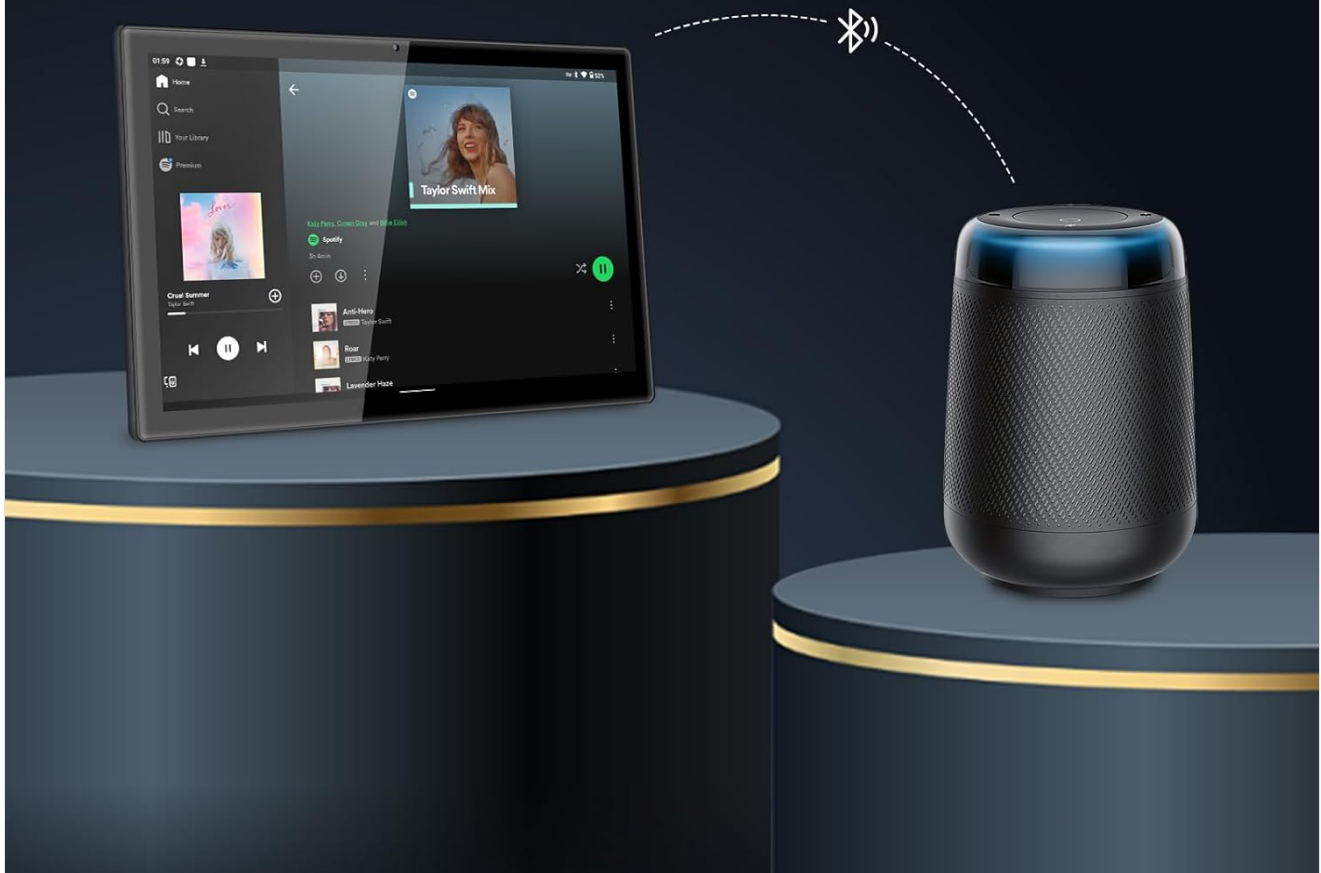
Image: The YYSWIE Tablet connected to a Bluetooth speaker, illustrating its 5G+2.4G WiFi and Bluetooth 5.0 capabilities for fast and stable wireless connections.

Access the internet quickly with high-speed 5G+2.4G dual-band WiFi. Experience faster data and audio transfer with BT 5.0 at up to 2Mbps.