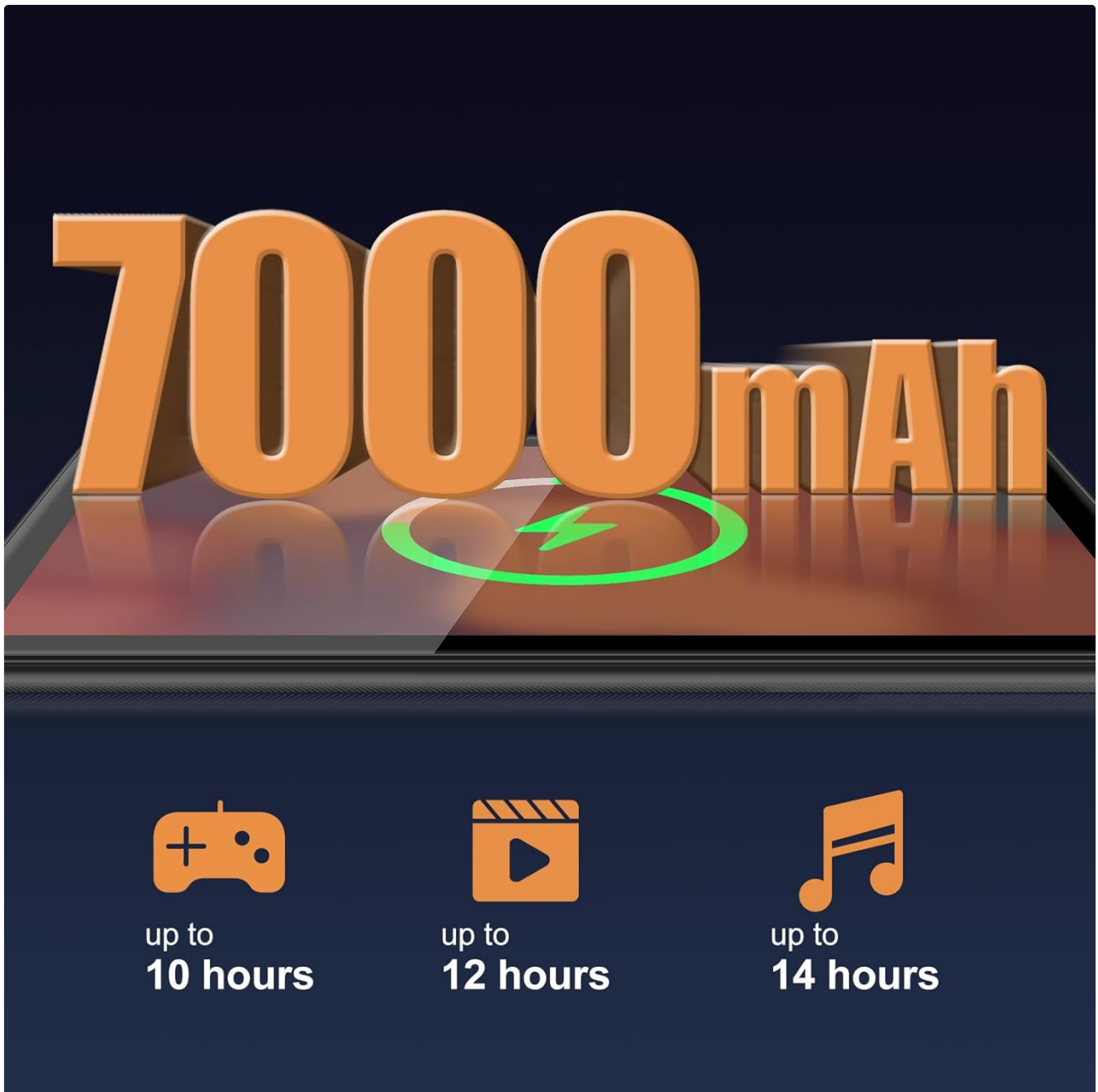
Image: A graphic illustrating the 7000mAh battery capacity and its estimated usage times for gaming, streaming, and e-reading.