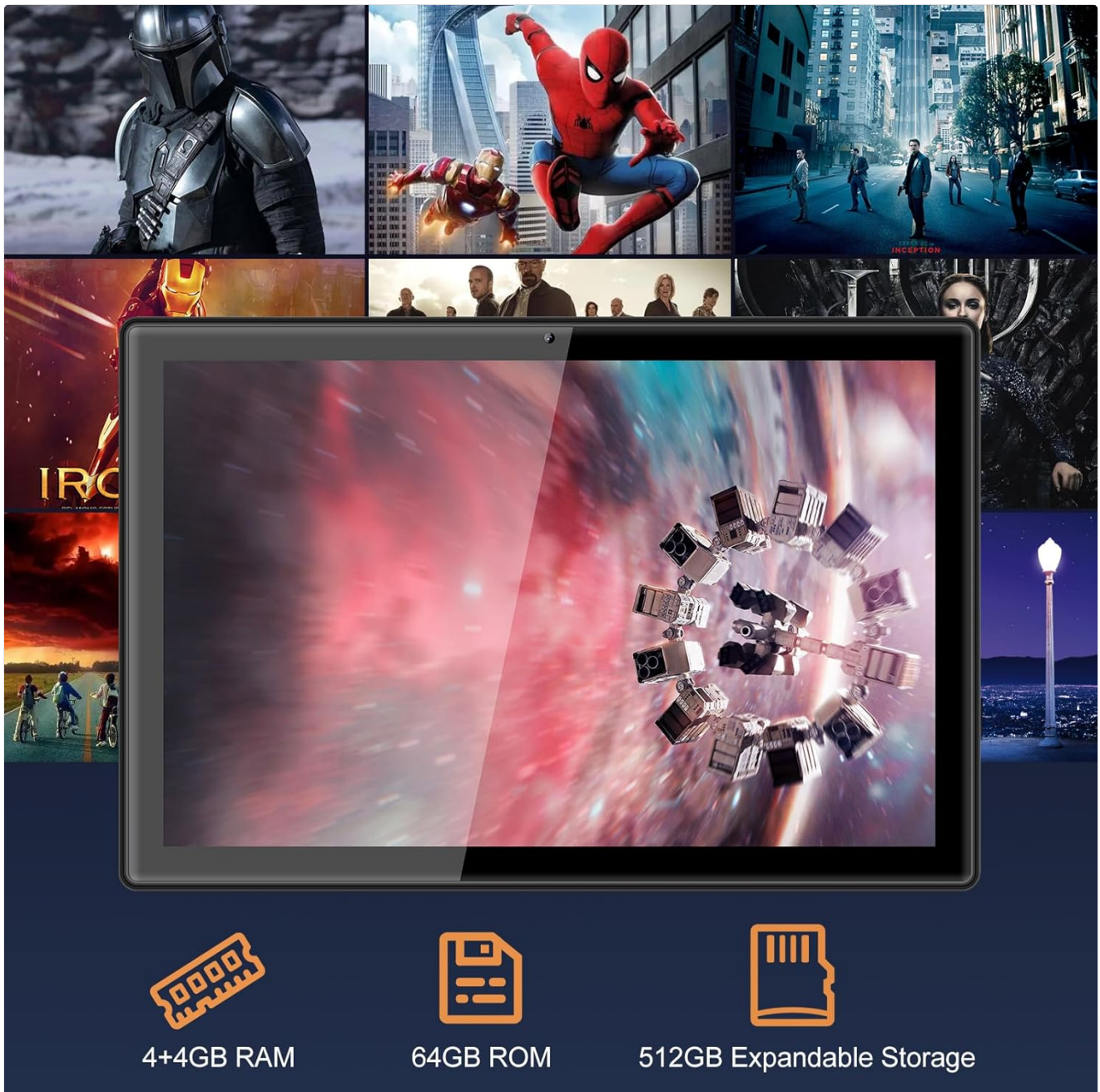
Image: Visual representation of the tablet's storage capabilities, showing 4+4GB RAM, 64GB ROM, and 512GB expandable storage via TF card.