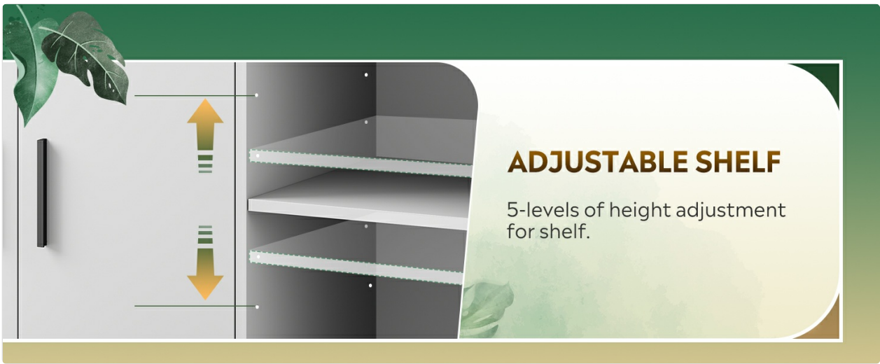
Image: Illustration of the adjustable shelf feature, allowing for 5 levels of height customization.