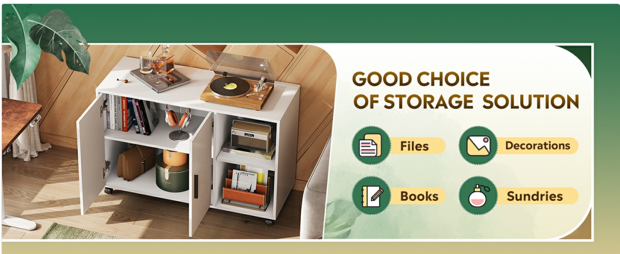
Image: The cabinet as a versatile storage solution for various items including files, books, and decorations.

The cabinet offers both enclosed storage behind dual doors and open shelving. Use the enclosed sections for items you wish to keep out of sight, and the open shelves for frequently accessed items or decorative pieces.