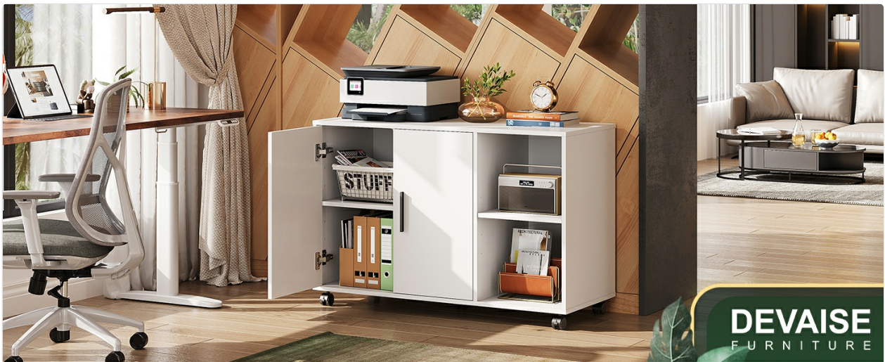
Image: The DEVAISE AHDG066WH Office Storage Cabinet in a modern office setting, showcasing its use as a printer stand and storage unit.

The DEVAISE AHDG066WH Office Storage Cabinet is a versatile and functional piece of furniture designed for organizing office supplies, files, and serving as a printer stand. It features dual doors, adjustable shelves, and 360° swivel wheels with locking mechanisms for mobility and stability. Constructed from scratch-resistant and water-resistant particle board, this cabinet is built for durability in various home and office environments.