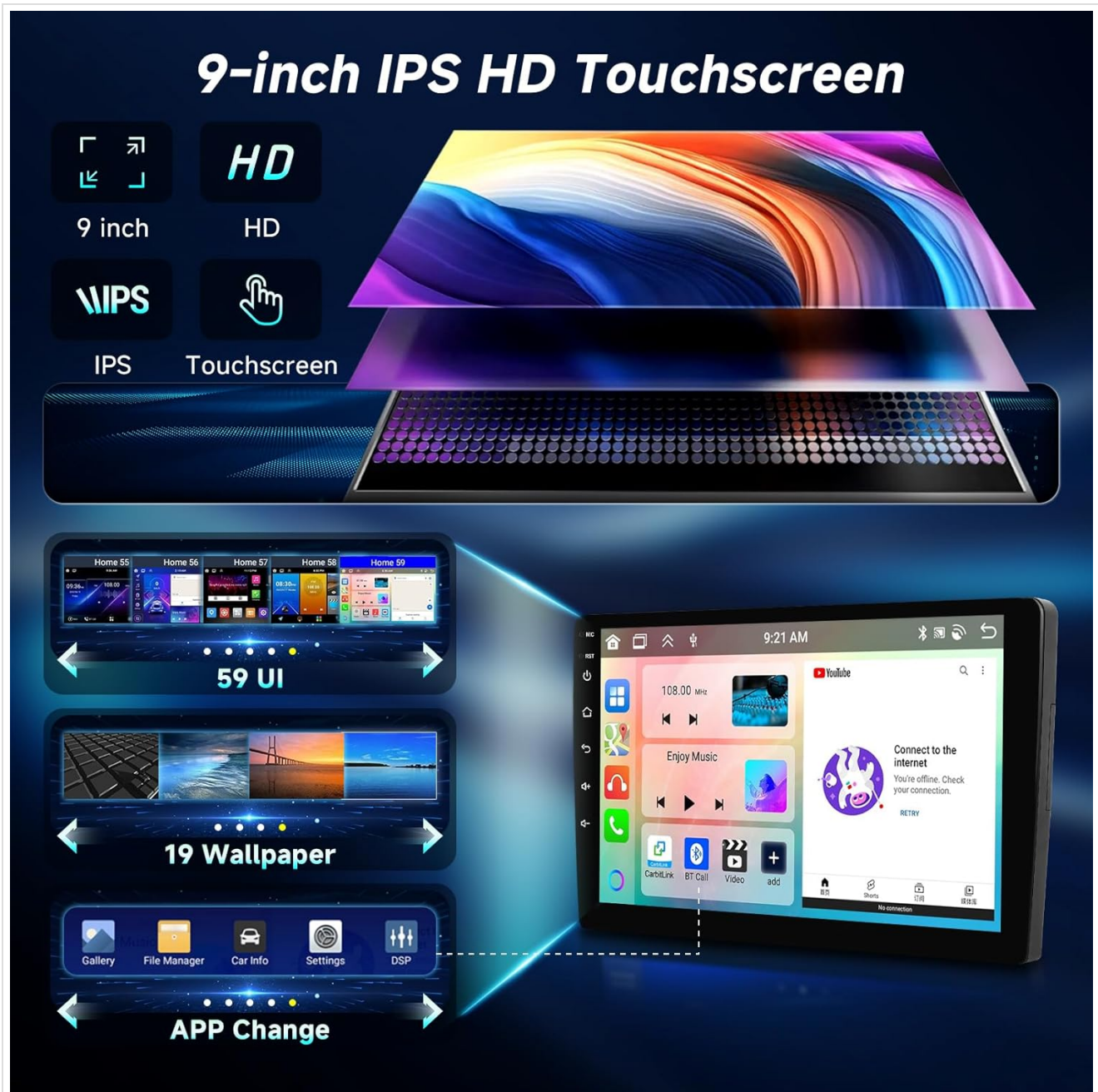
Image: This visual demonstrates the high-definition IPS touchscreen, showcasing different user interface themes and wallpaper customization options available on the device.

The 9-inch IPS HD touchscreen provides a clear and responsive interface. Navigate through menus and applications by tapping, swiping, and pinching. The system offers various UI themes and wallpaper options for personalization.