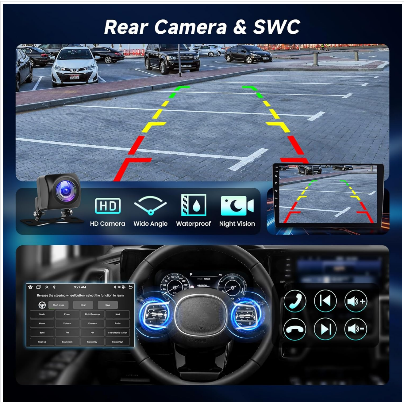
Image: This visual depicts the rear camera display with parking assistance lines and the interface for configuring steering wheel controls.

When the vehicle is shifted into reverse gear, the unit automatically displays the rear camera feed, providing a clear view of the area behind your vehicle for safer parking and maneuvering.