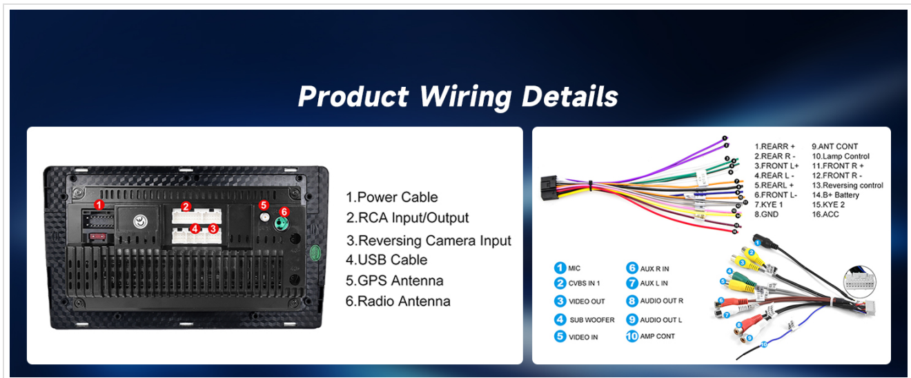
Image: A comprehensive diagram illustrating the rear connections of the car stereo and the color-coded wiring harness. Labels indicate connections for power, RCA audio/video, USB, GPS, radio antenna, and specific control wires like REAR, FRONT, SUB WOOFER, AMP CONT, and SWC.

Refer to the following diagram for correct wiring connections. Incorrect wiring can cause damage to the unit or vehicle.