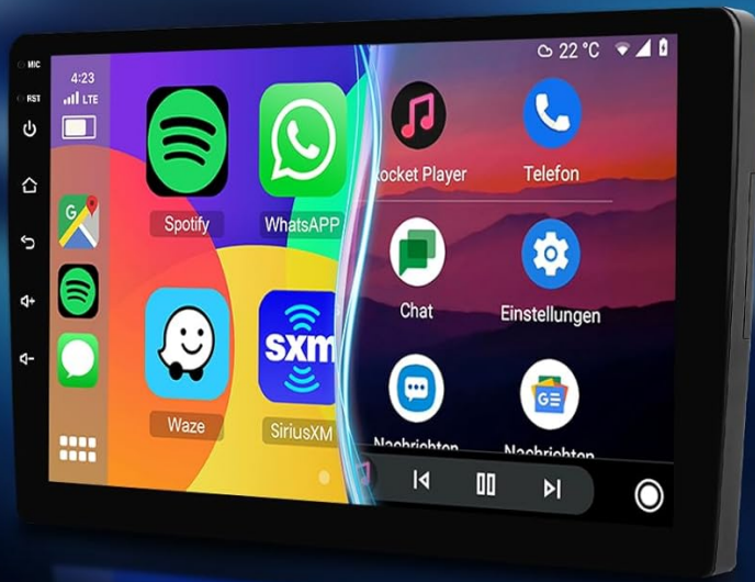
Image: This graphic highlights the wireless connectivity for Apple Carplay and Android Auto, enabling smartphone mirroring and voice control for hands-free operation.