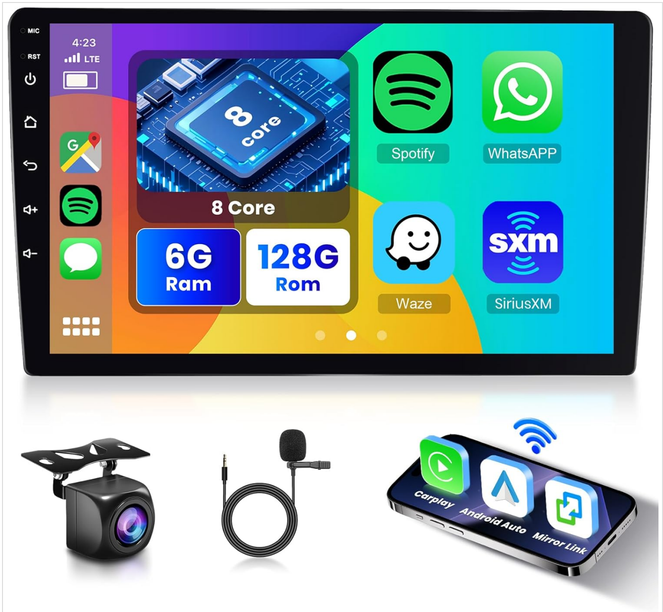
Image: The main product image showcasing the 9-inch display with its Android interface, highlighting the 8-core processor, 6GB RAM, and 128GB ROM. Also shown are the included rear camera, external microphone, and smartphone integration features like Wireless Carplay, Android Auto, and Mirror Link.

The Hodozzy 9-inch Android 8-Core Car Stereo is designed to enhance your in-car entertainment and navigation experience. It features a high-definition IPS touchscreen, powerful 8-core processor, and extensive connectivity options.