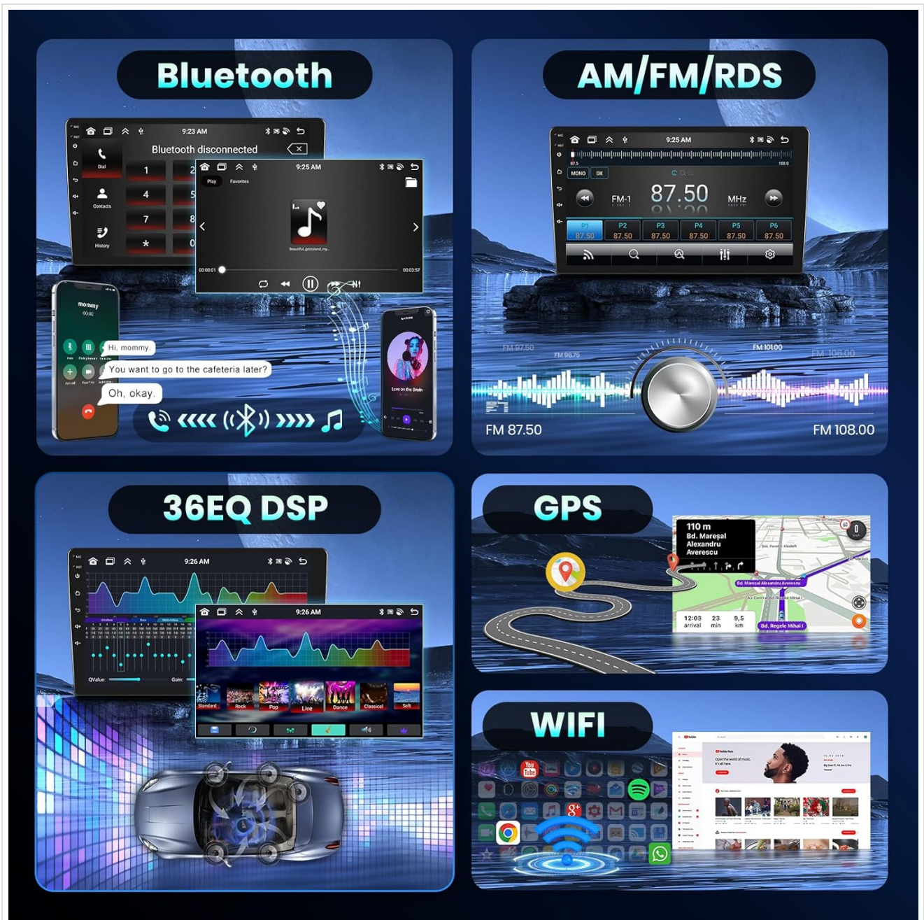
Image: A multi-panel display showing the Bluetooth interface for phone pairing and music playback, alongside other features like FM/RDS radio, DSP audio settings, GPS navigation, and WiFi.