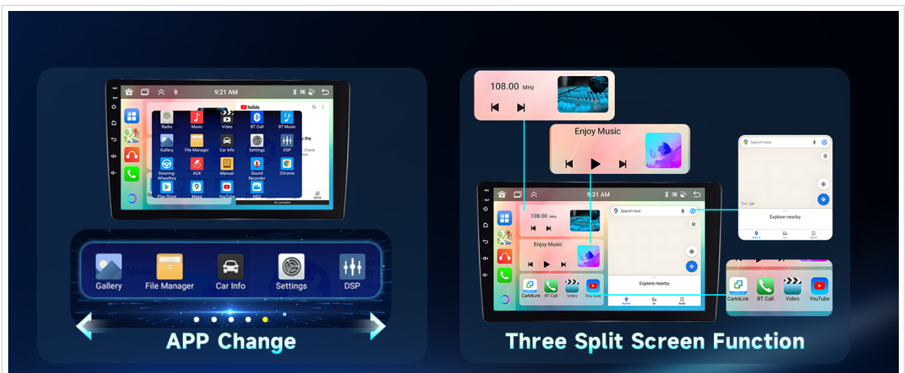
Image: This image shows the car stereo display divided into multiple sections, demonstrating the split-screen functionality that allows users to view and interact with several applications concurrently.

Utilize the split-screen feature to run two applications simultaneously, such as navigation on one side and music playback on the other, enhancing multitasking capabilities.