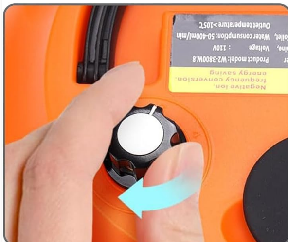
Adjust the steam regulating gear