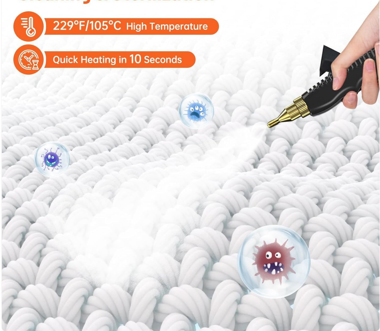
Image illustrating the 2500W high power, 105°C high temperature, and 10-second fast heating capabilities of the steam cleaner.