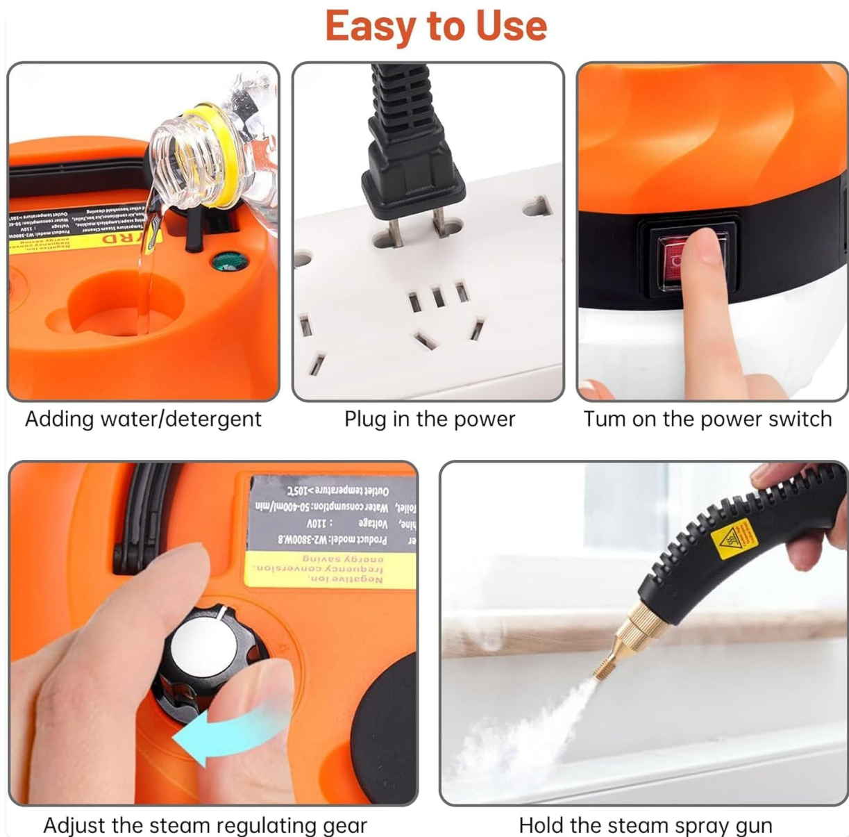
Image showing the 'Easy to Use' steps, including plugging in the power cord.

Plug the power cord into a suitable electrical outlet.