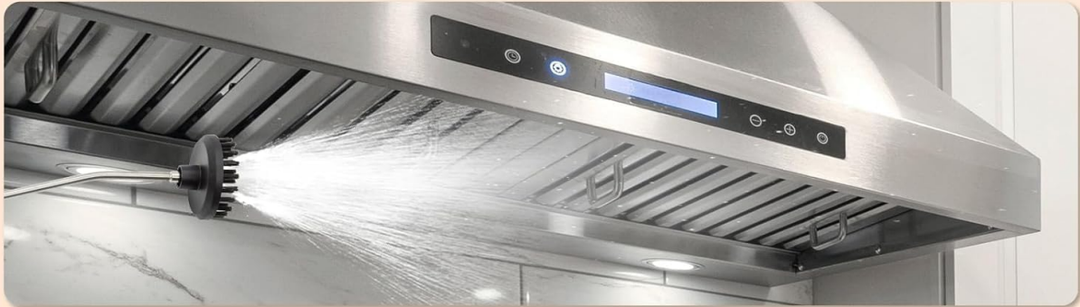
Image illustrating the steam cleaner's versatility across different areas of the home, including kitchen, living room, and bathroom.