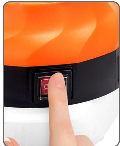
Turn on the power switch