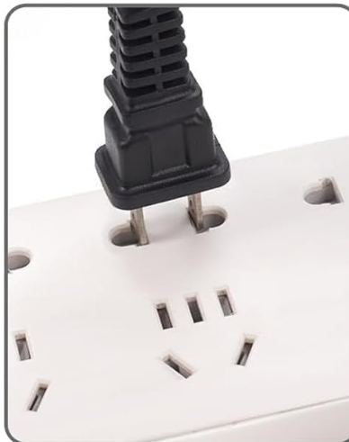
Plug in the power