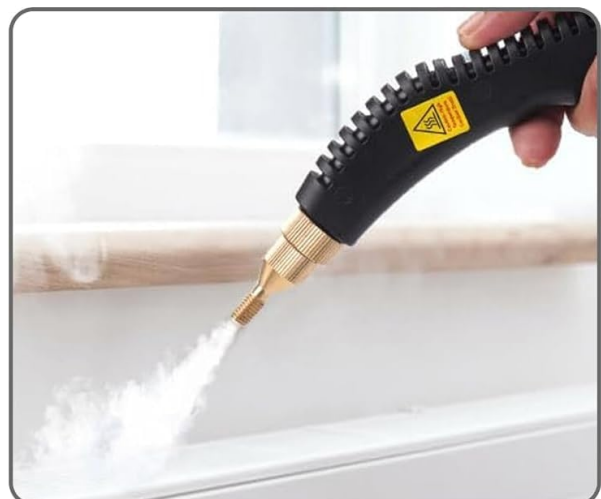
Hold the steam spray gun