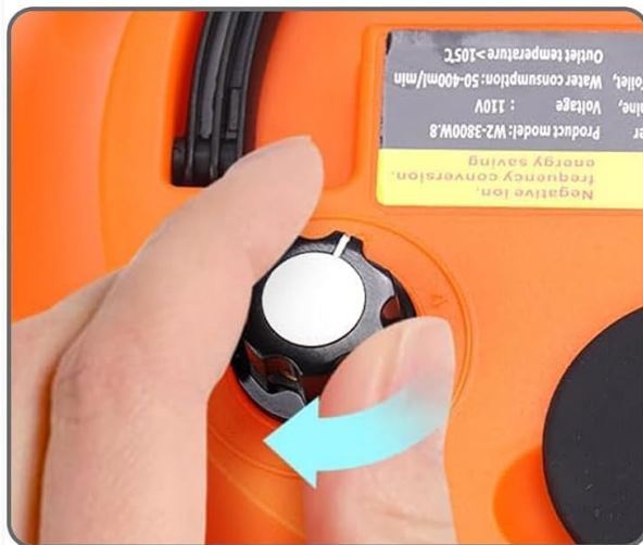
Adjust the steam regulating gear