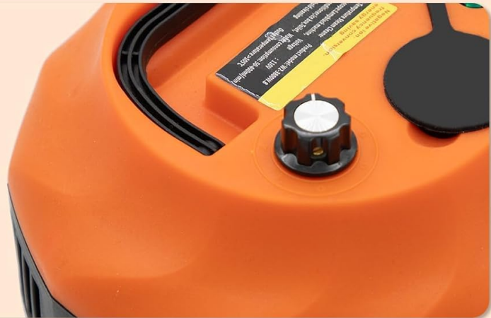
Image showing the steam cleaner's control knob, allowing for 6 levels of adjustable steam output.