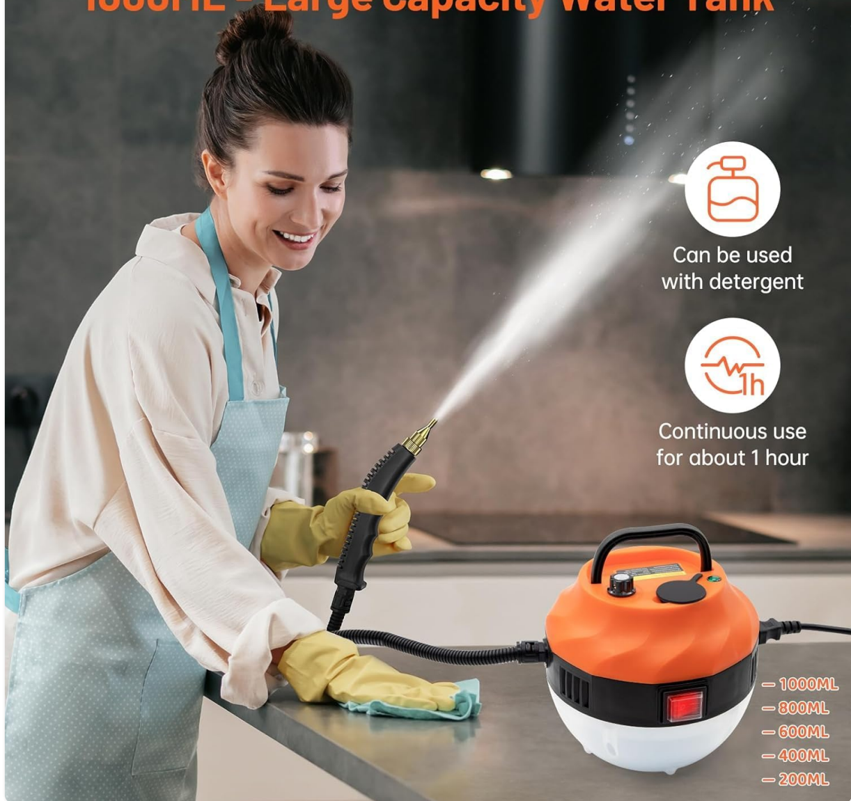
Image of a woman using the steam cleaner on a kitchen counter, demonstrating its application.