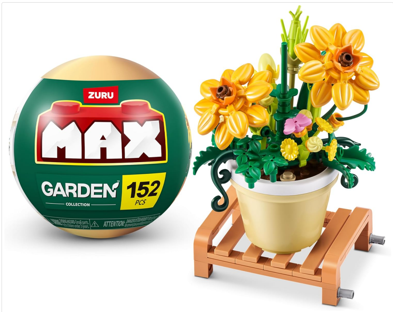
Image: The MAX Build More Garden Collection capsule alongside the assembled Cosmos Sulphureus plant, highlighting the product's packaging and final form.