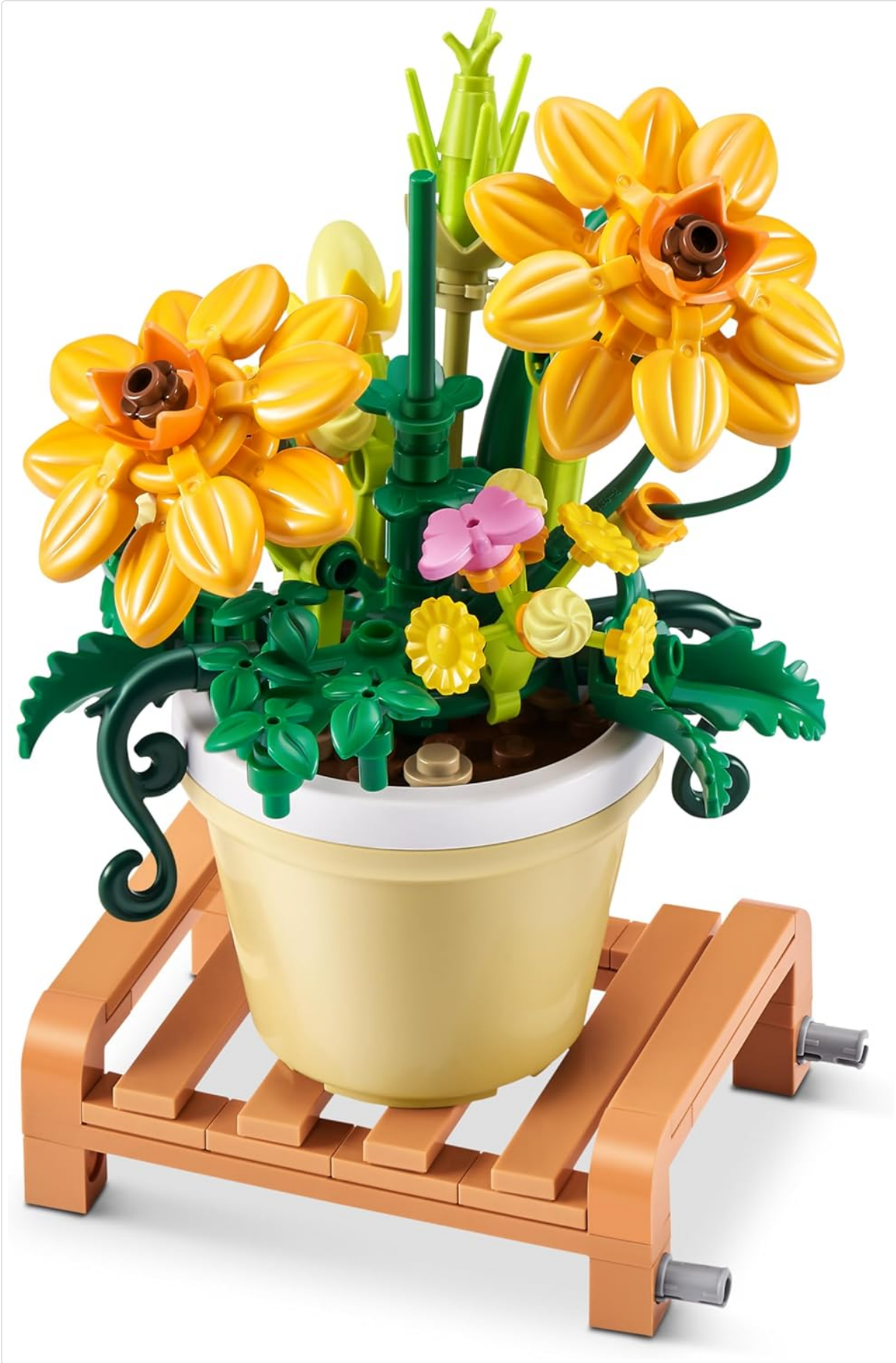
Image: A detailed view of the assembled Cosmos Sulphureus plant, showcasing its vibrant colors and intricate design within its pot and stand.