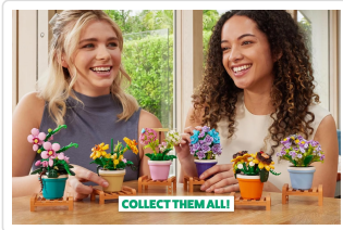
Image: Two people interacting with and displaying their assembled MAX Garden building brick plants, highlighting the enjoyment of the product.

Image: A collection of various MAX Garden building brick plants, showcasing the diversity of the collection.