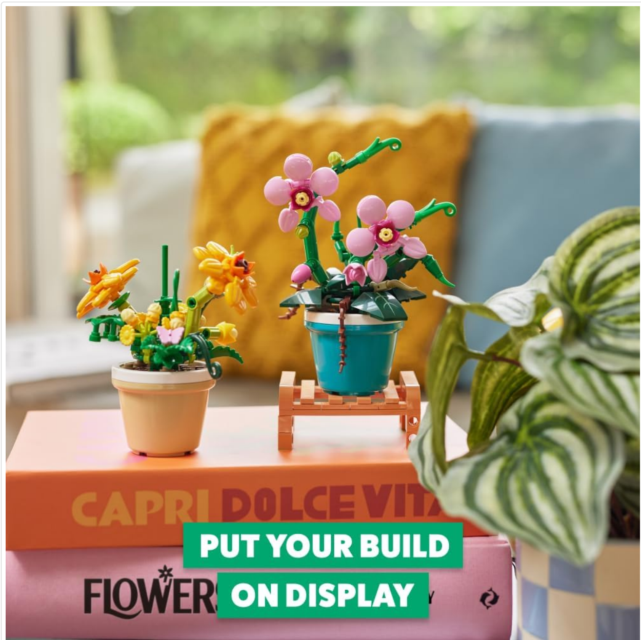
Image: Two assembled MAX Garden plants, including a pink orchid and a yellow flower, displayed on a stack of books, illustrating potential decorative arrangements.