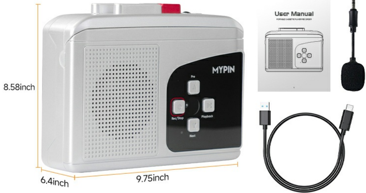
Image: A visual representation of the packing list, displaying the cassette player, user manual, USB-C charging cable, and mini microphone. Dimensions of the player are also indicated.