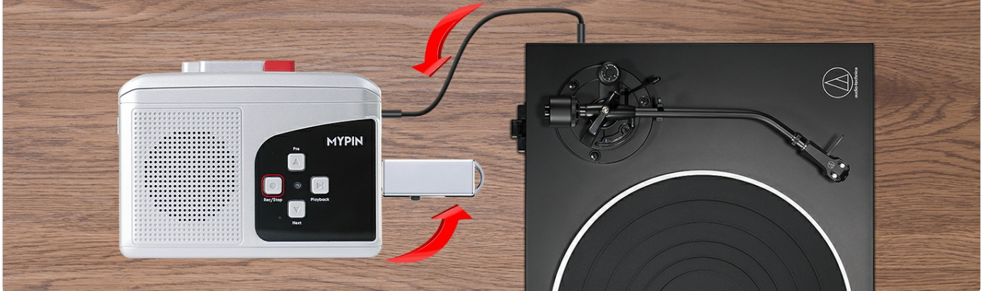
Image: The MYPIN cassette player connected to a turntable using an AUX cable, illustrating its capability to record external audio sources onto a blank tape or convert to MP3.