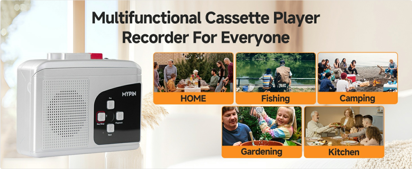
Image: A collage of images depicting the MYPIN cassette player being used in diverse settings such as home, fishing, camping, gardening, and the kitchen, highlighting its versatility.