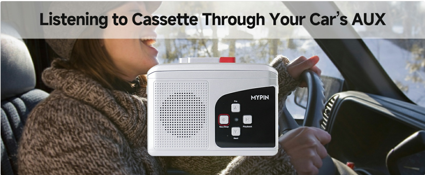
Image: The MYPIN cassette player positioned in a car, indicating its compatibility and convenience for listening to cassette tapes on the go, potentially through the car's AUX system.