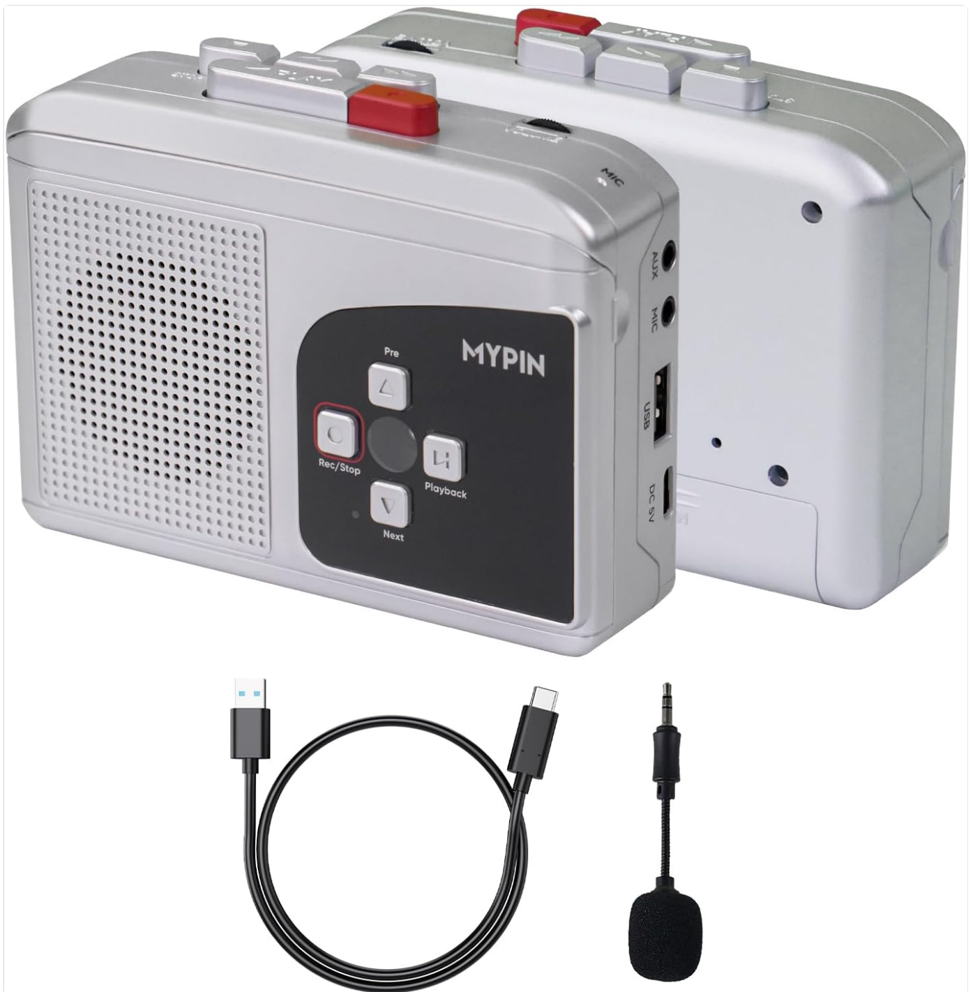
Image: The MYPIN Portable Cassette Player shown with its included accessories: a USB-C charging cable and a mini microphone.