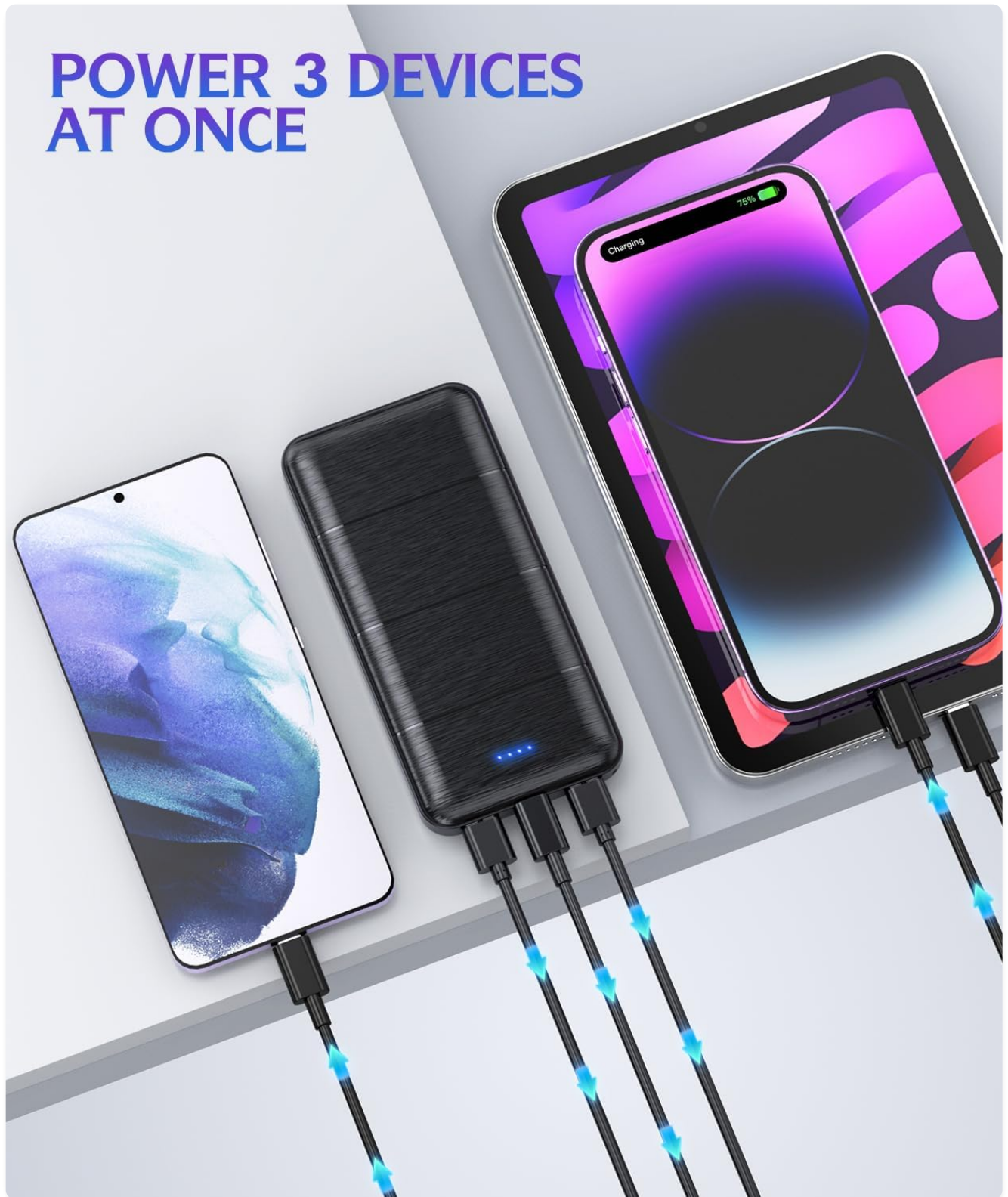
Image: The power bank connected to and charging three devices simultaneously, demonstrating its multi-device charging capability.

bank will automatically detect your device and begin charging. The intelligent controlling IC adjusts current and voltage for optimal charging.