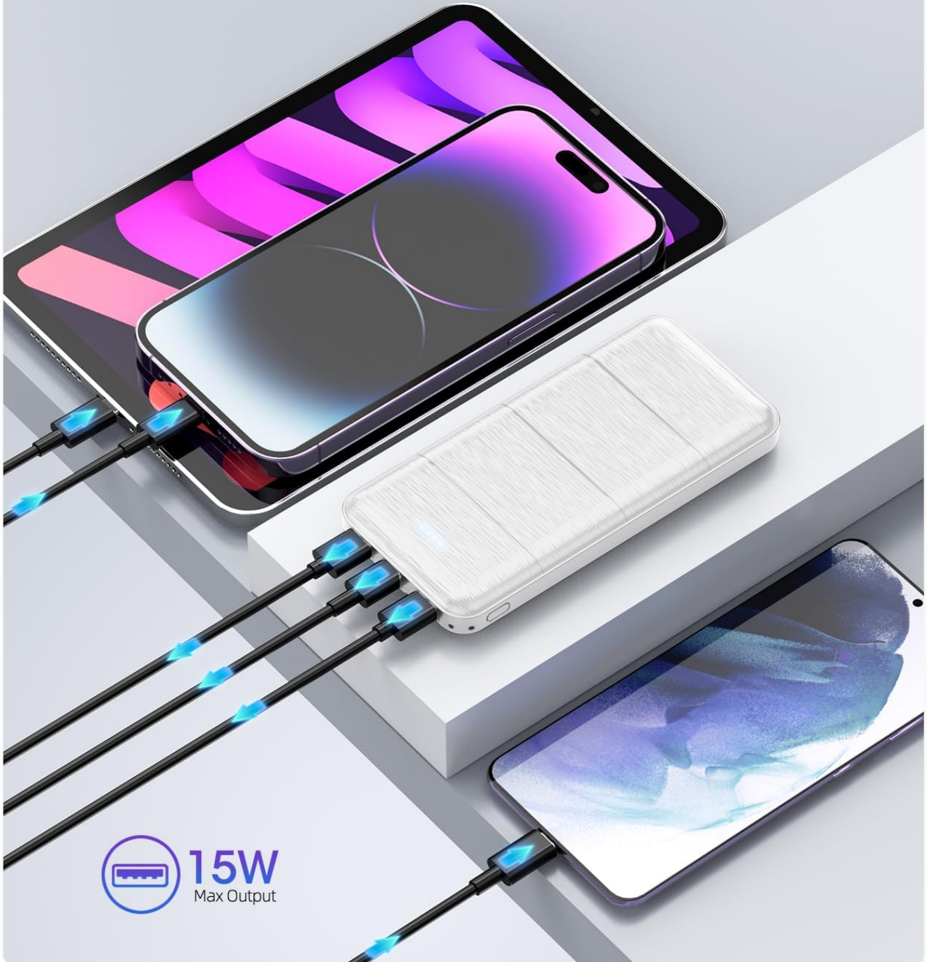
Image: The power bank actively fast charging a smartphone and a tablet, emphasizing its 15W maximum output capability.

Intelligently identifies your device to deliver the fastest possible charge