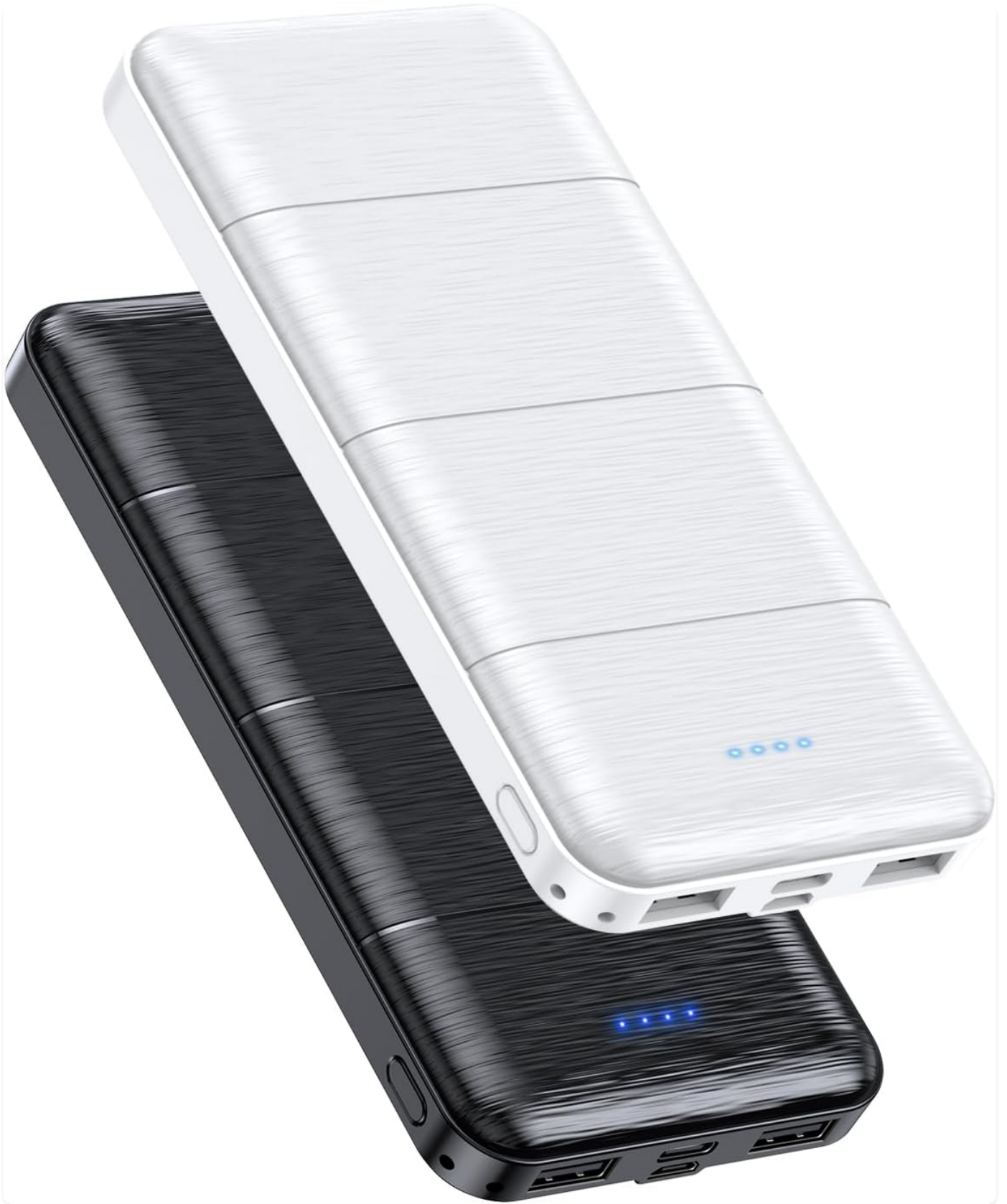
Image: The LOVELEDI 15000mAh Portable Charger in light black and white, showcasing its sleek design and compact form factor.