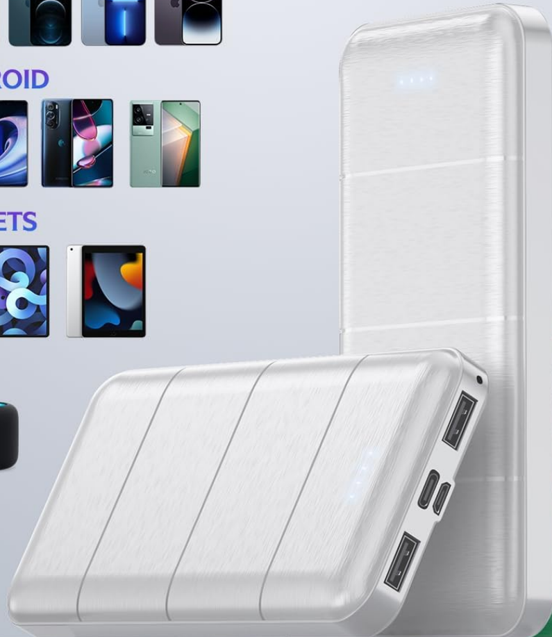
Image: A display of various electronic devices, including smartphones, tablets, and other gadgets, indicating the power bank's broad compatibility.