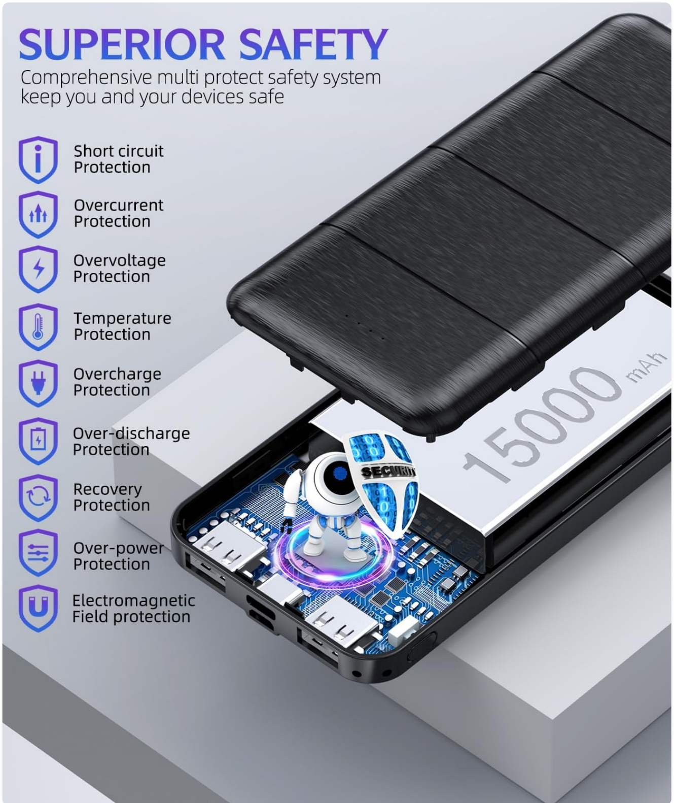
Image: An exploded view of the power bank highlighting its internal safety mechanisms, including various protection circuits.