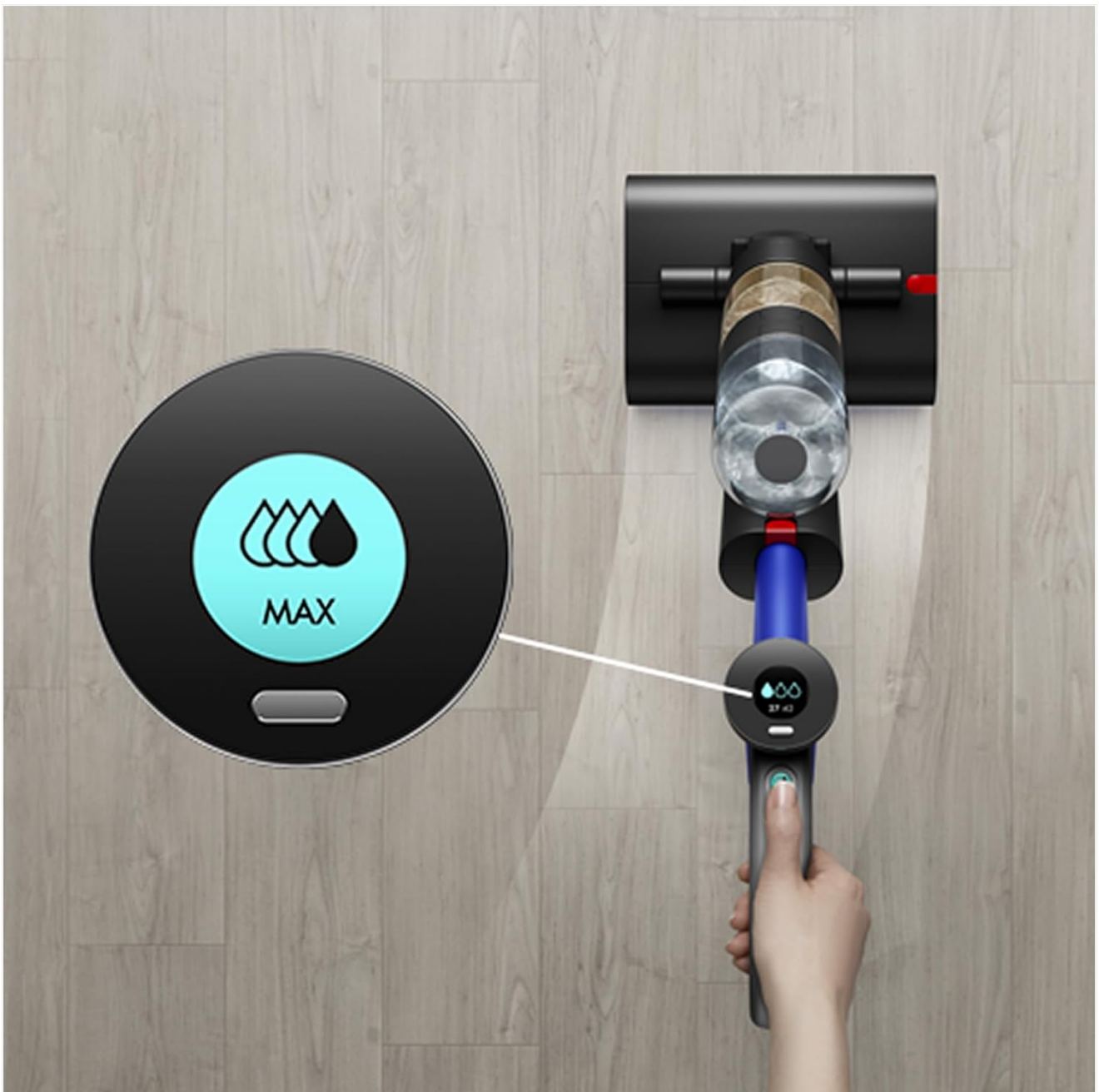
Image: Close-up of the Dyson WashG1's digital display, showing the 'MAX' cleaning mode activated.