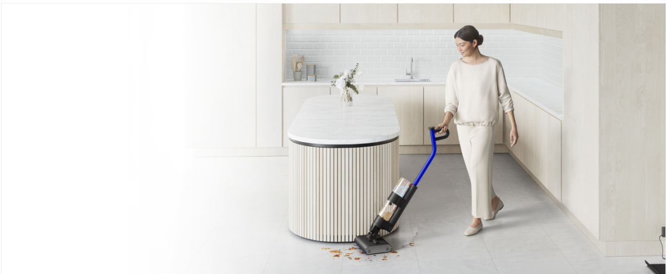
Image: The Dyson WashG1 in action, effectively cleaning up liquid and solid debris from a hard floor.

This manual provides essential instructions for the safe and effective use of your Dyson WashG1 hard floor cleaner. Please read this manual thoroughly before first use and retain it for future reference. The Dyson WashG1 is designed for powerful cleaning of both wet and dry messes on hard floor surfaces.