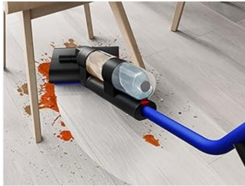
Image: An internal view showing the brush mechanism cleaning the rotating microfibre rollers.

For thorough cleaning, periodically remove the microfibre rollers and wash them under running water. Ensure they are completely dry before reinserting. Clean the filter regularly to maintain suction and water flow efficiency.