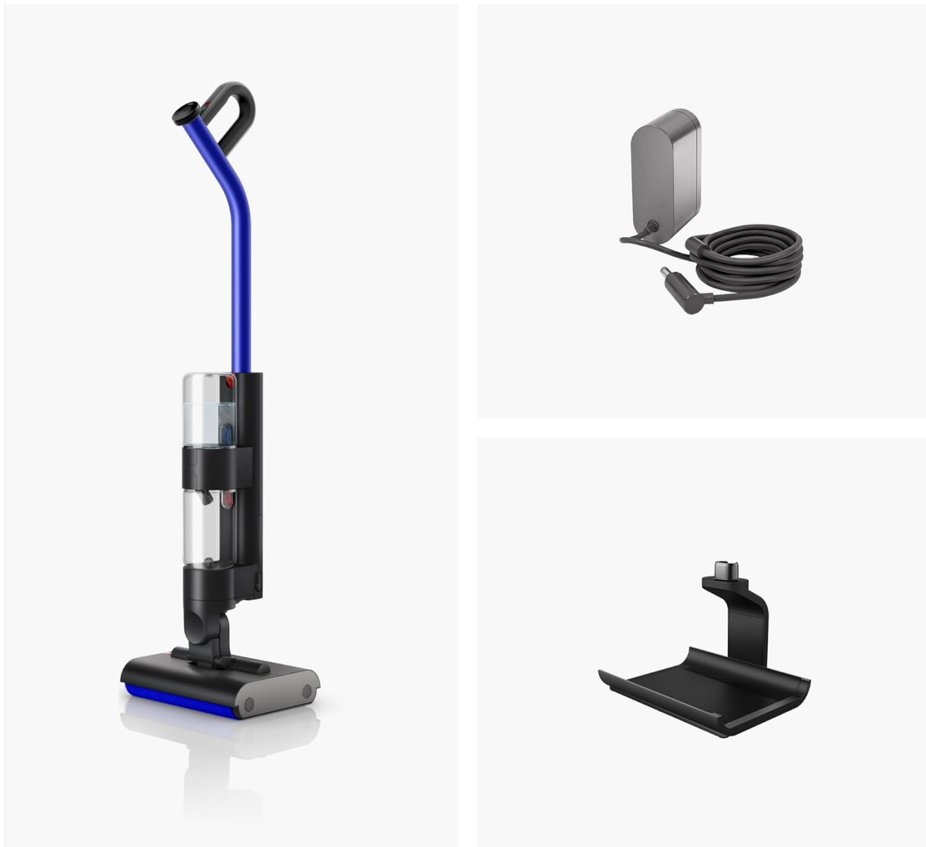
Image: The Dyson WashG1 main unit, charging dock, and power adapter as included in the box.

Assemble the handle to the main body of the cleaner until it clicks securely into place. Ensure all connections are firm before use.