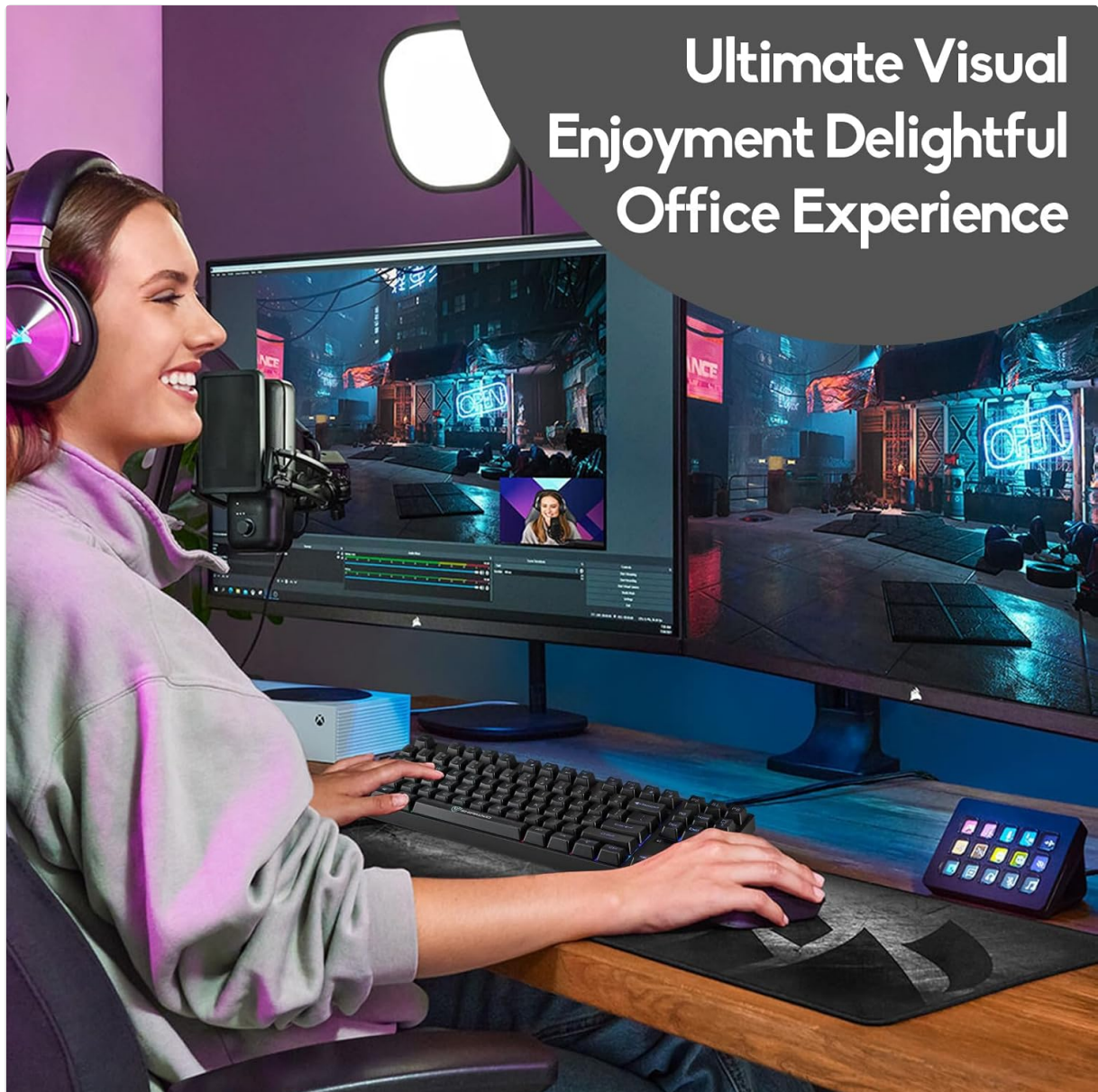
Image: The Guiheng 87-Key Wired Gaming Keyboard in a typical gaming setup, demonstrating its plug-and-play functionality.