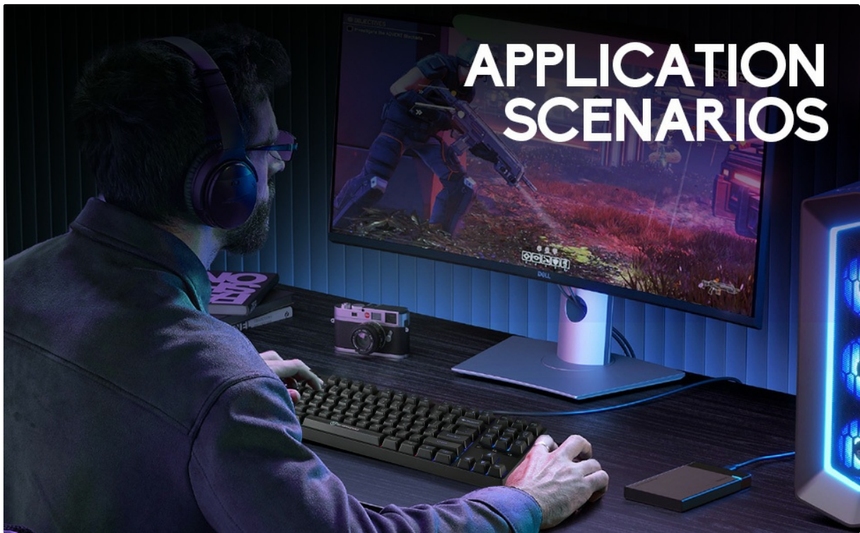
Image: The keyboard connected to various devices, illustrating its broad compatibility.