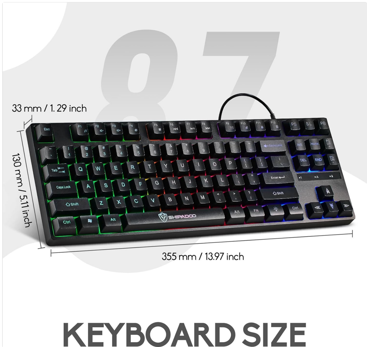
Image: Detailed dimensions of the keyboard for reference.