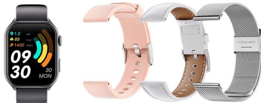
Image: Close-up of the GTS7-Pro Smartwatch highlighting its square design, curved metal frame, and dual buttons.

More than just a watch, it's a fashion inspiration.