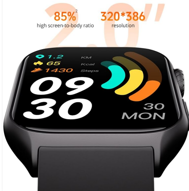
Image: Detailed view of the GTS7-Pro Smartwatch's HD display, showing its ultra-narrow bezel and 320x386 resolution.