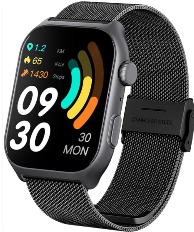
Image: Front view of the GTS7-Pro Smartwatch displaying time, steps, calories, and distance.

The GTS7-Pro Smartwatch features a sleek design with a 2-inch HD touch screen display, offering clear visuals and intuitive navigation. It includes physical buttons for additional control and a sensor array on the back for health monitoring.