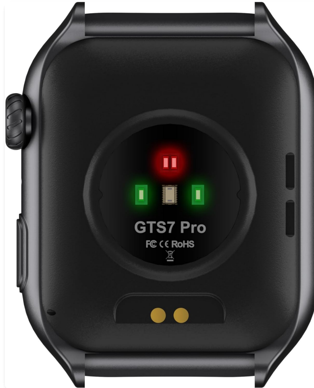
Image: Rear view of the GTS7-Pro Smartwatch, showing the optical heart rate and blood oxygen sensors, along with charging pins and model number.

The rear of the smartwatch houses the optical sensors for health monitoring and the charging contacts.