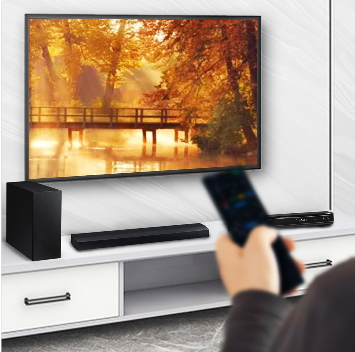
Image 4.1: An illustration of a user operating a remote control towards a home theater system, demonstrating typical usage.

Point the remote control directly at the infrared sensor on your Pioneer DVD/CD Receiver or Speaker System. Ensure there are no obstructions between the remote and the device.