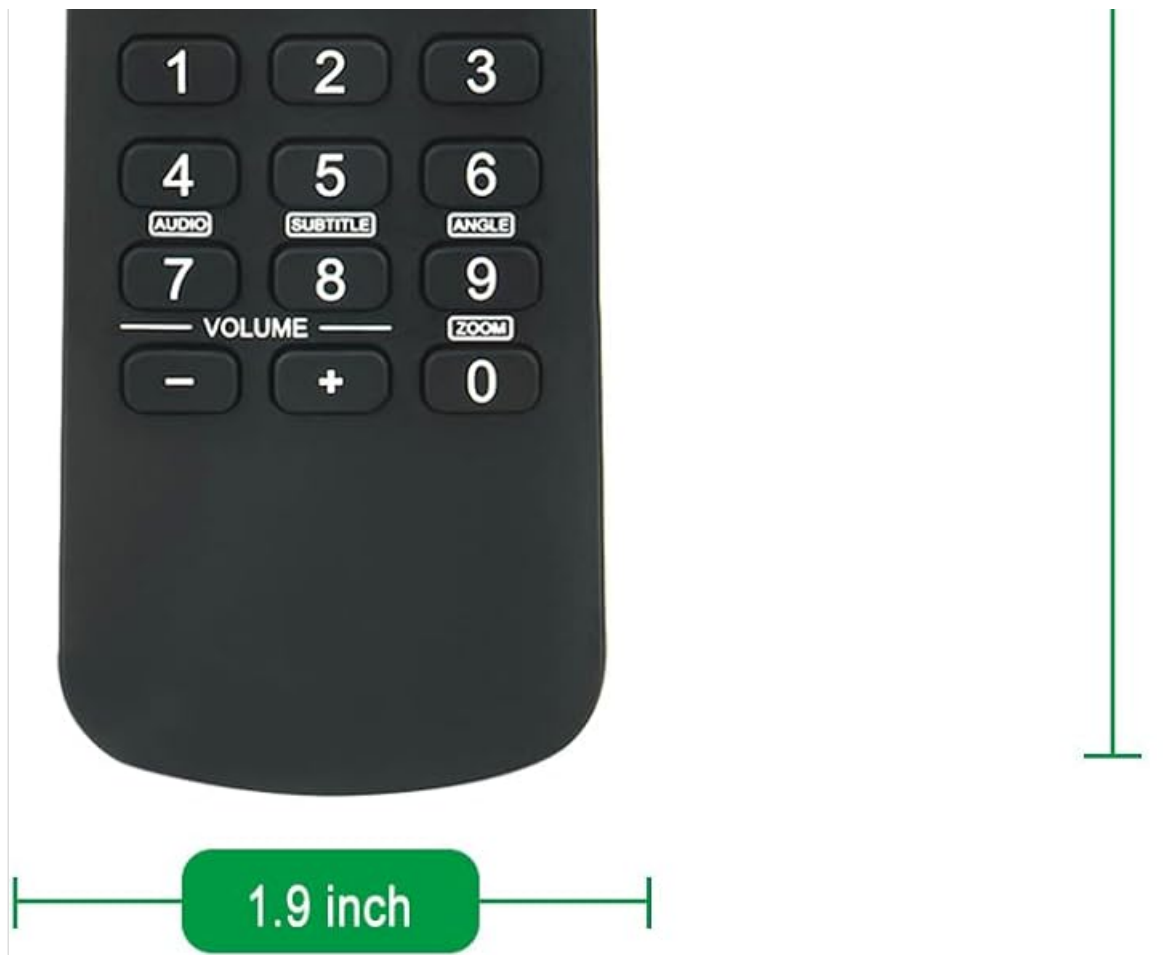
Image 8.1: The ECONTROLLY AXD7407 remote control with its approximate length (7.6 inches) and width (1.9 inches) indicated.