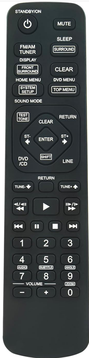
Our Replace Remote