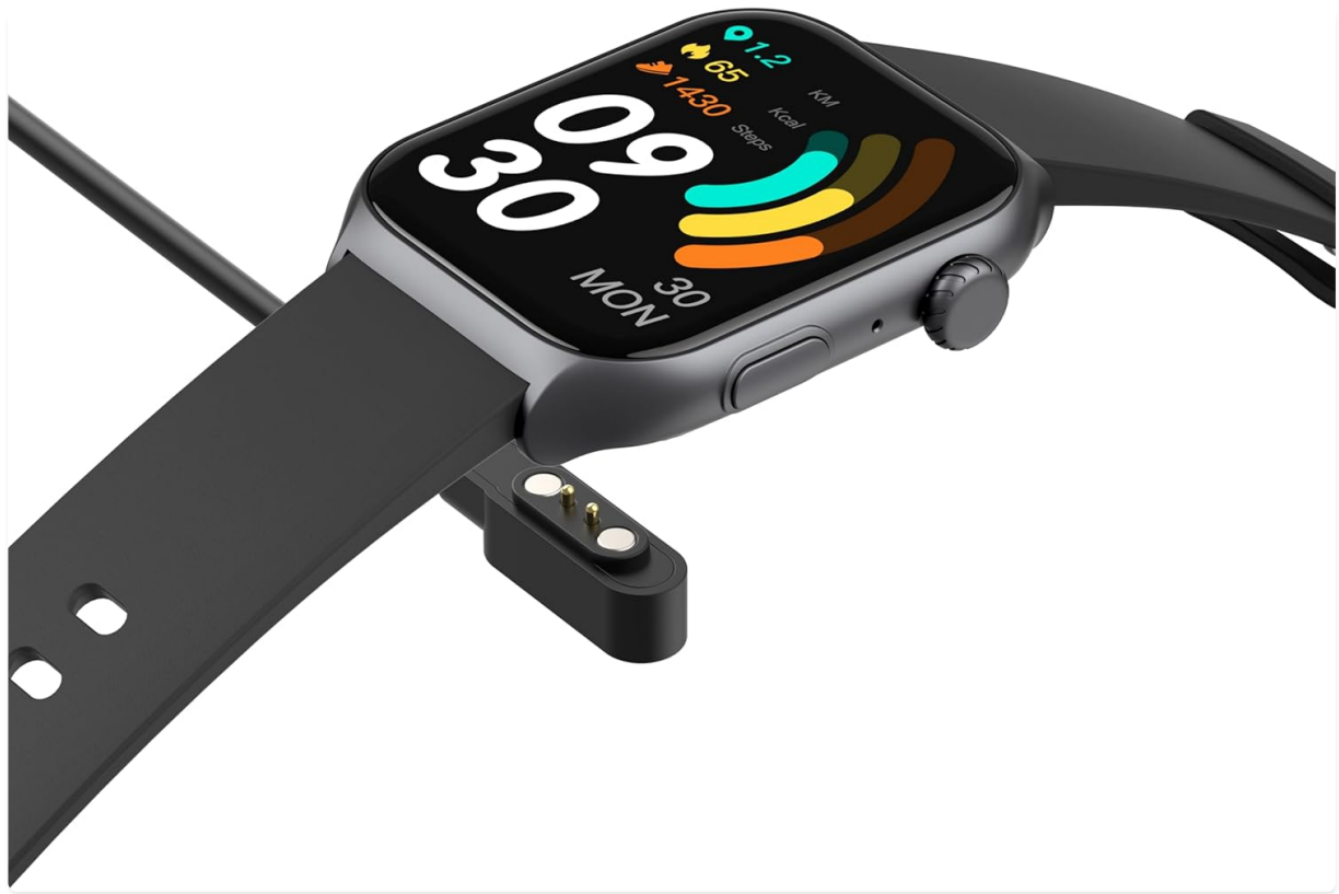
Image: The GTS7-Pro Smartwatch connected to its magnetic charging cable.