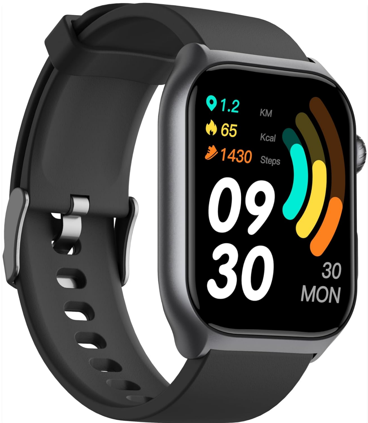
Image: Front view of the GTS7-Pro Smartwatch displaying time, steps, calories, and distance.