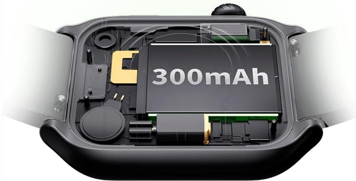
Image: An internal view of the GTS7-Pro Smartwatch highlighting its 300mAh battery.