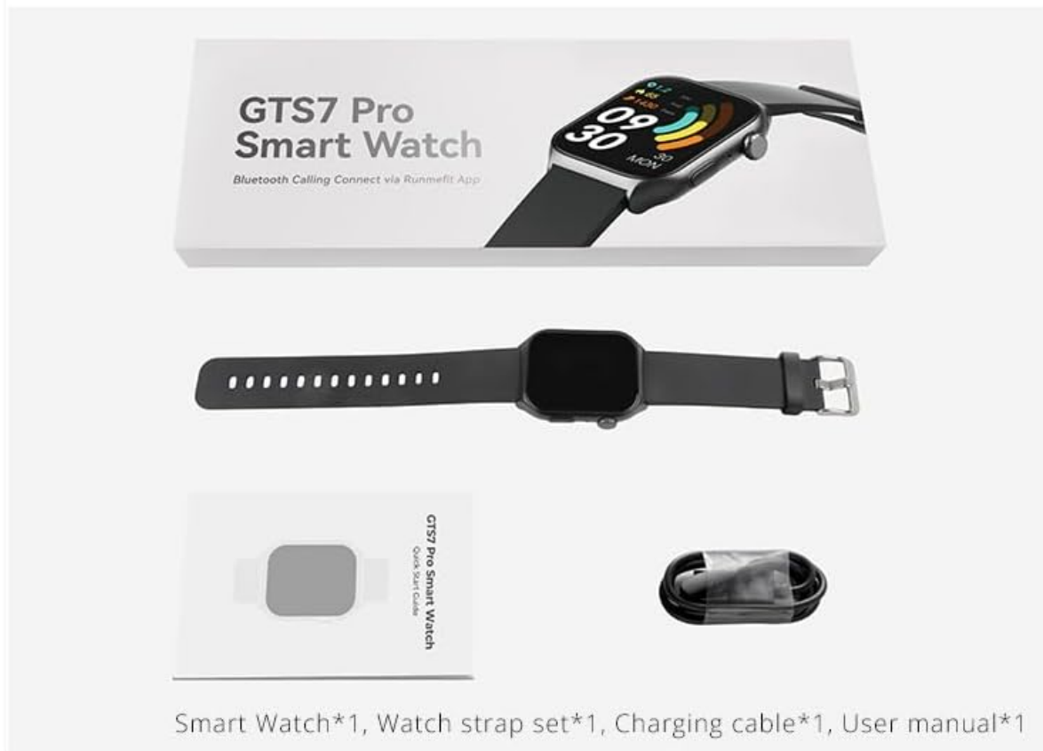
Image: Contents of the GTS7-Pro Smartwatch packaging, showing the smartwatch, USB cable, and instruction leaflet.