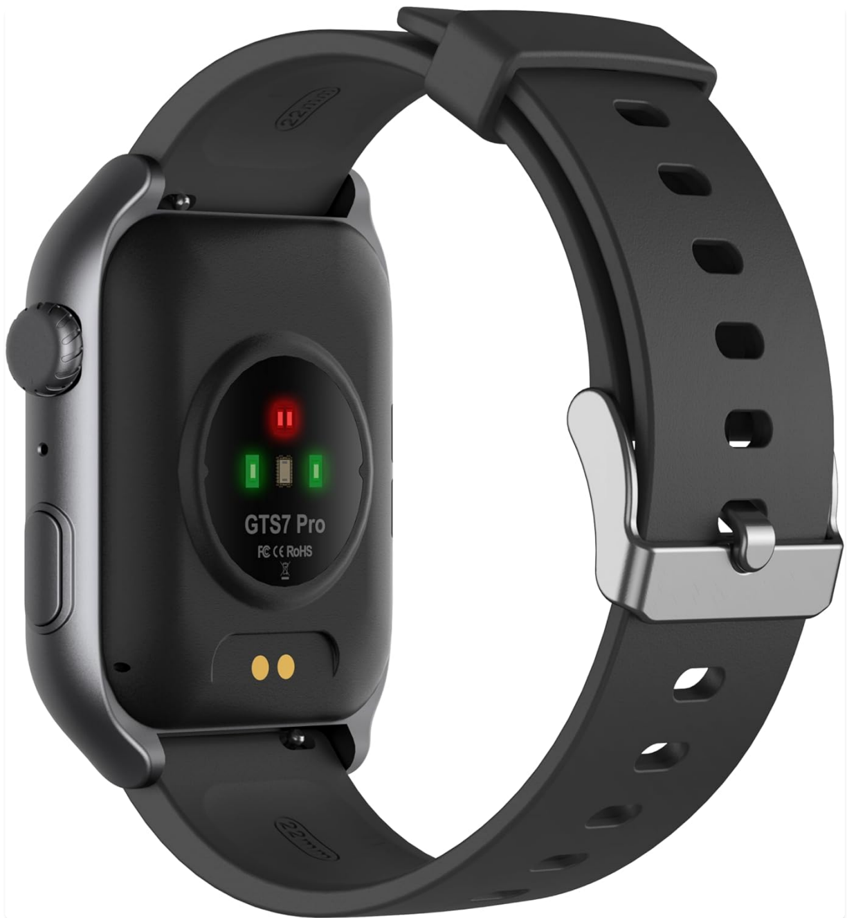
Image: Rear view of the GTS7-Pro Smartwatch showing the optical heart rate and SpO2 sensors.