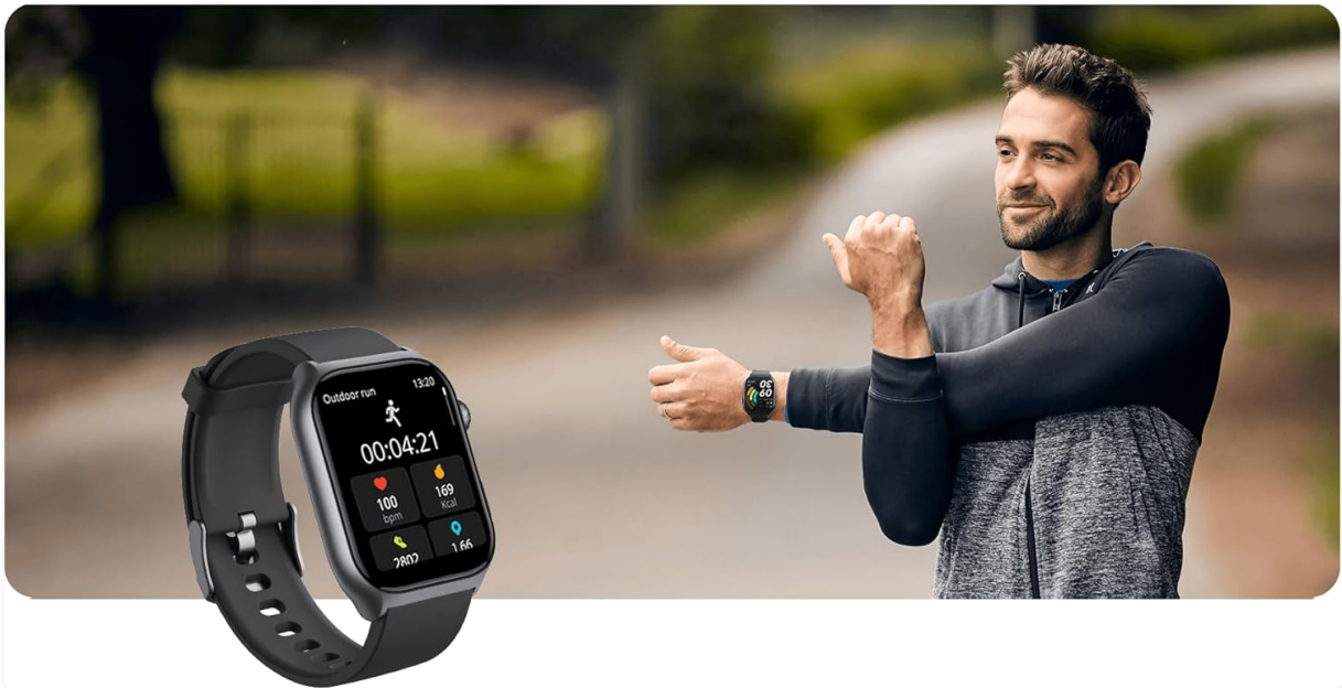
Image: A man stretching outdoors while wearing the GTS7-Pro Smartwatch, which displays workout metrics.