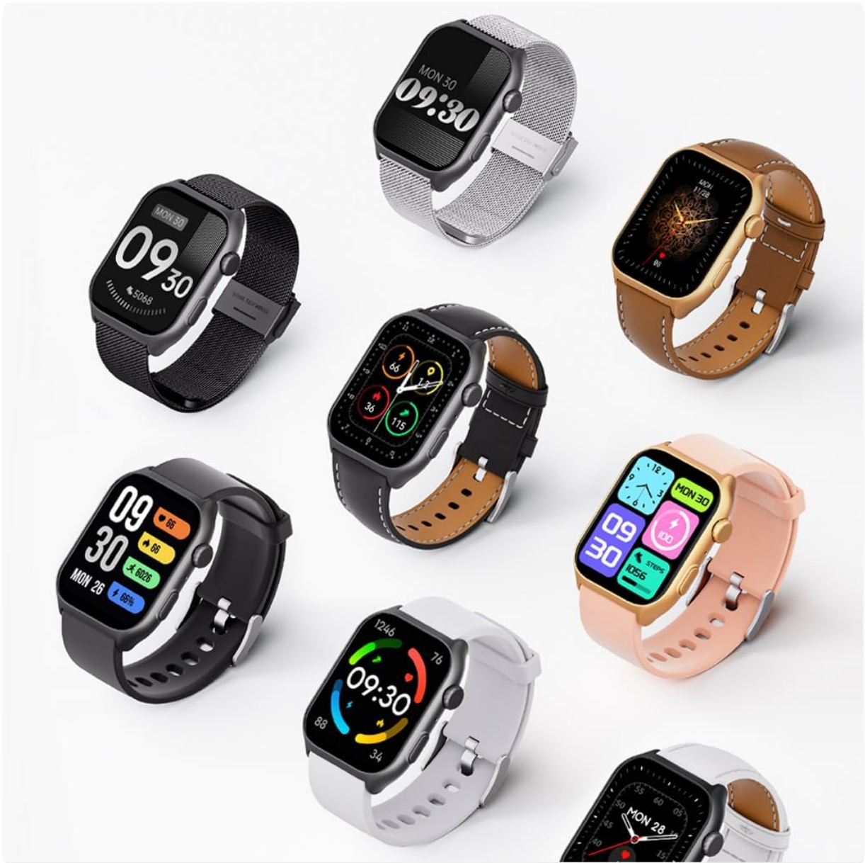
Image: A collection of GTS7-Pro Smartwatches showcasing various watch faces and strap colors/materials.