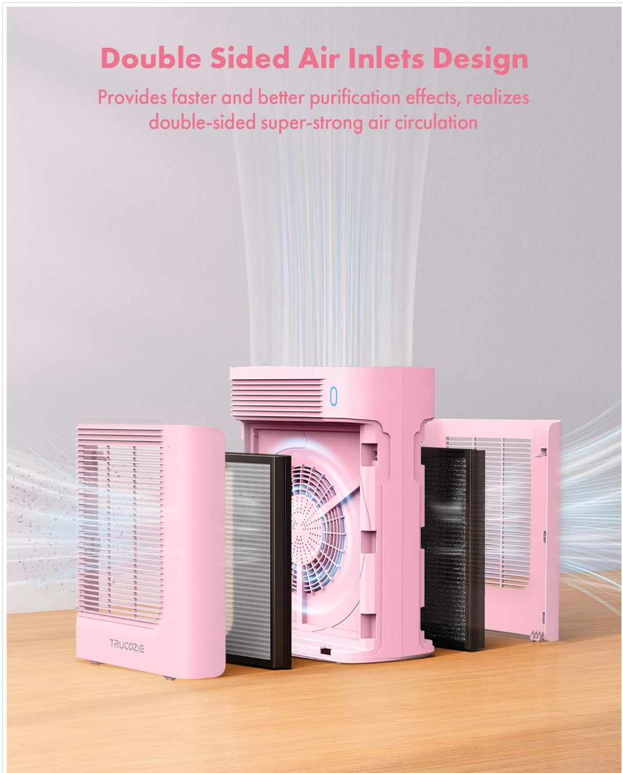
Image 5.1: View of the air purifier with side panels and filters removed for installation.