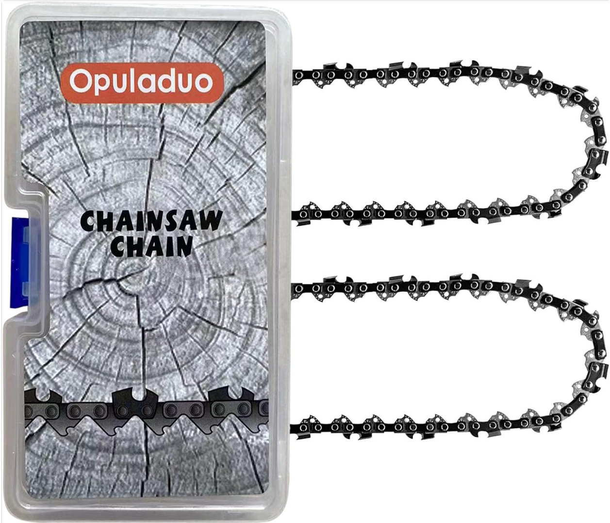
Image 3.1: Contents of the Opuladuo 18-inch Chainsaw Chain package.