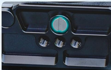
1/4"-20 Screw Mounting