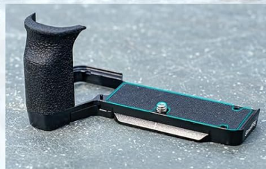
Protective Silicone Pads