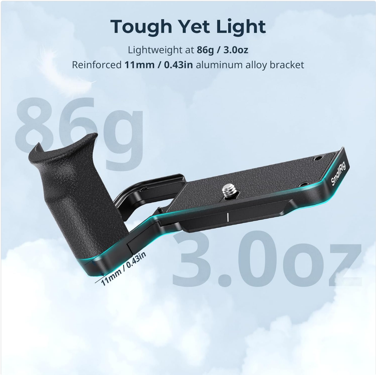
Image: The handgrip showcasing its lightweight yet robust aluminum alloy construction.

SmallRig products typically come with a limited warranty against manufacturing defects. For specific warranty details, product support, or to report any issues, please refer to the official SmallRig website or contact their customer service directly. Keep your purchase receipt for warranty claims.