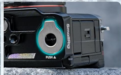
Included Flat-Head Wrench

Image: Detailed view of the secure mounting mechanism, including the 1/4" screw, protective pads, and the flat screwdriver for installation.