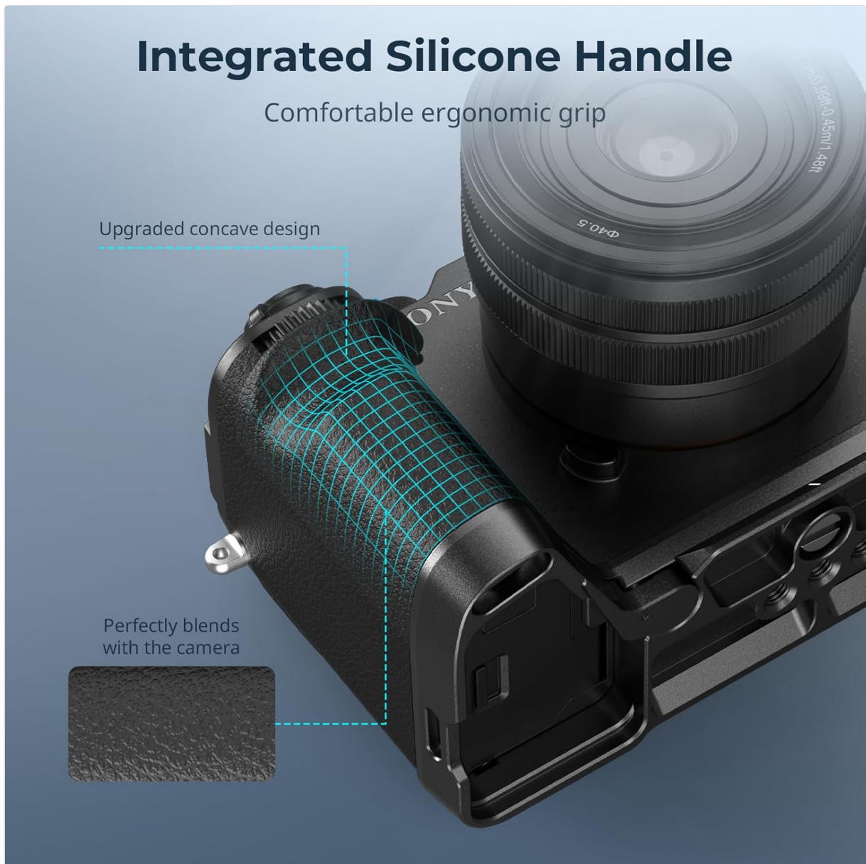
Image: Close-up of the integrated silicone handle, highlighting its ergonomic design and texture.