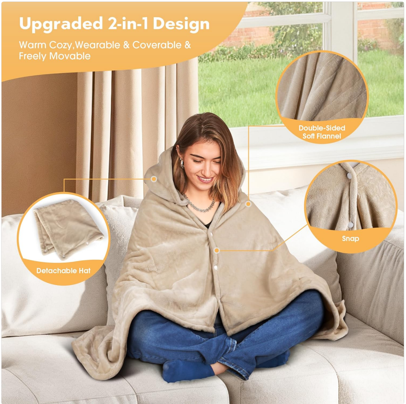
Image: The blanket's wearable design, showcasing the detachable hat, soft flannel material, and functional snap buttons.

Warm Cozy, Wearable & Coverable & Freely Movable