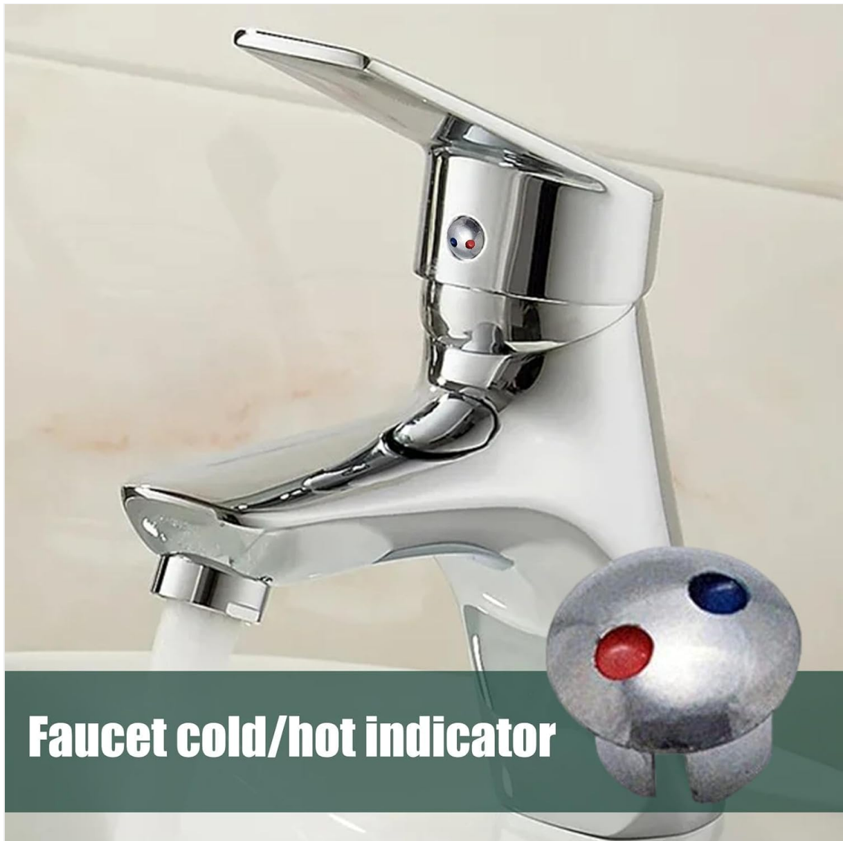
Image 3.1: The indicator provides a clear visual cue for water temperature.