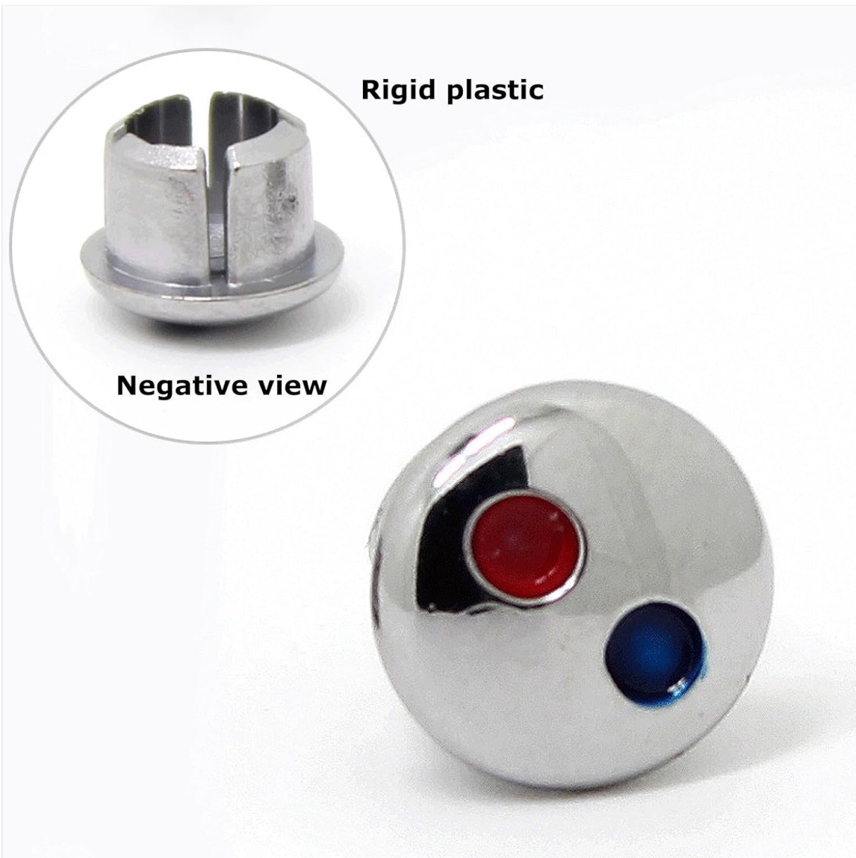
Image 6.2: View of the indicator's construction, highlighting the rigid plastic material.