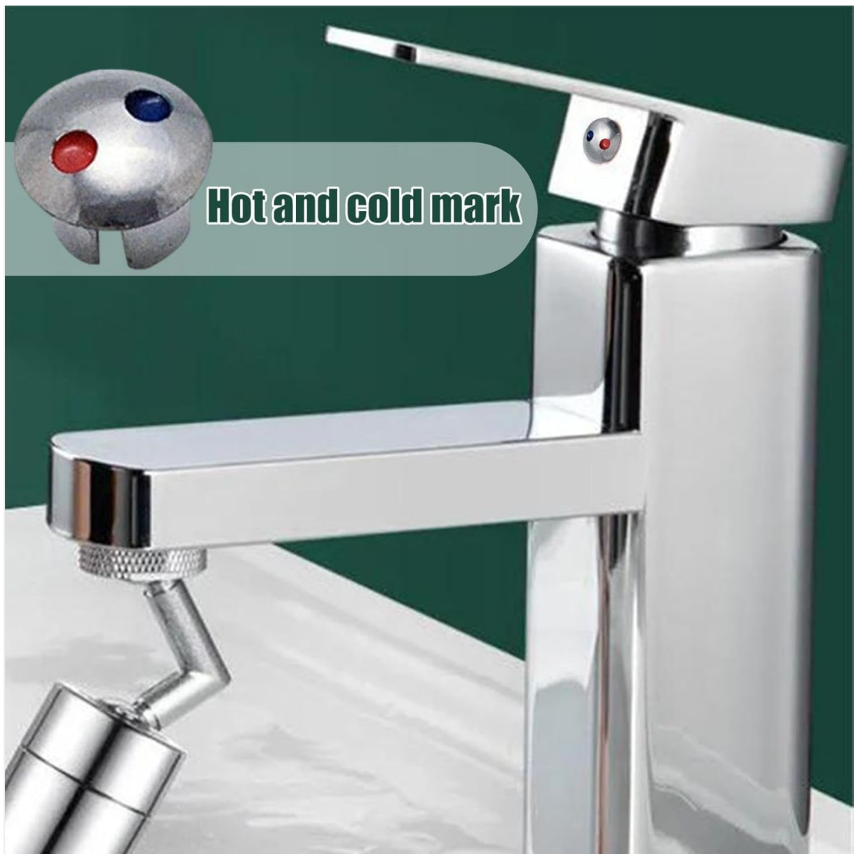
Image 2.2: Example of an installed hot/cold indicator on a faucet handle.