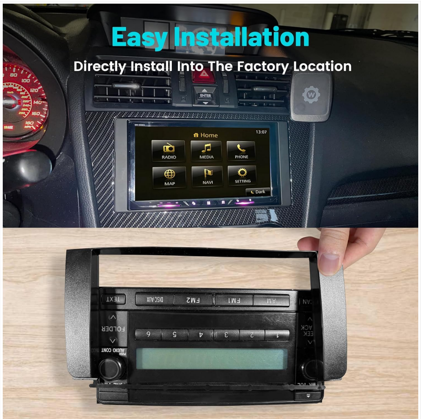
Figure 5.1: Easy Installation. This image demonstrates the installation process, showing a factory radio being replaced by an aftermarket double DIN unit using the dash kit, highlighting the direct fit into the factory location.