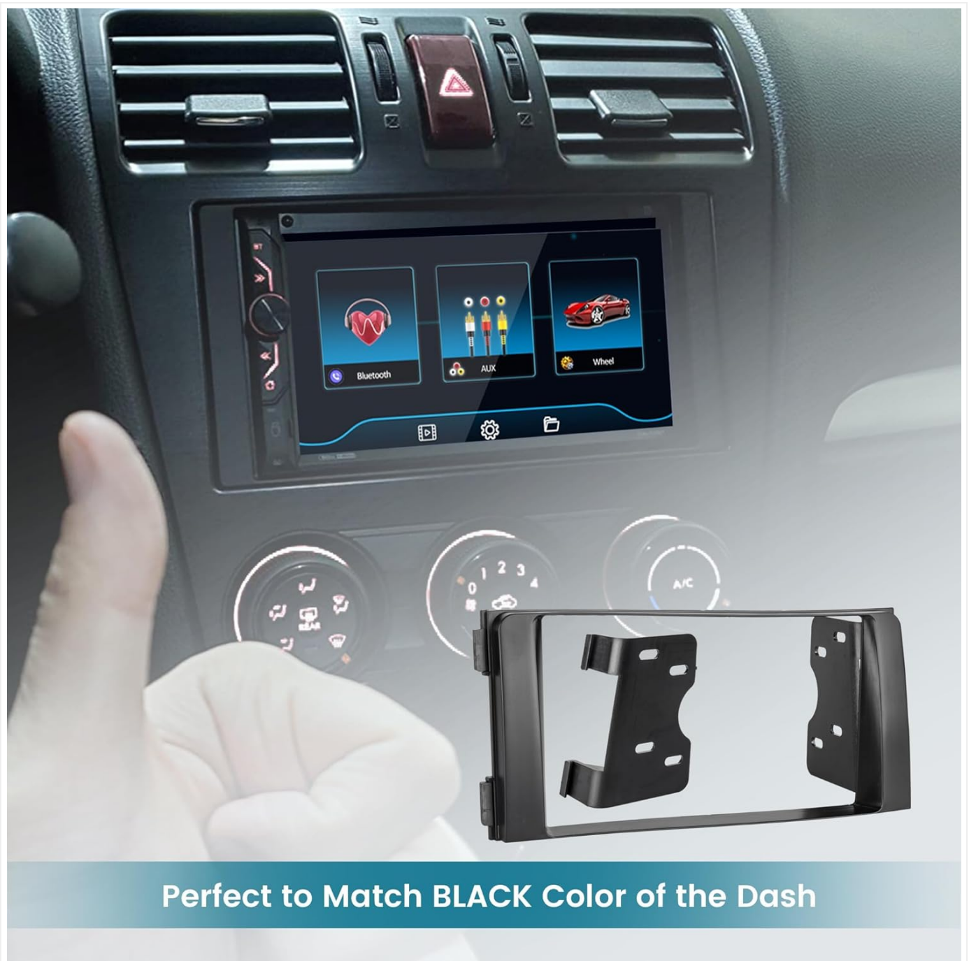
Figure 5.3: Perfect Match. This image shows the dash kit installed in a vehicle's dashboard, demonstrating how it seamlessly integrates and matches the black color of the surrounding interior.