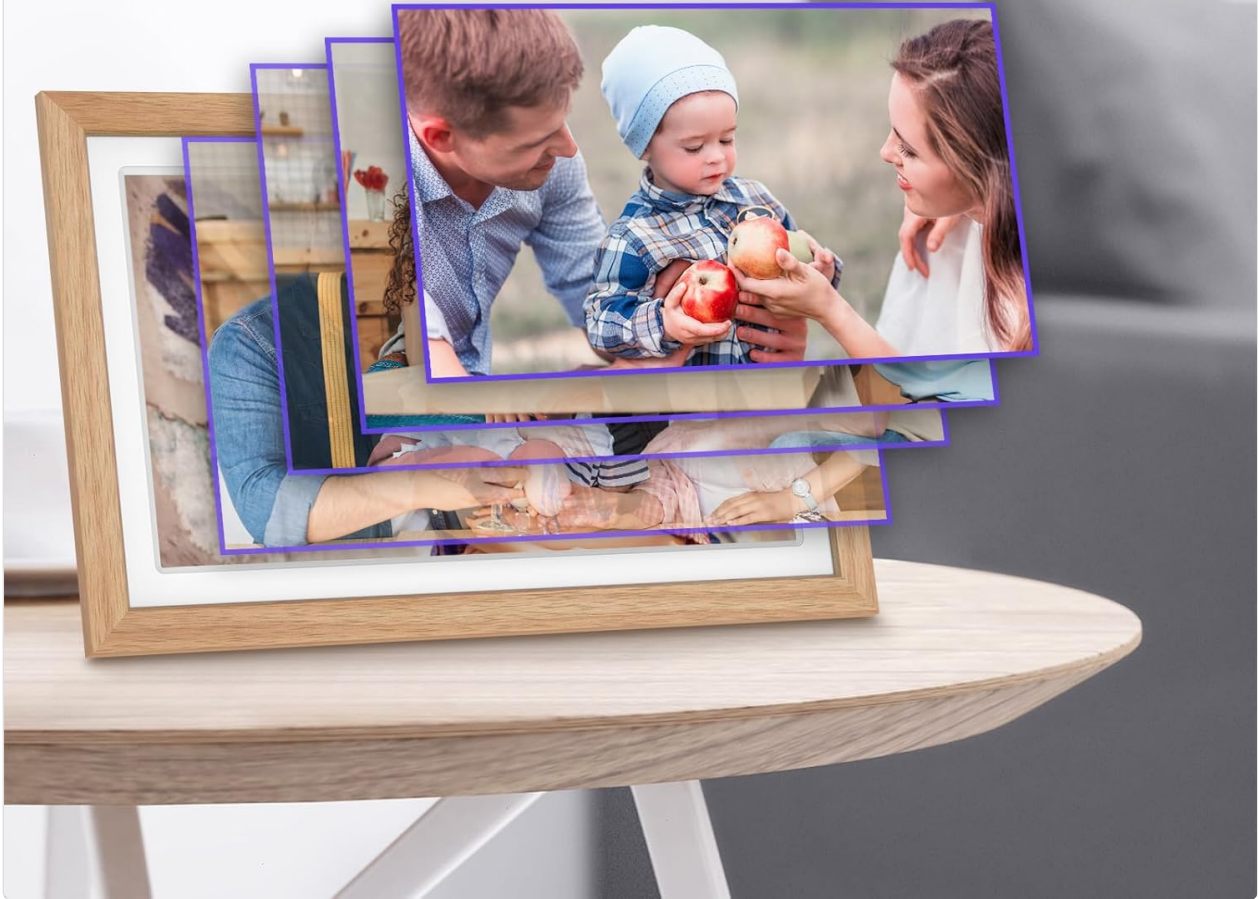
Image: A stack of digital photos appearing to be stored within the frame, illustrating the built-in 32GB internal storage capacity.