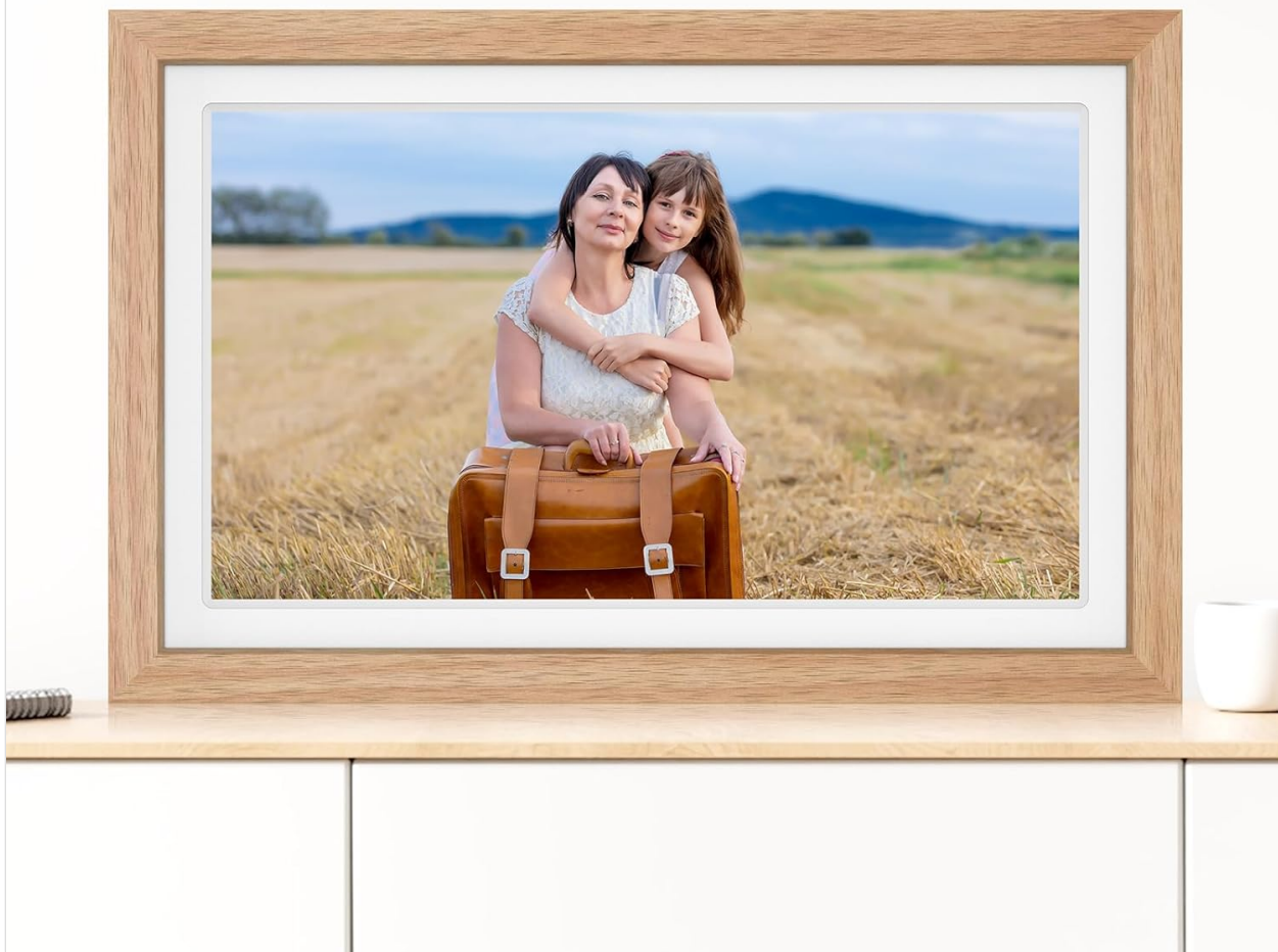
Image: The Forc 21.5 Inch Digital Picture Frame, showcasing its large display and accompanying remote control.