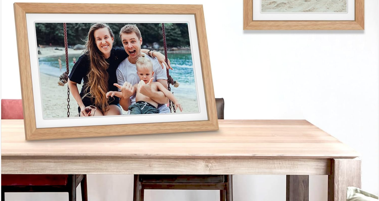
Image: The digital picture frame shown in both landscape and portrait orientations, demonstrating its wall-mountable design and auto-rotate feature.