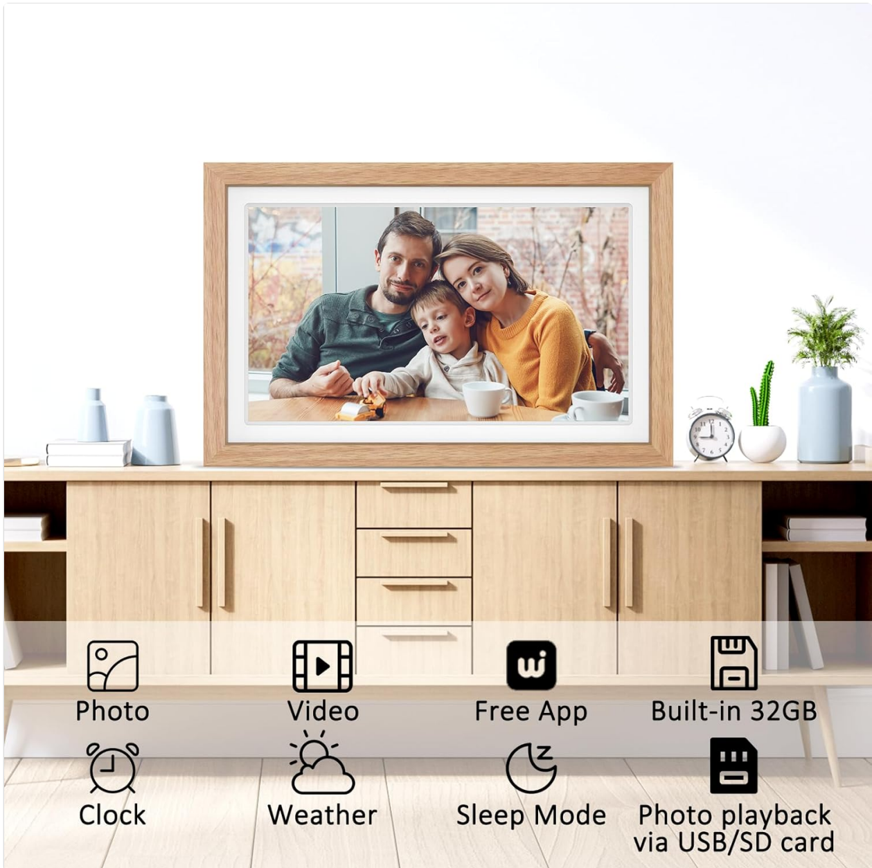
Image: The Forc Digital Picture Frame displaying a family photo, surrounded by icons representing its features: Photo, Video, Free App, Built-in 32GB, Clock, Weather, Sleep Mode, and Photo playback via USB/SD card.