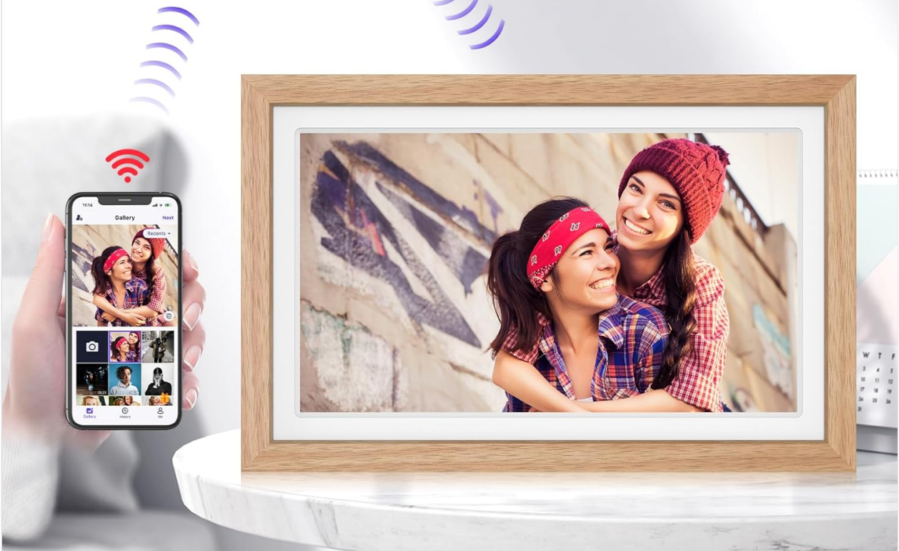
Image: Illustration showing various methods to upload photos and videos to the digital frame: via the Uhaul App, USB drive, or SD/MMC card.