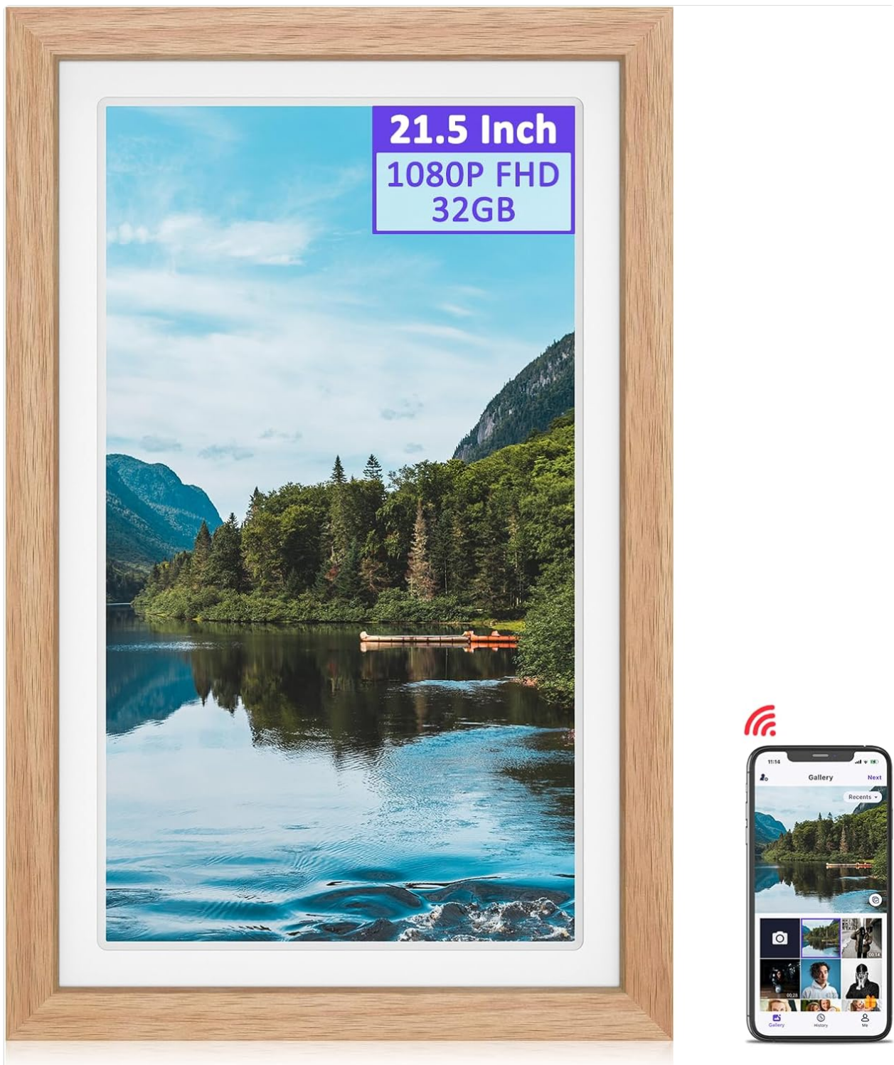
Image: A Forc 21.5 Inch Digital Picture Frame displaying a scenic landscape, highlighting its large screen and 1080P FHD resolution.