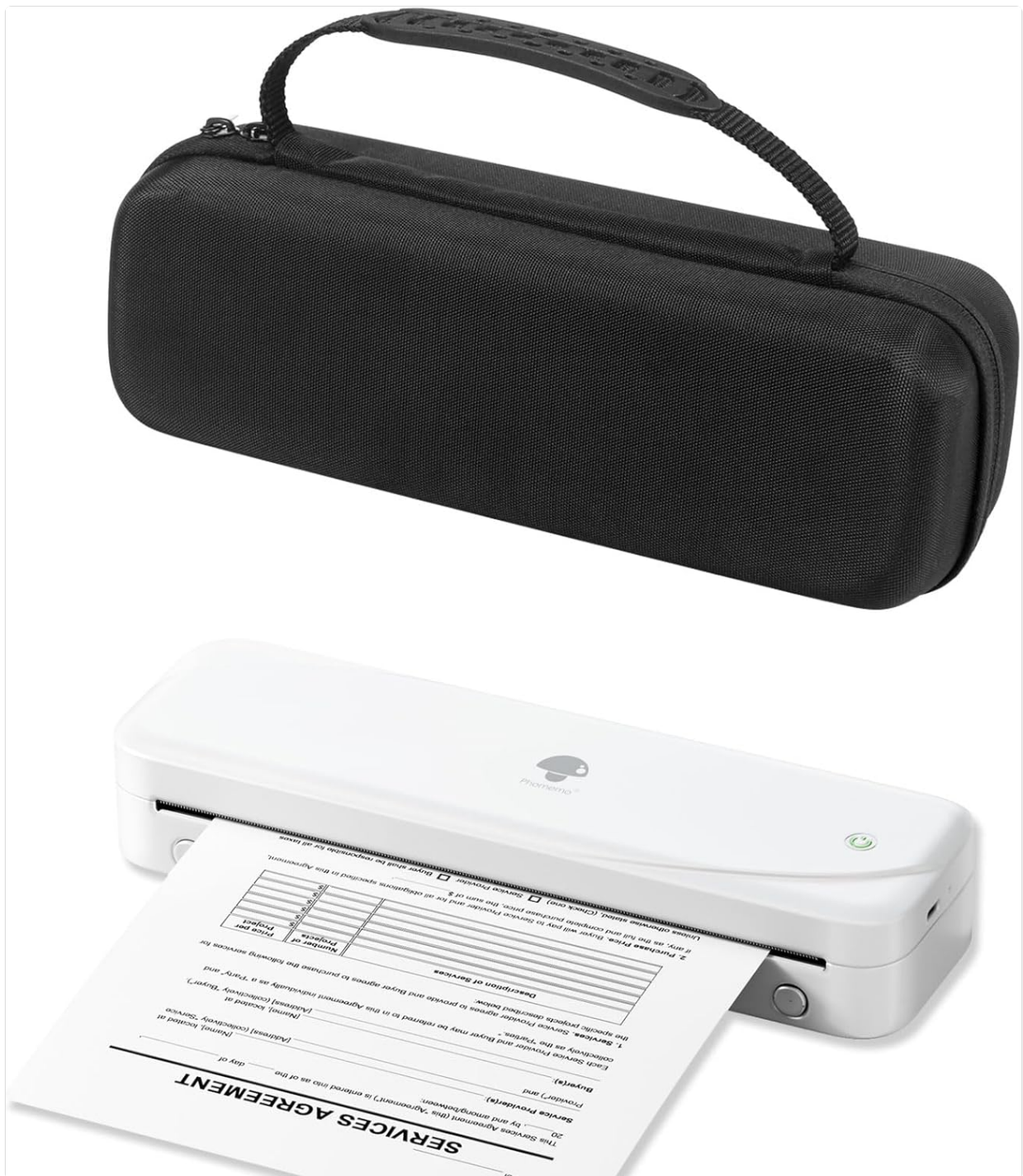
Figure 2.1: Phomemo M833 Thermal Printer with its protective carrying case.