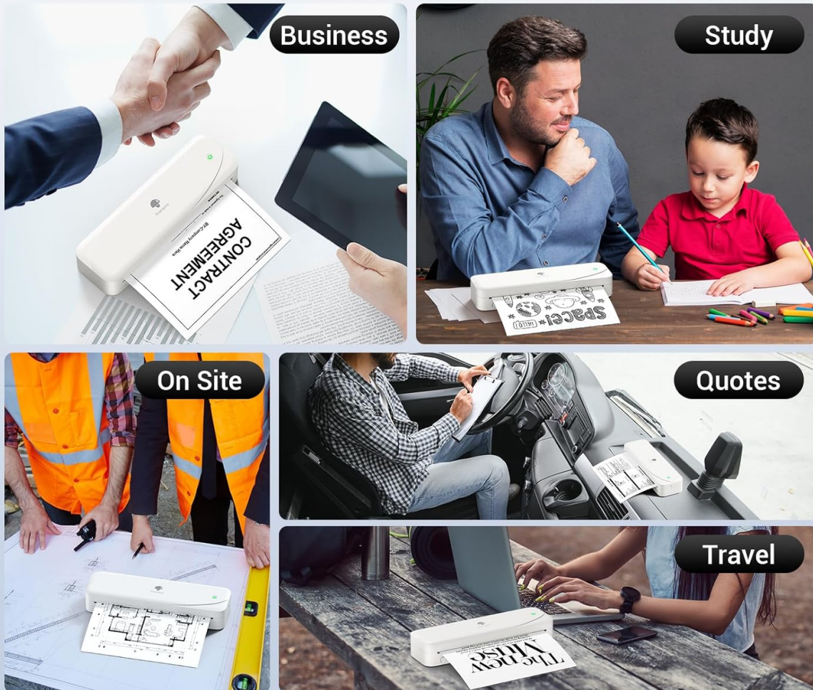
Figure 2.2: The M833 printer's capabilities, including 300dpi resolution, 2600mAh battery, and supported file formats like Word, Excel, TXT, JPG, and PDF.