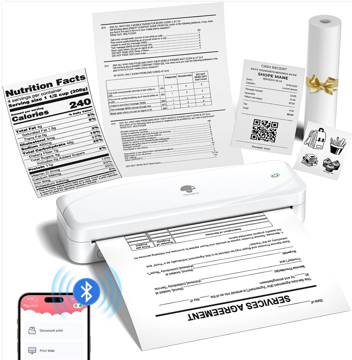
Figure 3.1: The Phomemo M833 printer actively printing a document, illustrating the paper feeding mechanism.