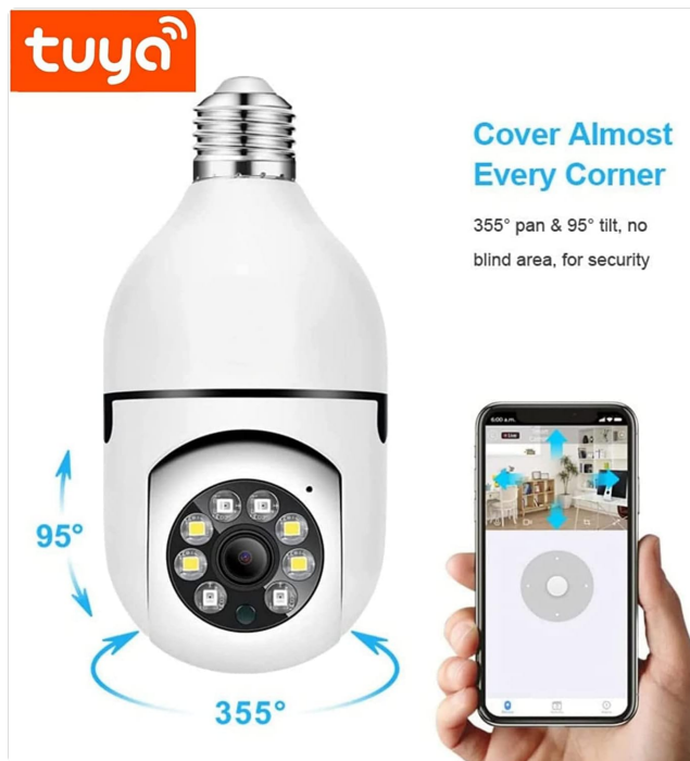
Image: The camera's pan and tilt functionality allows for comprehensive coverage.