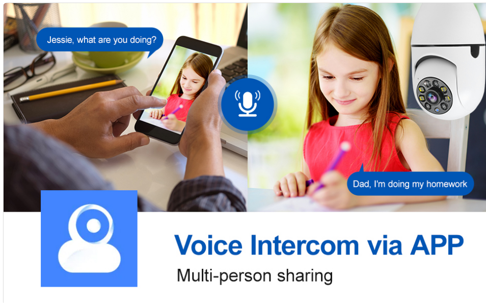
Image: Illustrates the two-way audio feature, enabling communication through the camera.