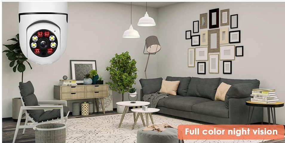
Image: Demonstration of the camera's dual night vision modes: infrared and full color.