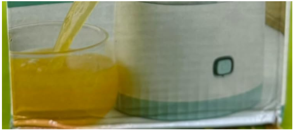
Image: A six-step visual guide showing how to operate the juicer, from pressing the button to collecting juice.