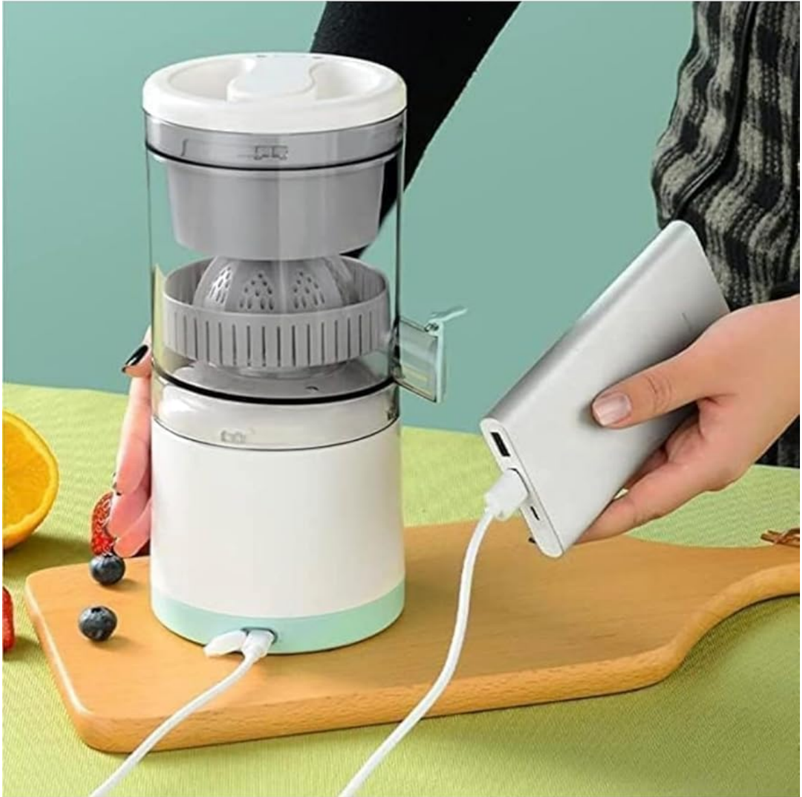
Image: The juicer being charged using a USB cable connected to a power bank.