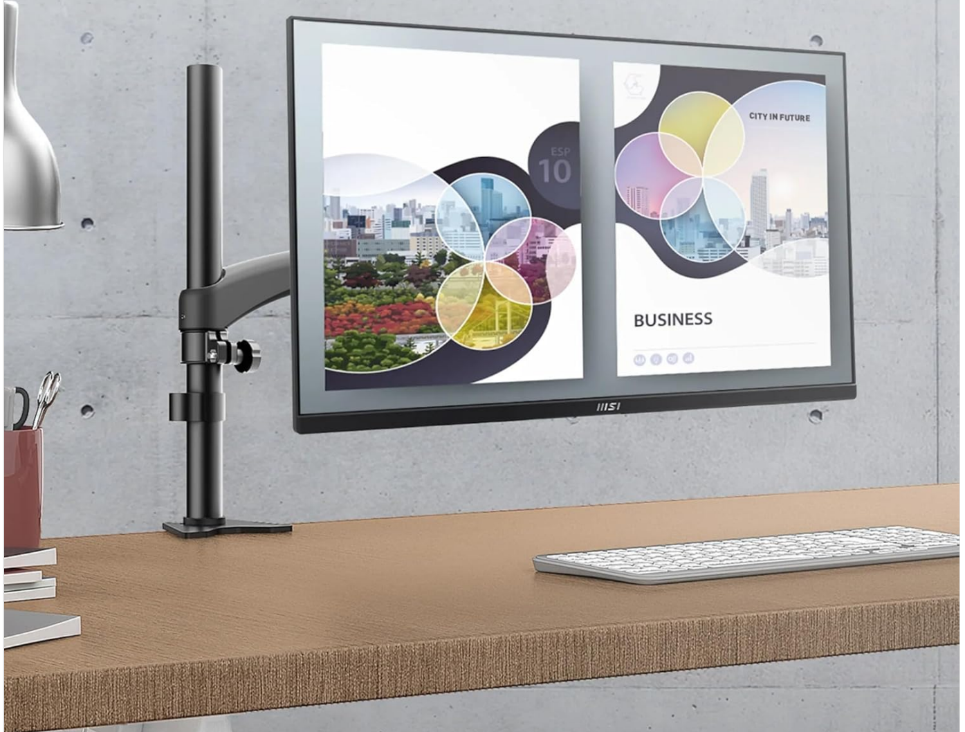
Image: The MSI PRO MP225 monitor displayed on a VESA-compatible monitor arm, demonstrating its flexibility for various desk setups. A VESA mount icon is visible in the top right corner.