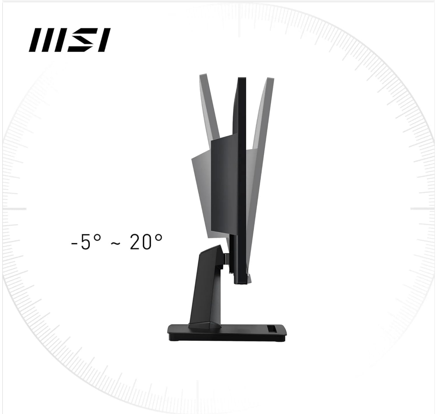
Image: A diagram illustrating the tilt adjustment capability of the MSI PRO MP225 monitor, showing a range from -5 degrees to +20 degrees for ergonomic viewing.

and tilt it forwards or backwards within its specified range.