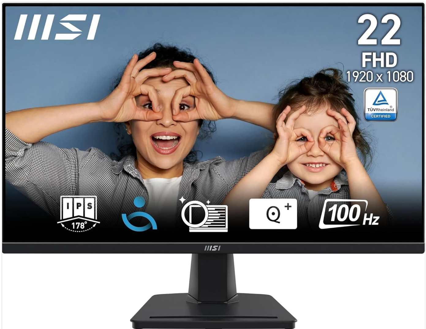
Image: Front view of the MSI PRO MP225 monitor, showcasing its 21.5-inch Full HD display. Key features like IPS technology, 100Hz refresh rate, and TÜV Rheinland certification are highlighted with icons.