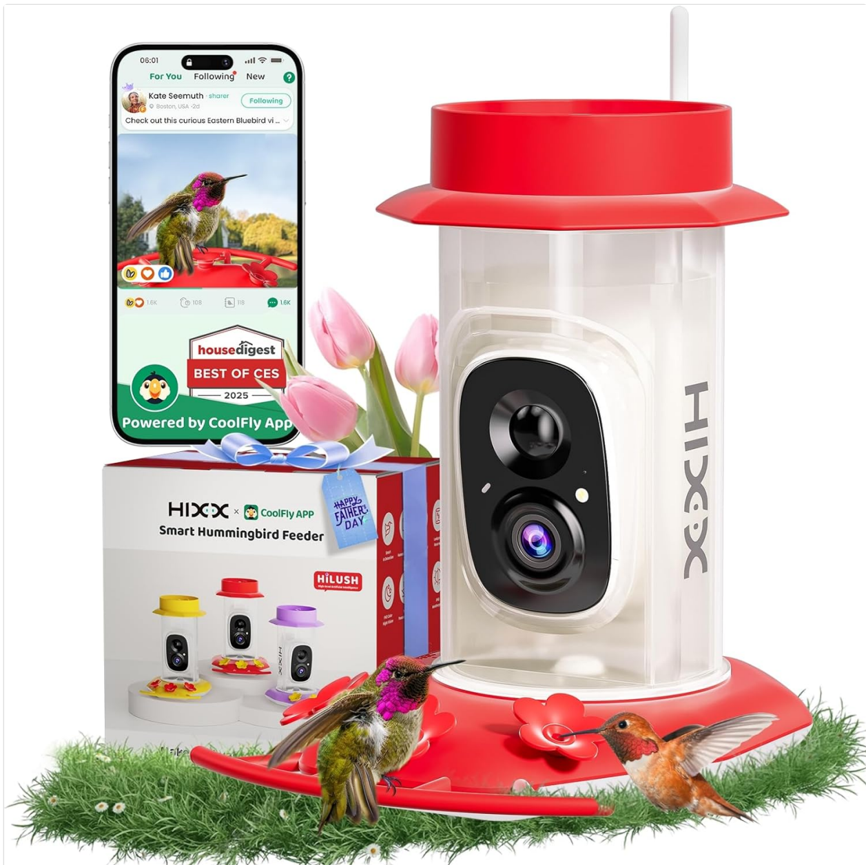
Image: HIXX Smart Hummingbird Feeder with all components and packaging.