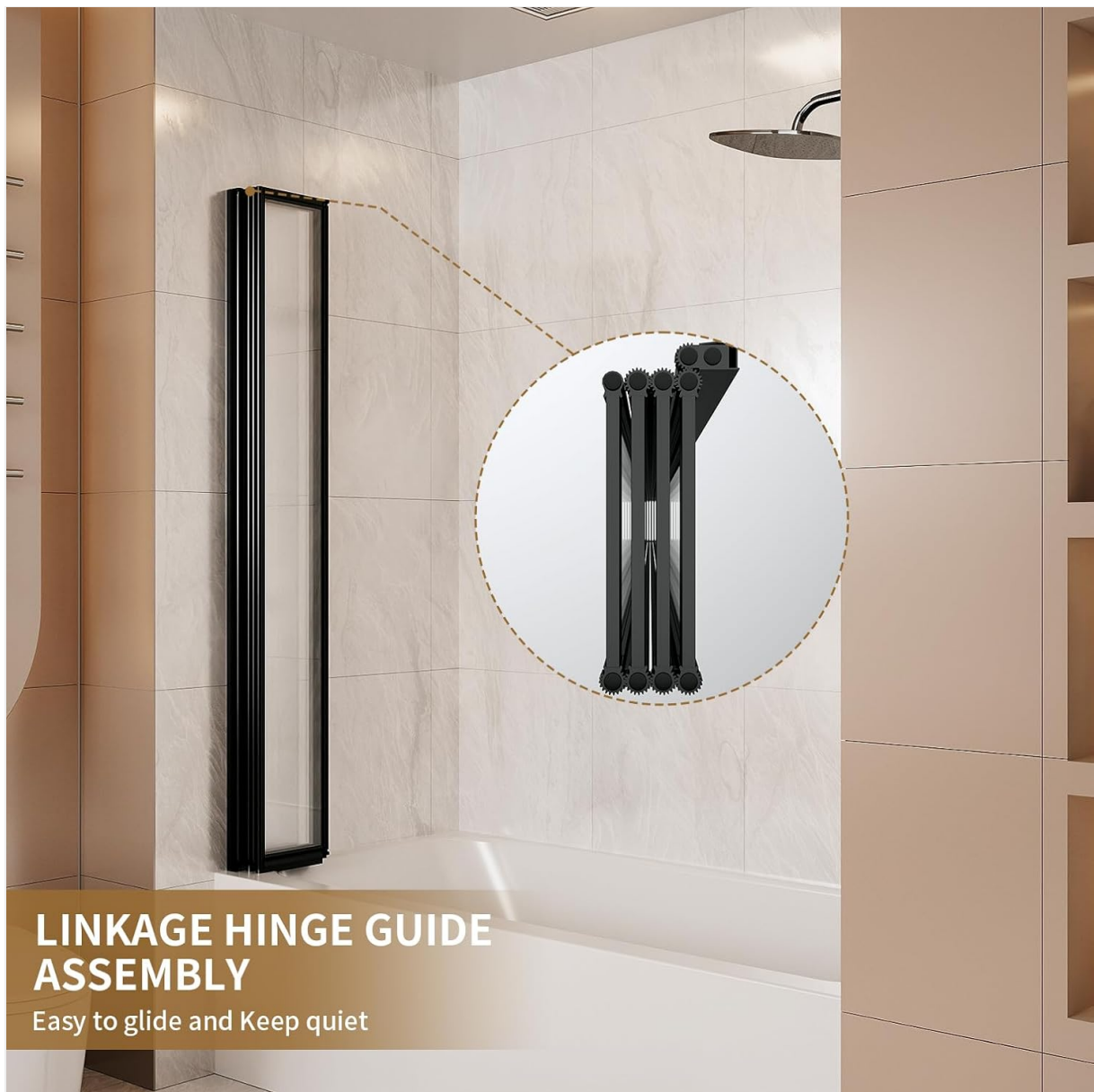
Figure 4: Linkage Hinge Guide Assembly - The specialized hinges ensure easy and quiet operation when folding the door.