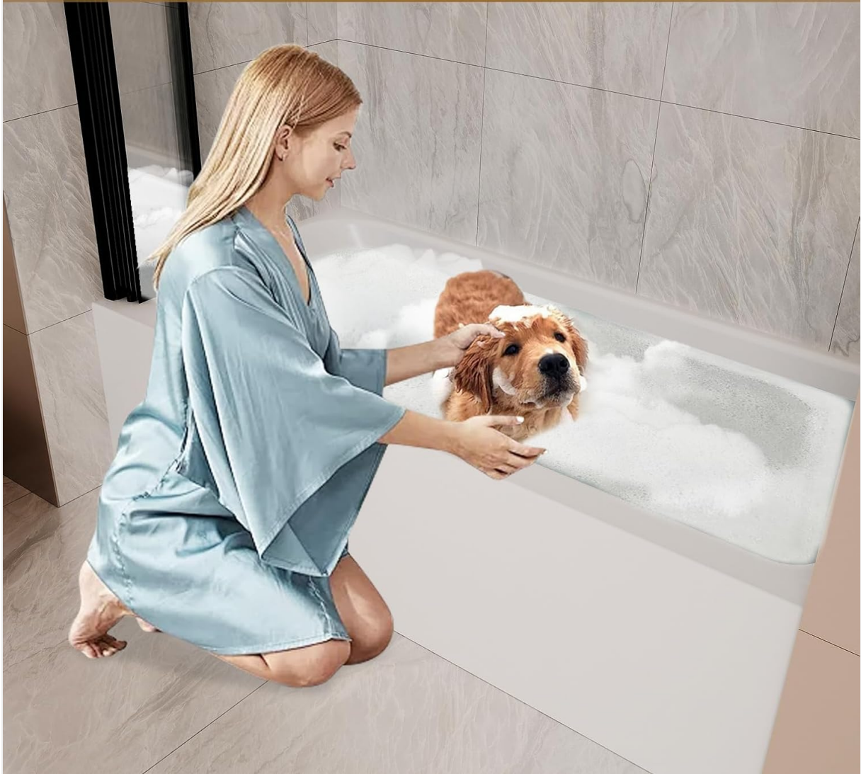
Figure 3: Fully Folding Design - The door folds completely against the wall, providing full access to the bathtub for various activities.