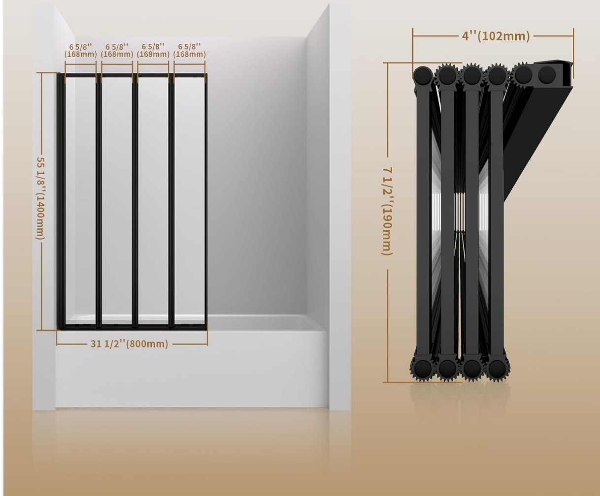
Figure 2: Product Dimensions - Detailed measurements of the shower door panels and overall size.