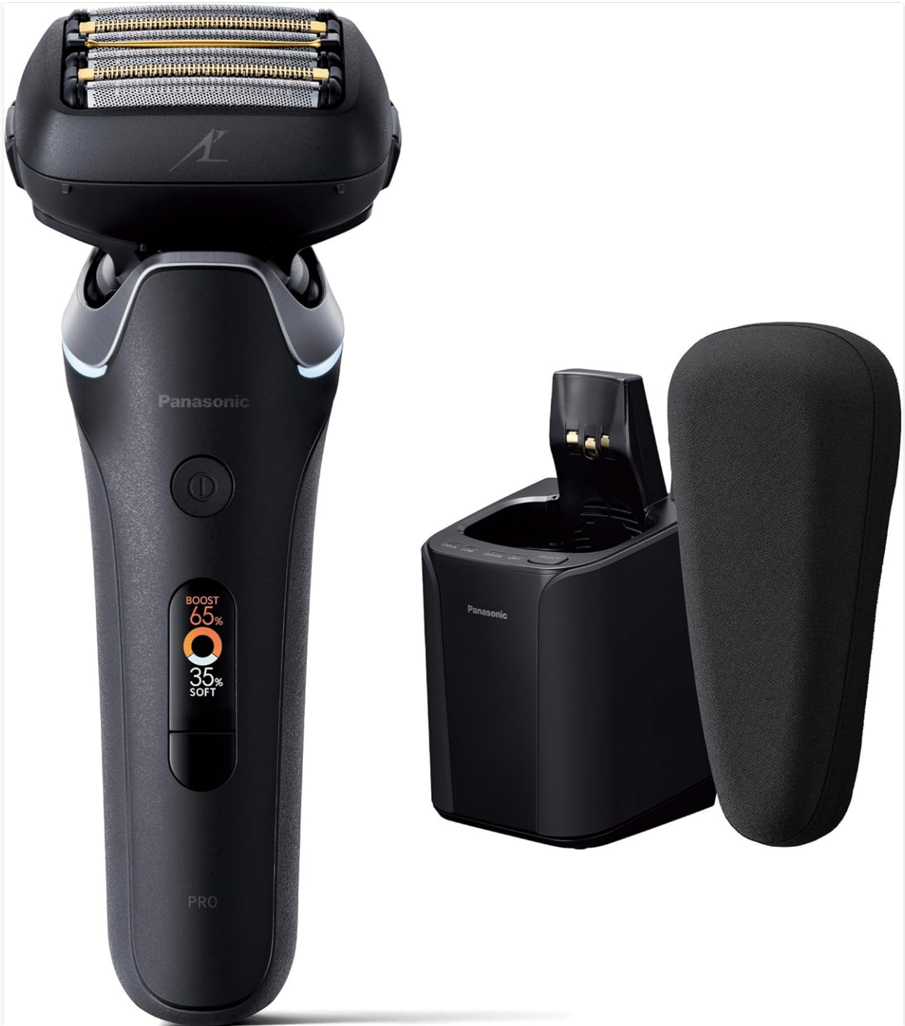
Figure 1.1: Panasonic LAMDASH PRO 6-Blade Electric Shaver ES-L690U-K with its accessories.