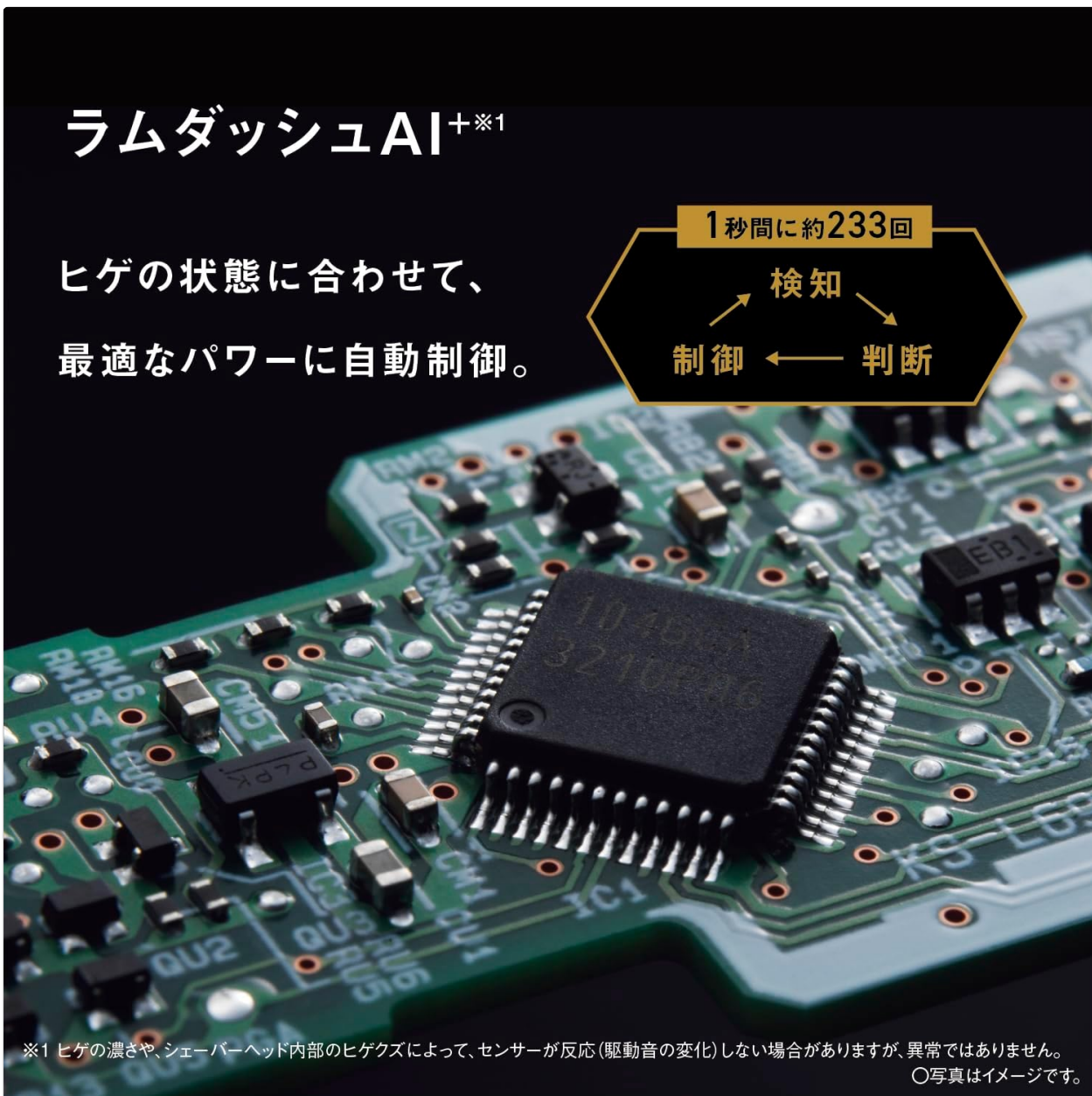
Figure 2: Lamdash AI+ chip, detecting and controlling power.

The Lamdash AI+ system automatically adjusts shaving power based on beard density. This ensures optimal performance for both thick and sparse beard areas, providing a consistent and comfortable shave.