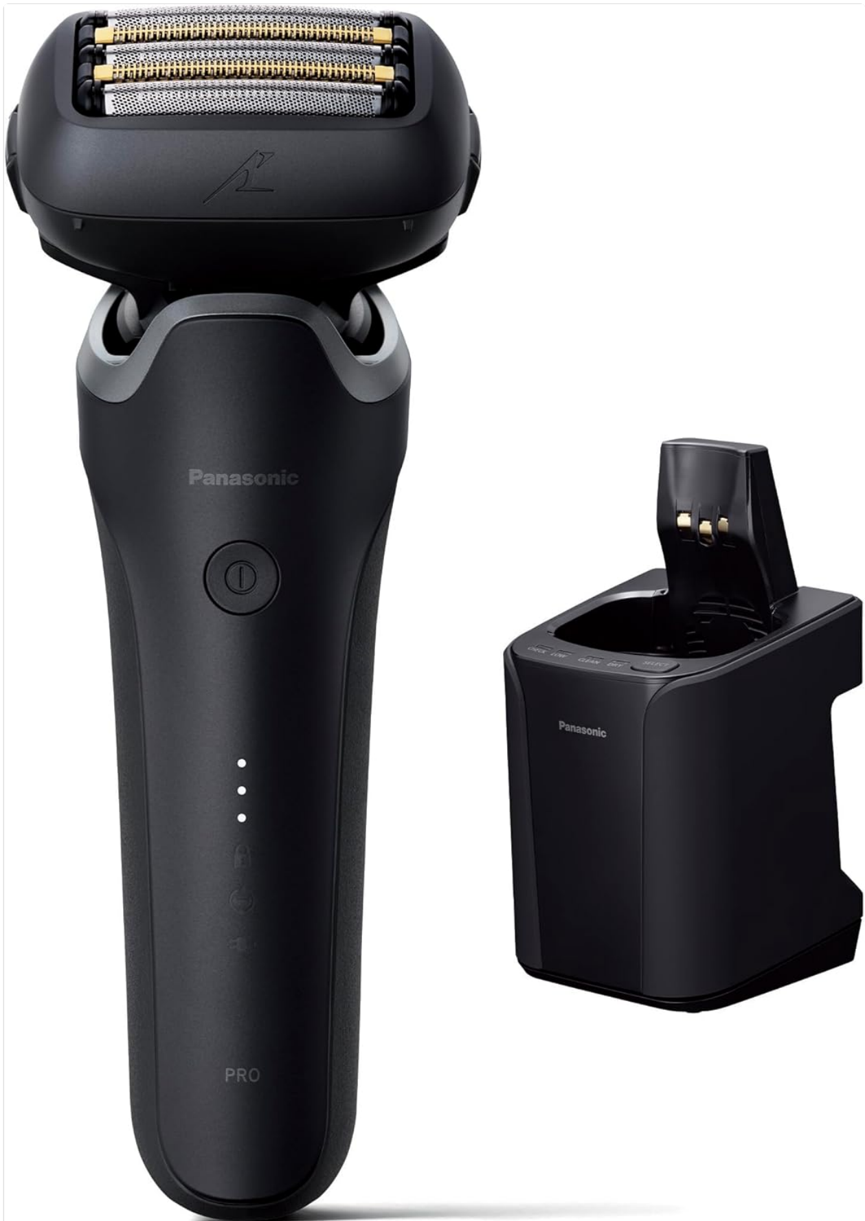
Figure 1: Panasonic Lamdash PRO 5-Blade Electric Shaver ES-L570D-K with automatic cleaning and charging station.