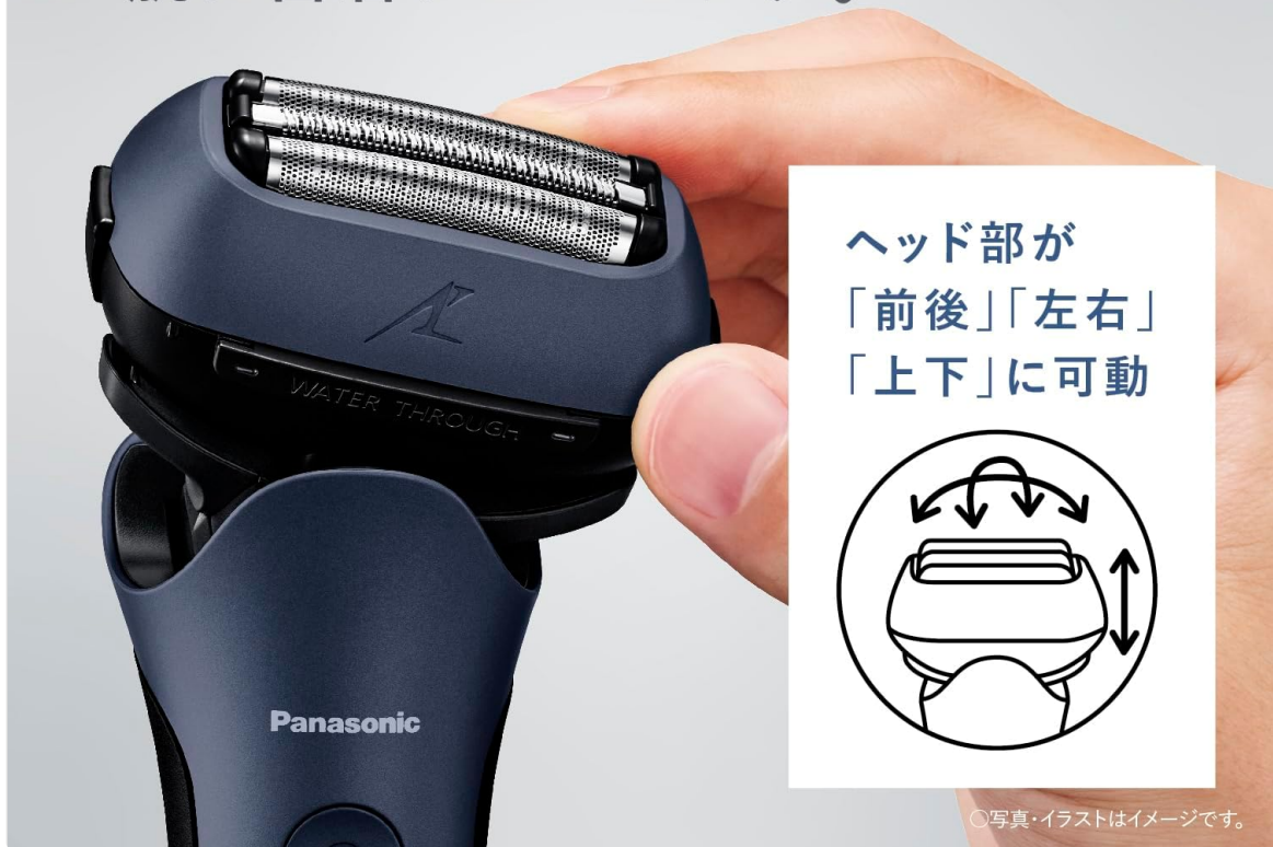
Image: A detailed view of the shaver's 3-blade system, showing two deep shaving foils and a central trimmer blade.