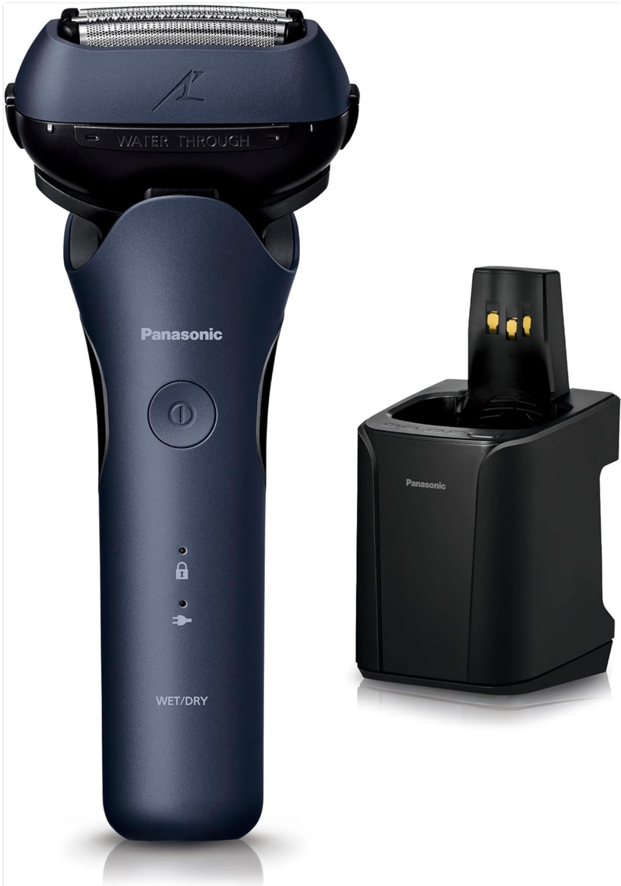
Image: The Panasonic Lamdash 3-Blade Electric Shaver ES-L380W-A in blue, shown alongside its automatic cleaning and charging station.