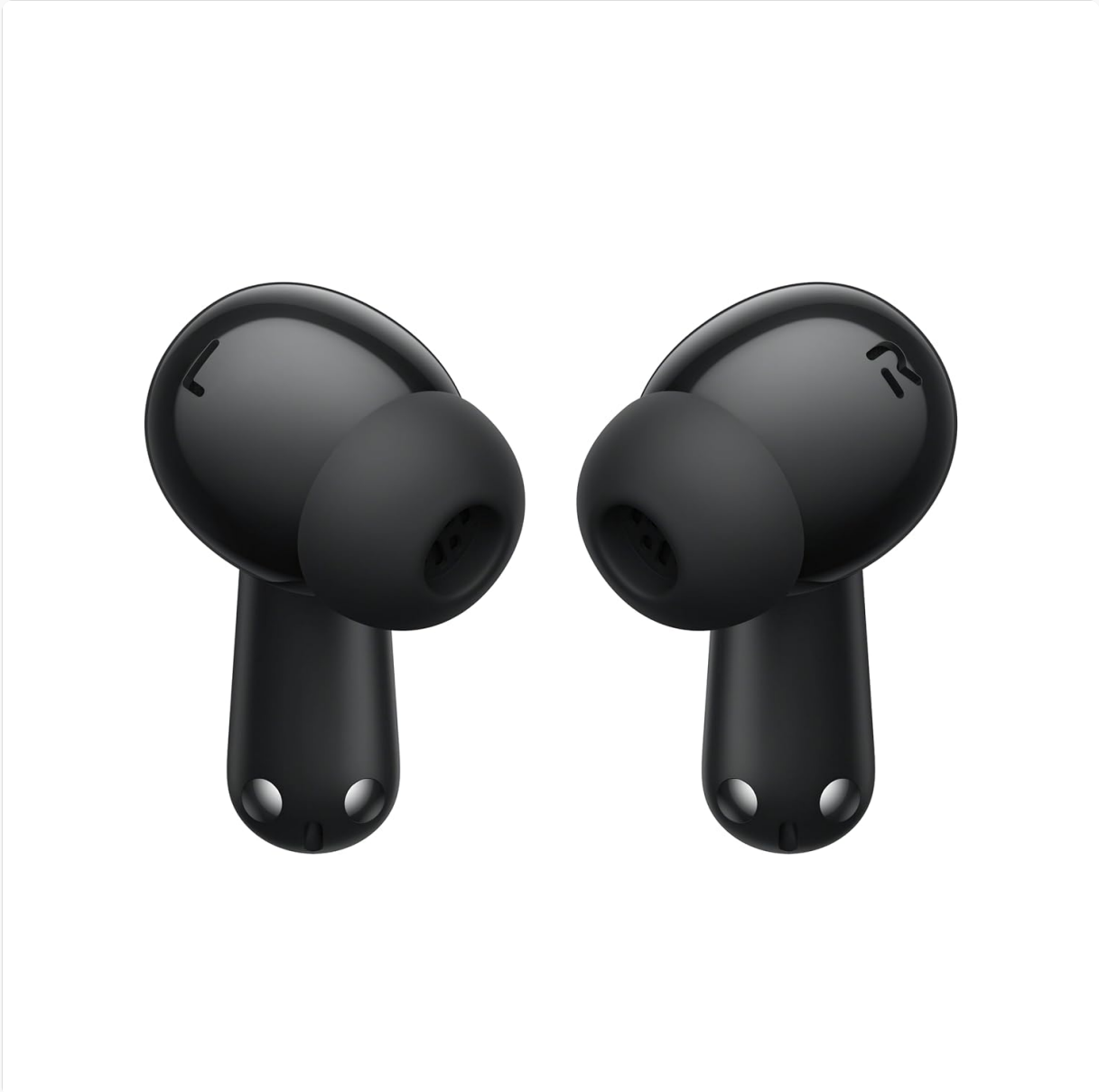
Image 4.1: Front view of the OPPO Enco Air4 Pro earbuds. This image highlights the ergonomic design and the eartips, which are essential for a proper fit and seal in the ear canal.

Select the appropriate eartip size for a secure and comfortable fit. A good seal is crucial for optimal sound quality and noise cancellation performance.