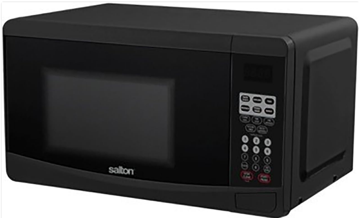
Image 1.1: Salton Microwave Oven, Model 20PX98-L. This image shows the compact black microwave oven with its door and control panel.

The Salton Microwave Oven (Model: 20PX98-L) is a compact and efficient appliance designed for convenient meal preparation. With a 0.7 cubic feet capacity and 700 watts of cooking power, it offers a range of features to simplify your cooking experience.