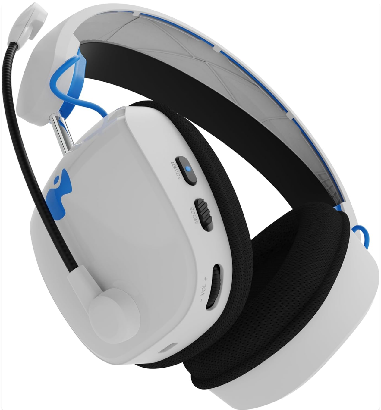
Figure 5: Microphone Flip-to-Mute Functionality

This image demonstrates the microphone's flip-to-mute feature, showing its active and muted positions.