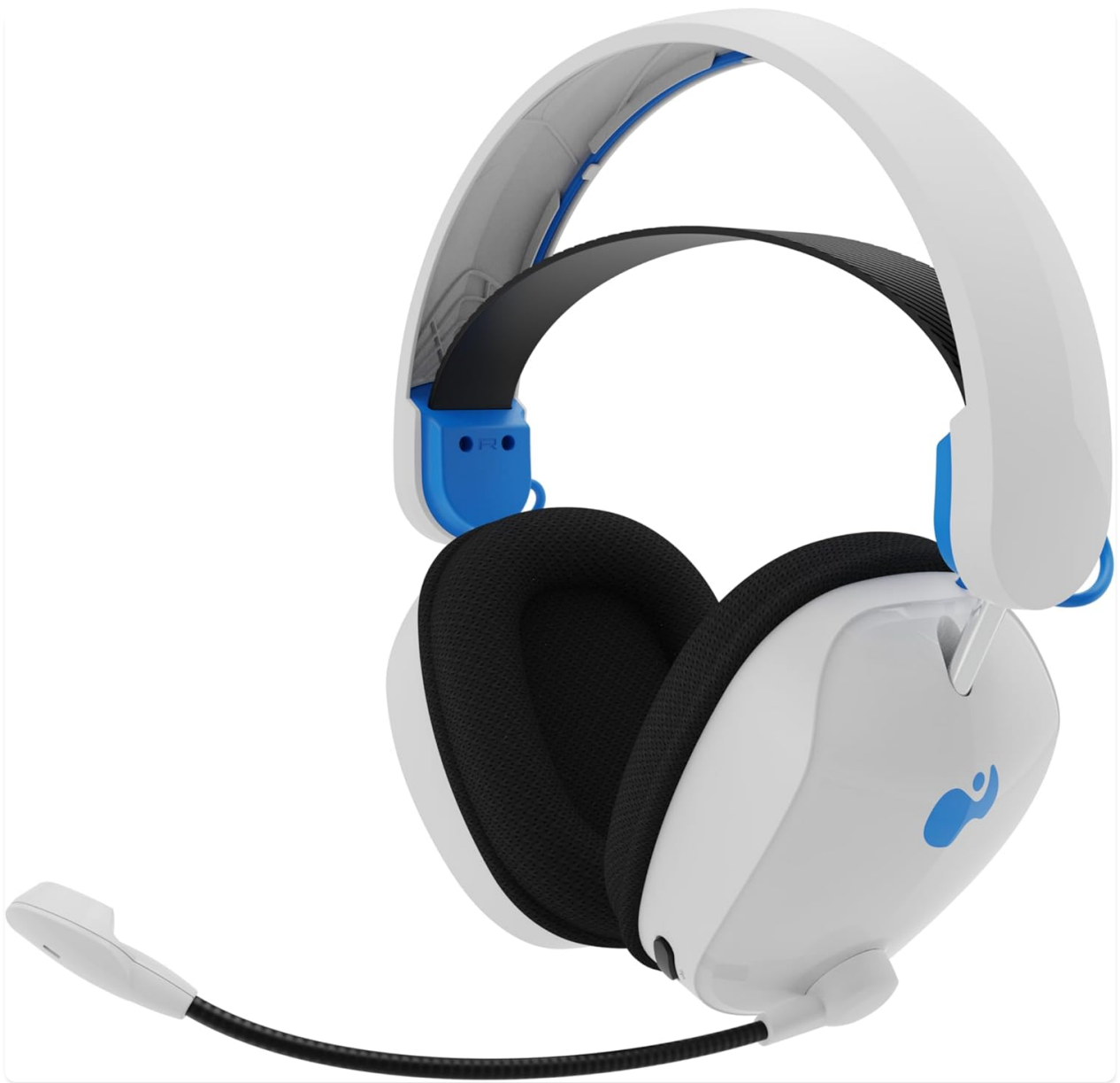
Figure 1: PDP Phantom Air Dual-Mode Wireless Gaming Headset (White PlayStation Edition)

This image displays the overall design of the PDP Phantom Air headset in white with blue accents, featuring over-ear cups and an attached microphone.