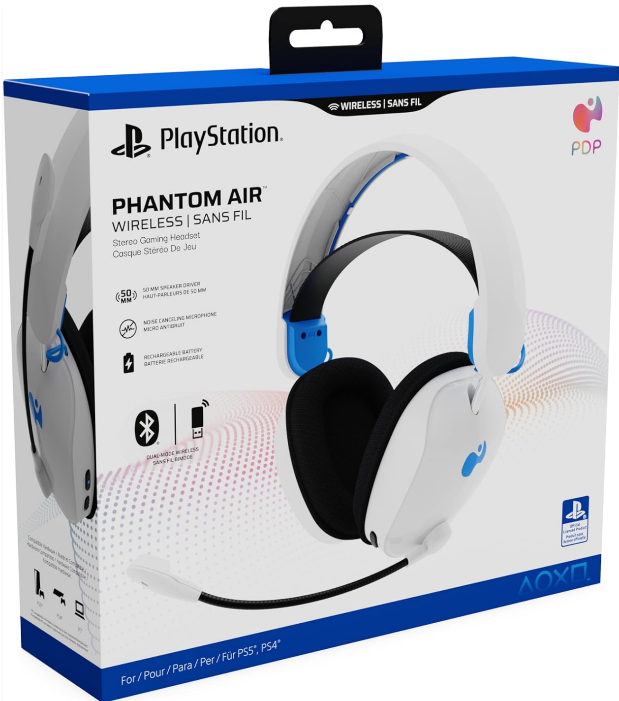
Figure 2: Product Packaging

This image shows the retail packaging of the PDP Phantom Air headset, indicating its PlayStation licensing and key features.