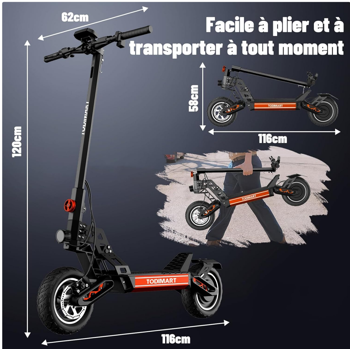
Image: Illustration of the TODIMART S9 electric scooter's folding mechanism, showing its compact size when folded for easy transport.

The scooter is designed for easy folding and portability. To fold, disengage the locking mechanism on the handlebar stem and fold it down towards the deck. Ensure it is securely latched for transport. The folded dimensions are approximately 116 x 62 x 54 cm, and it weighs 26.5 kg.