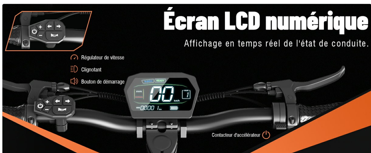
Image: Digital LCD screen mounted on the handlebar, displaying speed and riding statistics. Includes controls for cruise control, turn signals, and power.