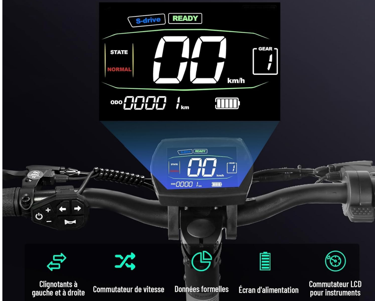
Image: Close-up of the TODIMART S9's intelligent LCD display, showing speed, battery level, and mode indicators.