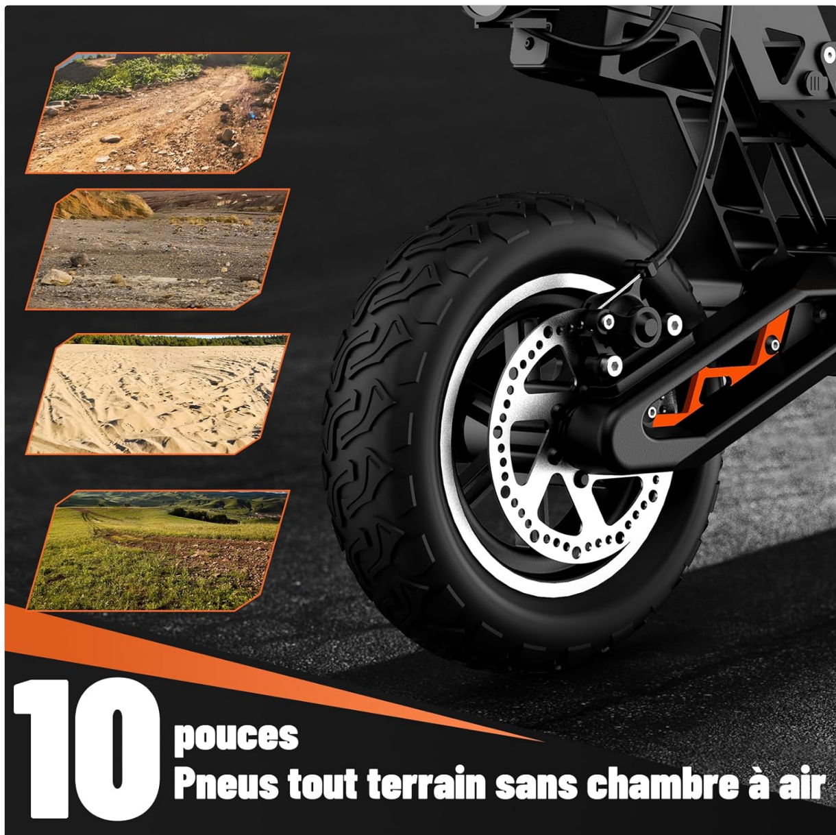
Image: Detailed view of the TODIMART S9's 10-inch tubeless all-terrain tire, designed for durability and grip on various surfaces.