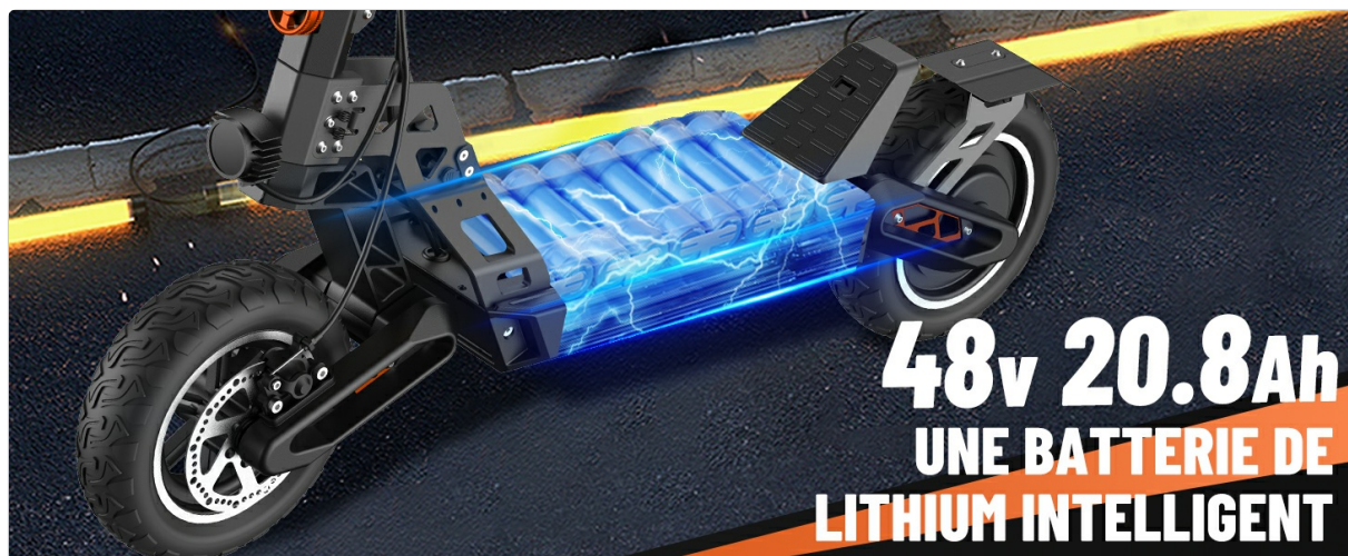
Image: Close-up of the TODIMART S9's 48V 20.8Ah lithium battery, highlighting its intelligent design for extended range.